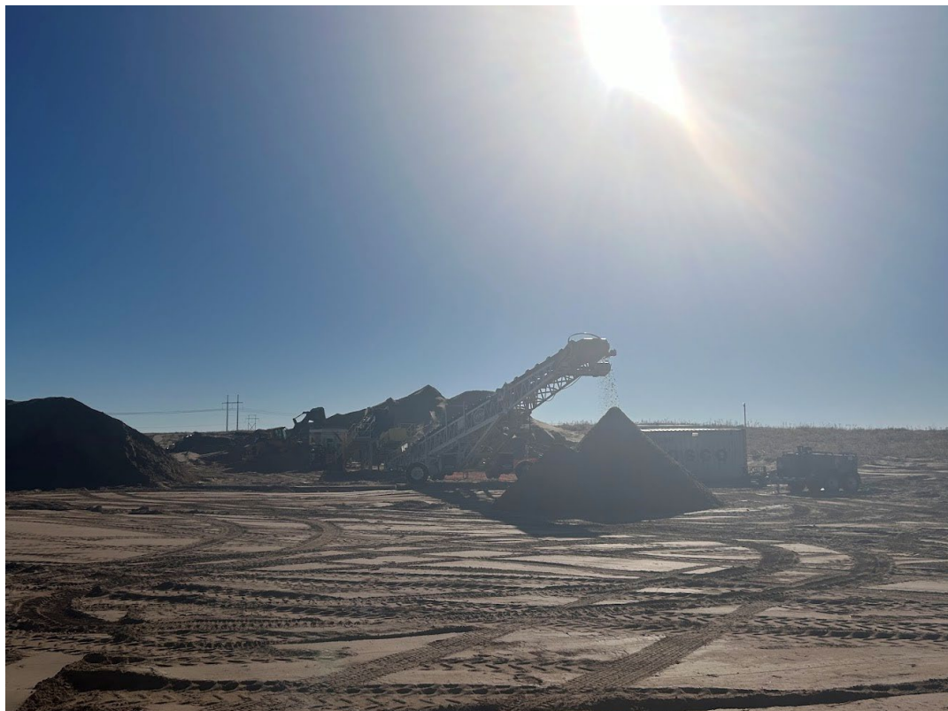
Photo 2: Portable conveyer and processing stockpiles, facing east.