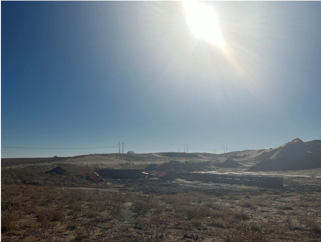
Photo 3: Portable conveyers, stockpiled material, and powerlines to the east of the site, facing east.