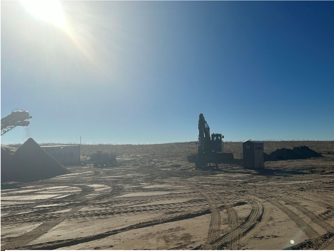
Photo 1: Track-mounted excavator and processing stockpile, facing south.