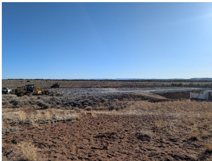
Regrading of waste rock pile was underway