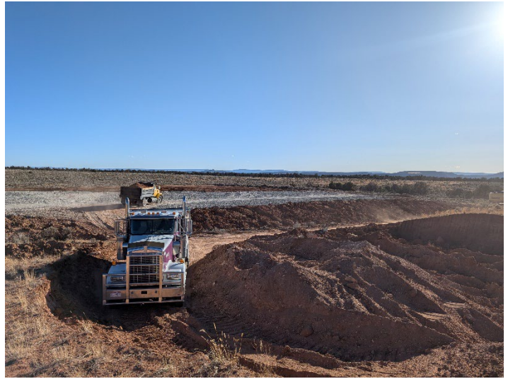
Regrading of waste rock pile was underway