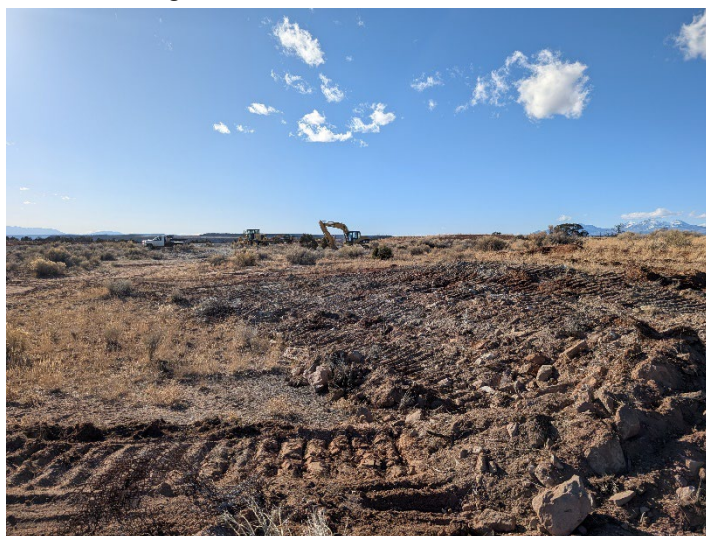
Regrading of waste rock pile was underway