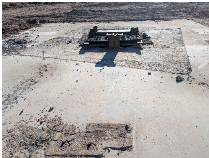
Concrete cap to be installed over this existing slab for shaft closure