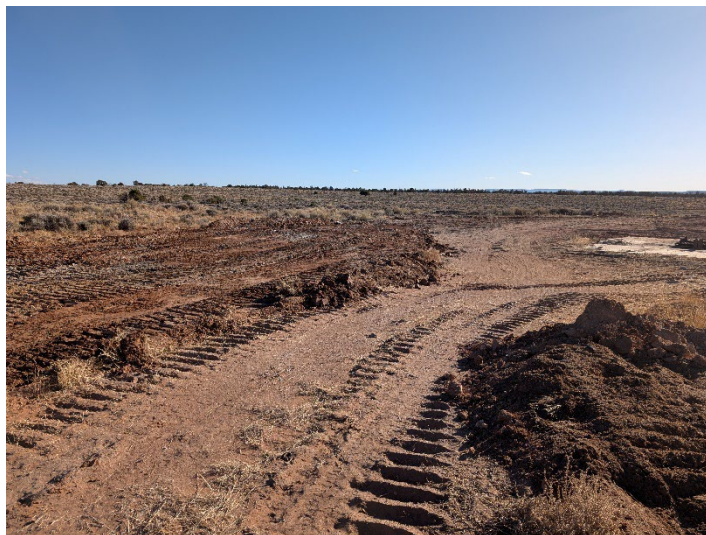
Buildings, structures and slabs have been removed