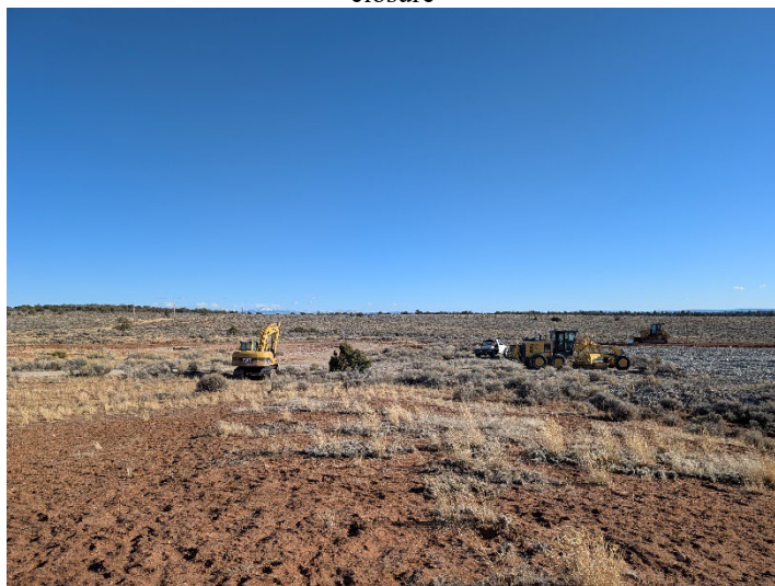
Regrading of waste rock pile was underway