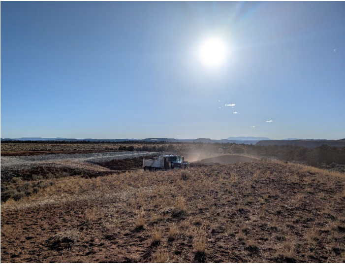
Regrading of waste rock pile was underway