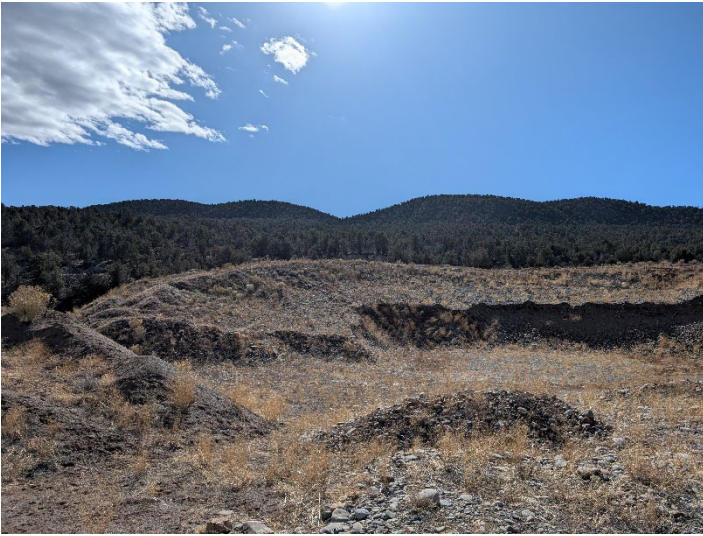
Pit area in east side of permit