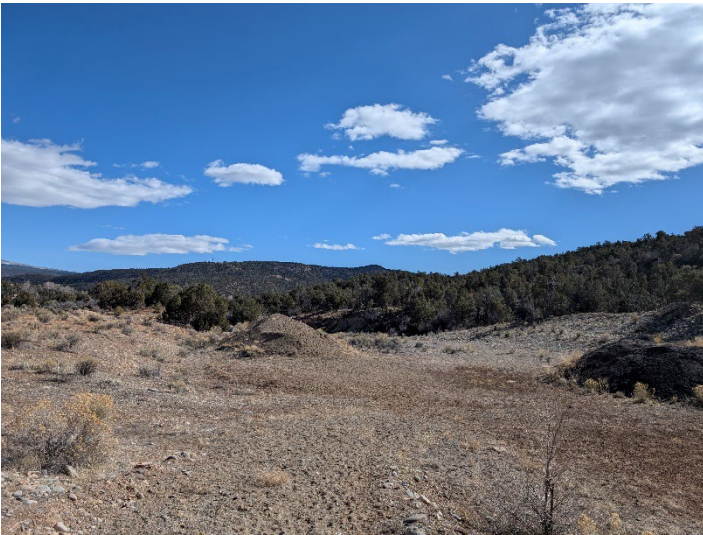
Small topsoil stockpile just near pit