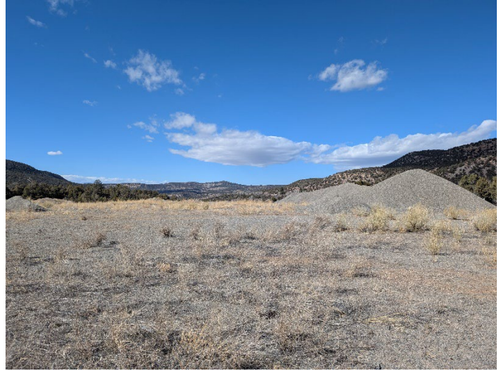
Stockpile area west of pit