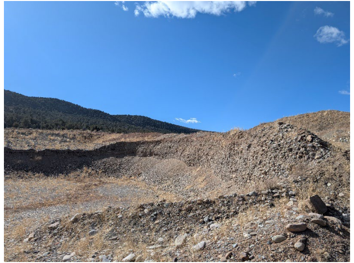
Pit area in east side of permit