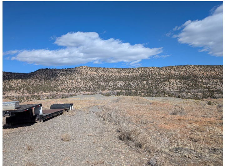
View from site entrance