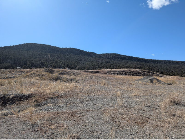
Stockpile area west of pit