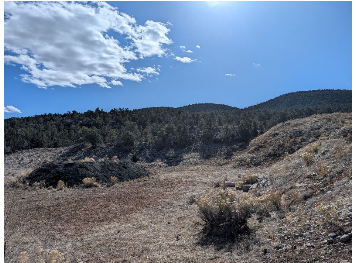
Crushed asphalt stockpile near pit