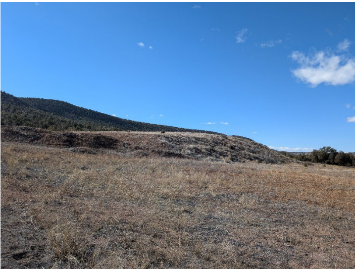
Overburden stockpile near site entrance