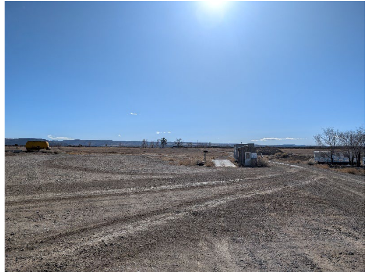
Scalehouse and storage area near site entrance