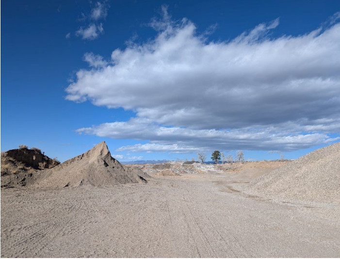
View from the south side of the Phase 1 area, facing north