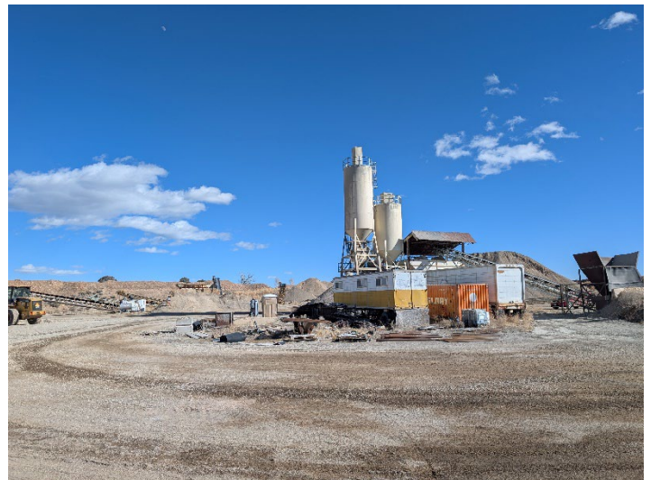
Processing area in the Phase 1 area