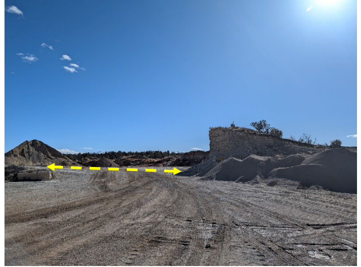
Approximate permit boundary between the Allen Pit and Angie Pit. Angie Pit in the foreground, Allen Pit in the background.