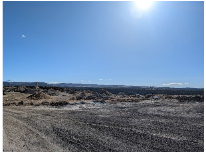
View of the Phase 1 area from the north side, facing south