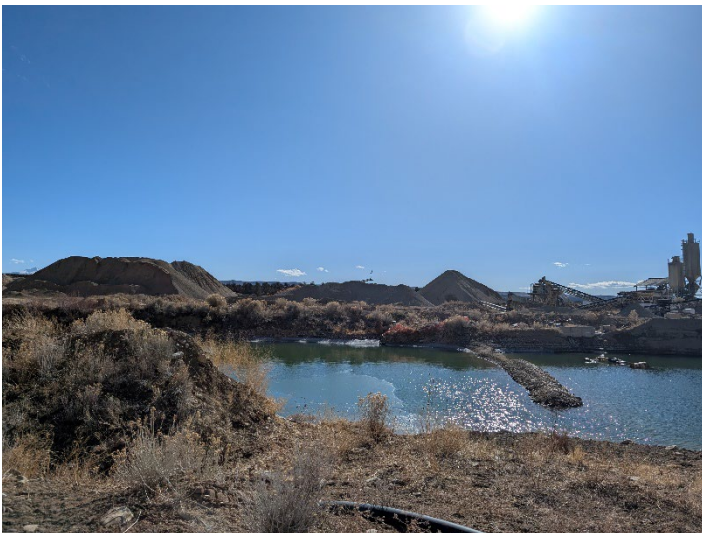
Wash pond in the Phase 1 area