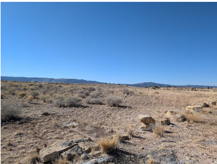
Reclamation area south side of pit