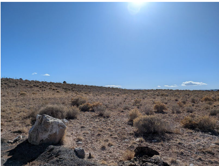
Reclamation area south side of pit