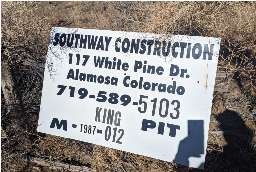
Figure 1. King Pit site sign. Photo captured February 4, 2025.