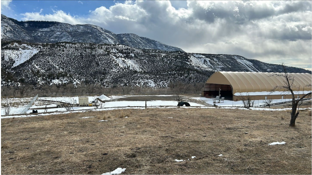
Figure 3: Lower pad

Number of Partial Inspection this Fiscal Year: 5