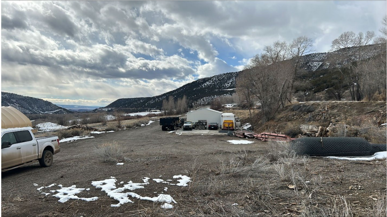
Figure 1: Upper pad