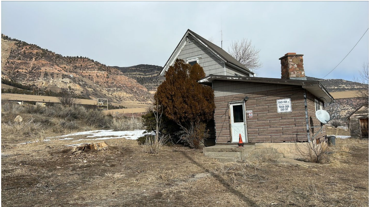
Figure 2: Office building

Number of Partial Inspection this Fiscal Year: 5