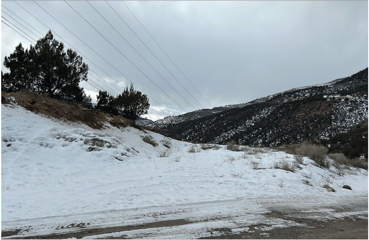
Figure 1: Possible location for cell phone tower

Number of Partial Inspection this Fiscal Year: 5