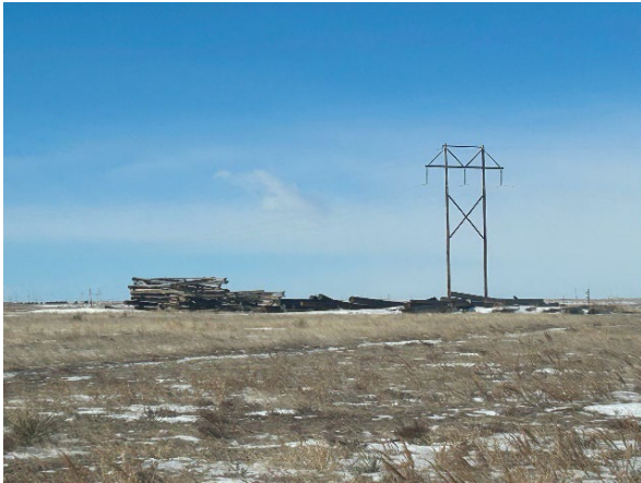
Photo 3: What appears to be a laydown area in support of the transmission lines.