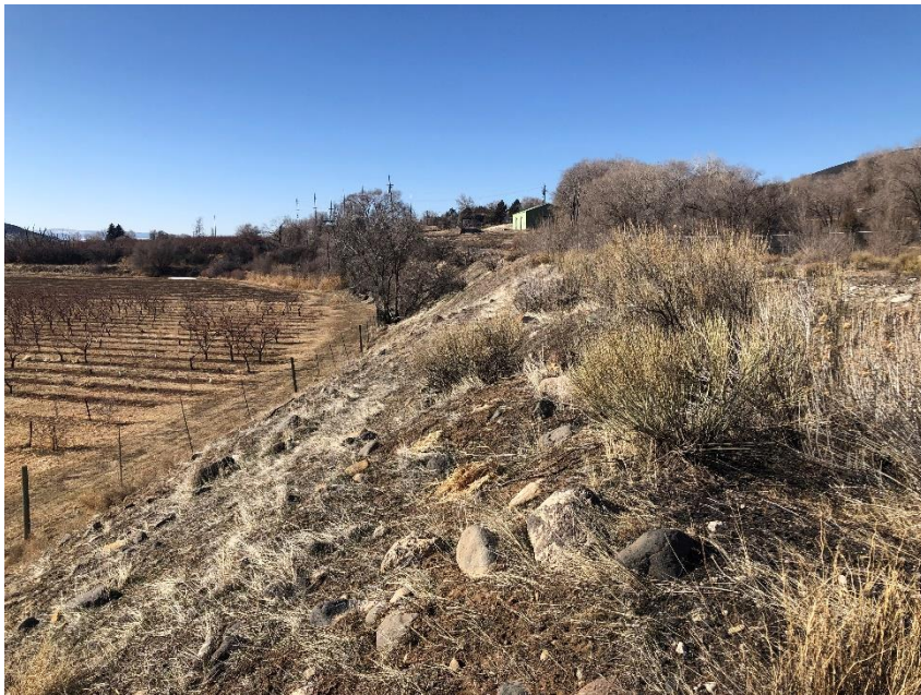
Slope below the loadout - looking towards the entrance

Number of Partial Inspection this Fiscal Year: 5