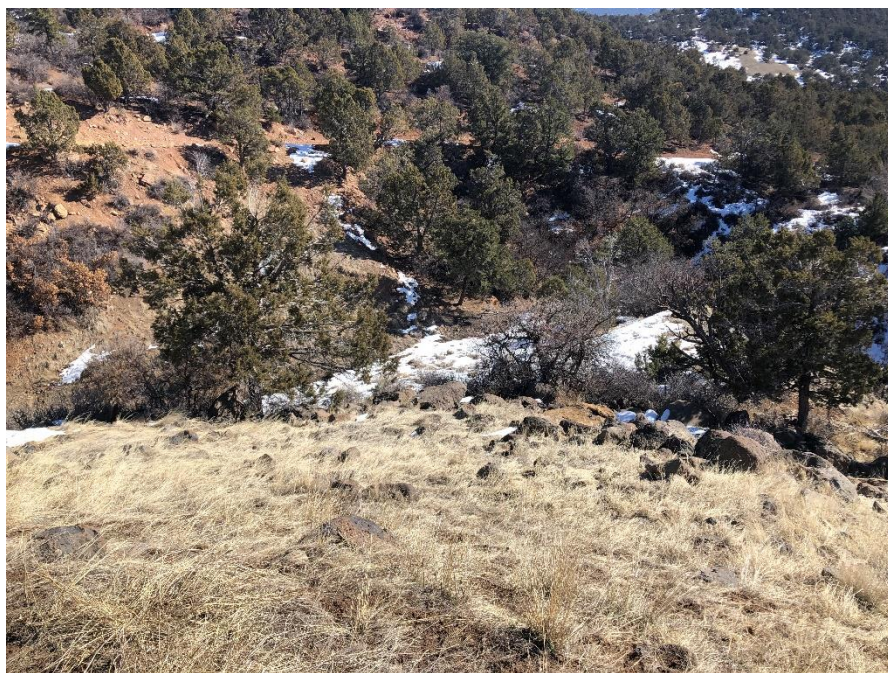
East Mine -area of reclaimed Pond 2

Number of Partial Inspection this Fiscal Year: 5