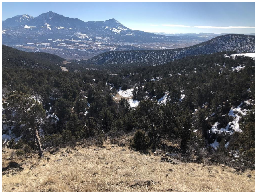
East Mine -area of reclaimed ponds (Ponds 3 and 4)