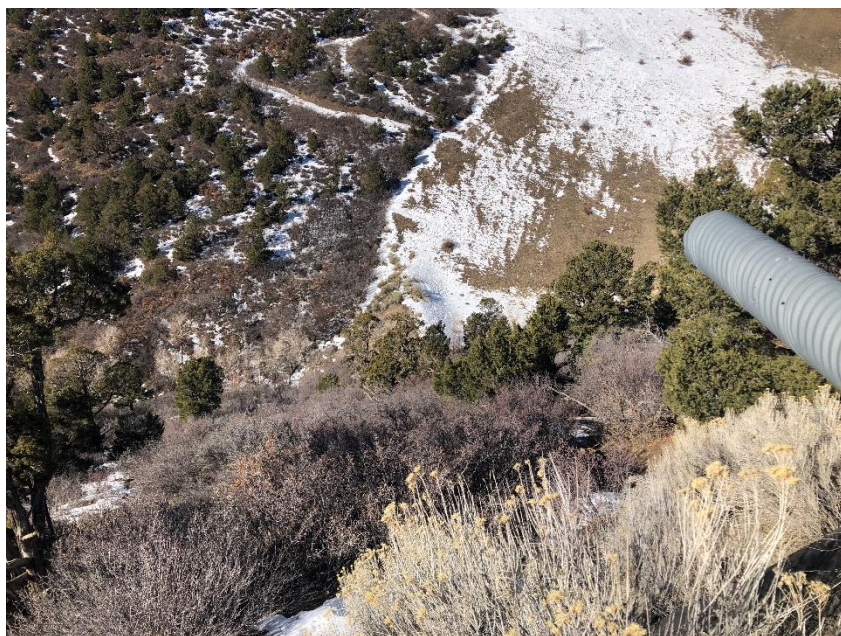
West Mine – lower pond and drainage below

Number of Partial Inspection this Fiscal Year: 5