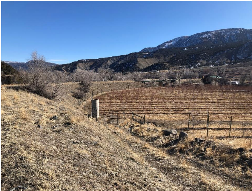
Slope below the loadout – looking towards the bridge