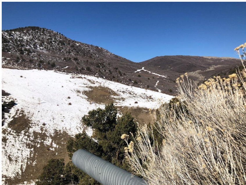
West Mine – released area on left and unreleased area to right