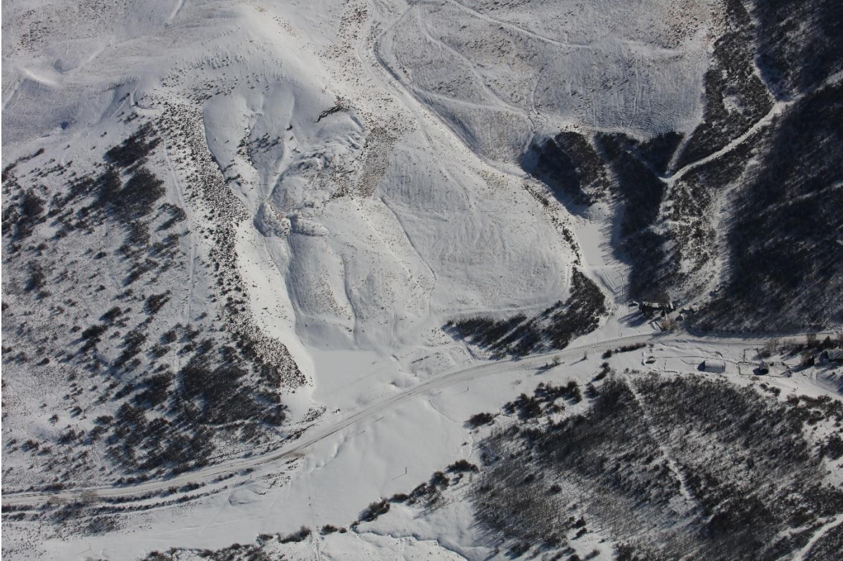
Photo 2: Ponds 13 and 14 on County Road 37 with spring fed slump above pond 13.