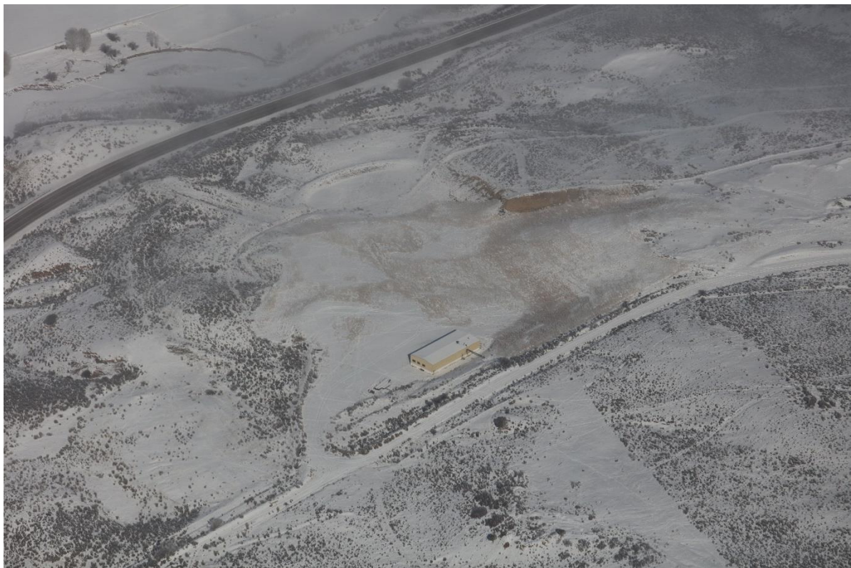
Photo 3. 5A Portal and warehouse building.

Number of Partial Inspection this Fiscal Year: 5