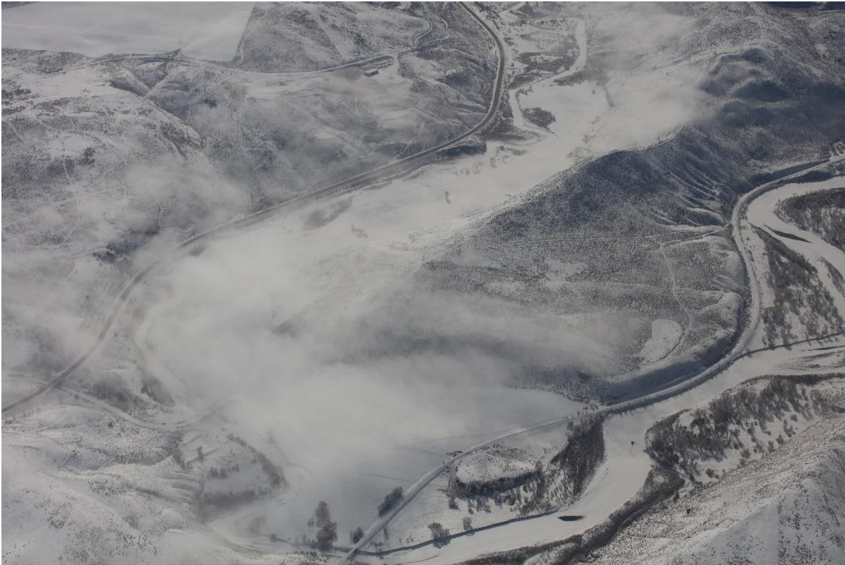
Photo 4. Williams Fork River.

Number of Partial Inspection this Fiscal Year: 5