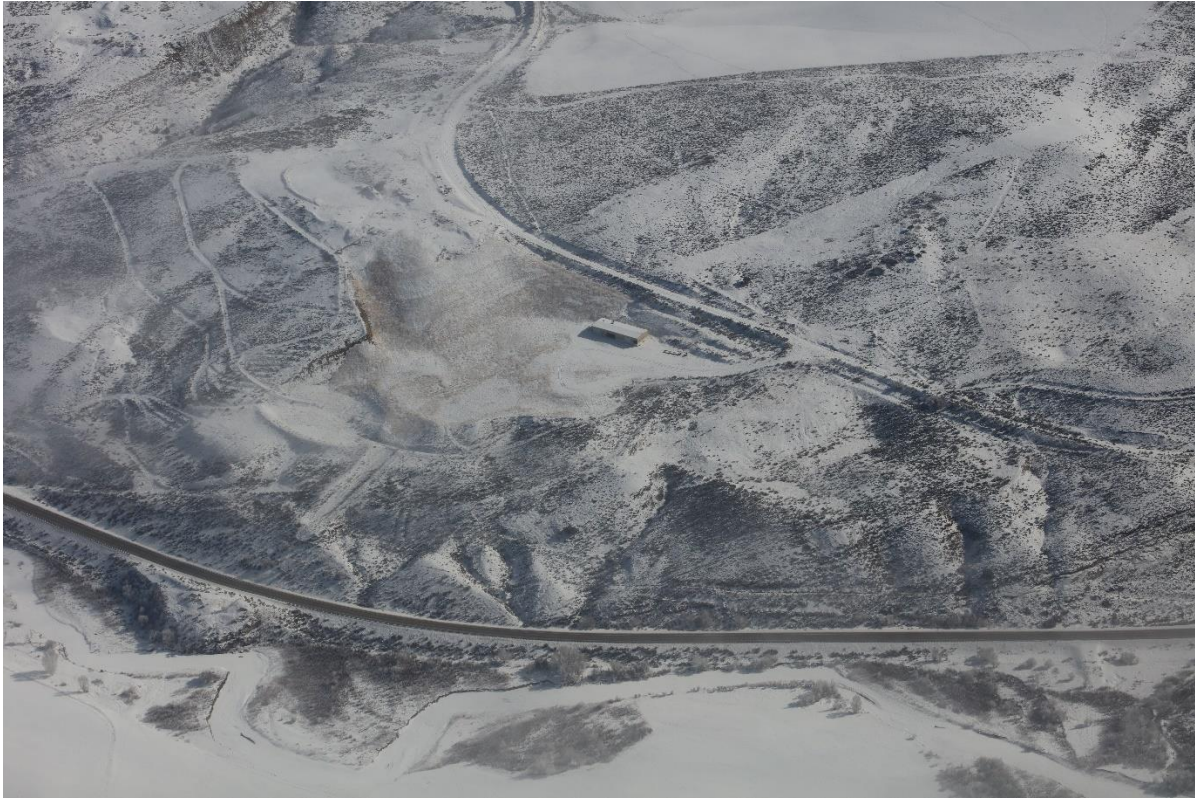
Photo 2. Slopes at the 5A portal.