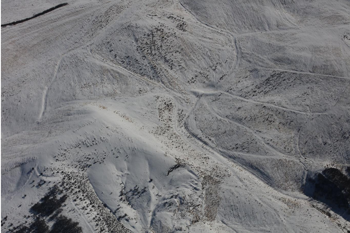
Photo 4: Reclaimed slopes and contour ditches with spring fed slump above pond 13.