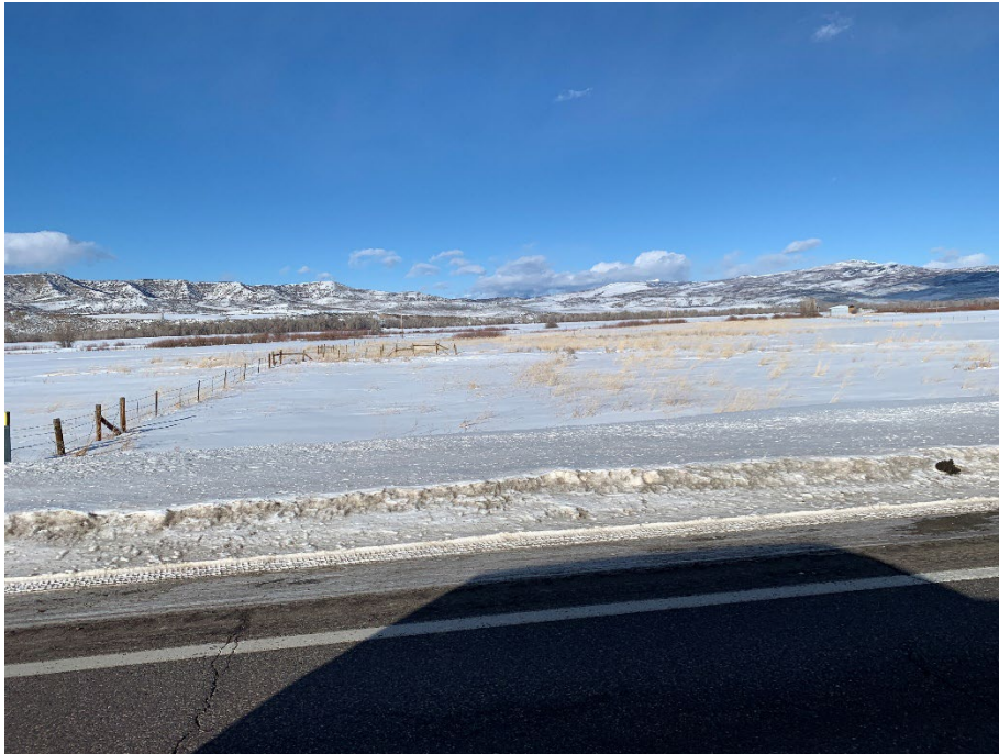
Photo 3- Reclamation north of Hwy 40.

Number of Partial Inspection this Fiscal Year: 4