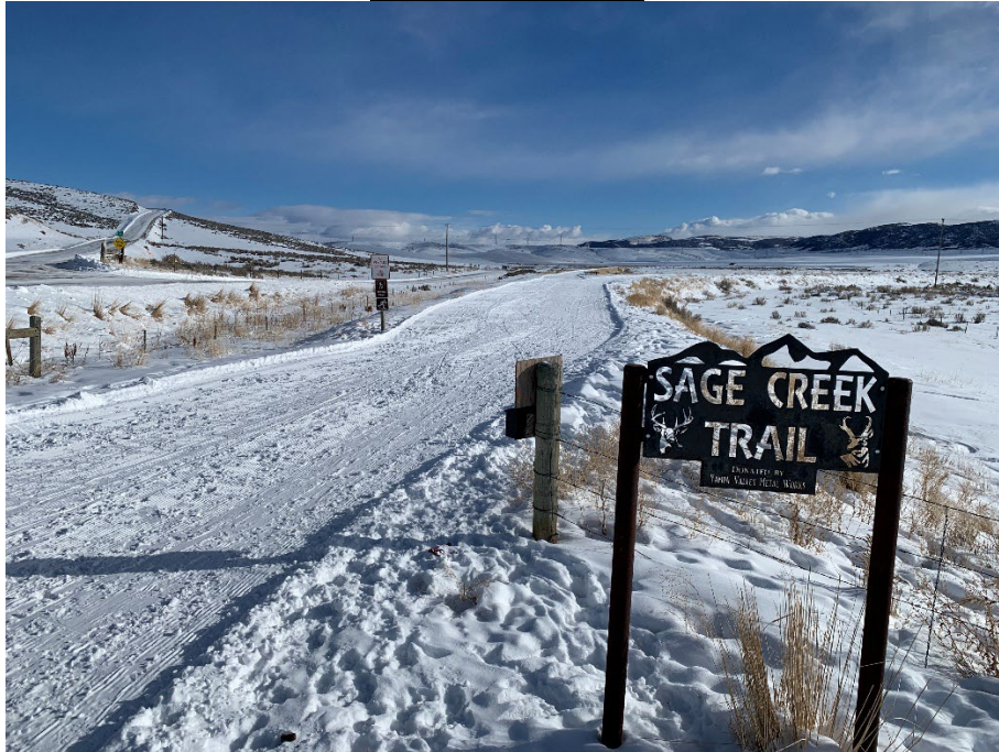
Photo 1- The railroad loop being used as a cross-country ski trail

No enforcement actions were initiated as a result of this inspection, nor are any pending.