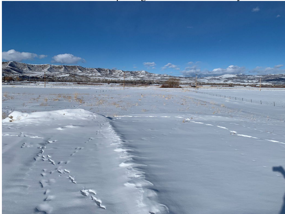
Photo 2- Reclamation north of trail head parking lot

Number of Partial Inspection this Fiscal Year: 4