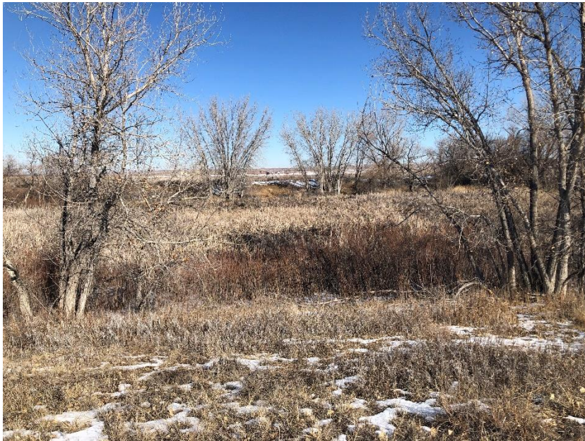
Sediment Pond 2

Number of Partial Inspection this Fiscal Year: 4