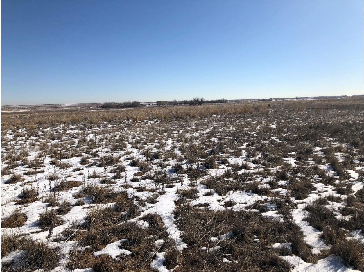
Reclaimed Long Term Spoil Area, looking southeast from the west side

Number of Partial Inspection this Fiscal Year: 4