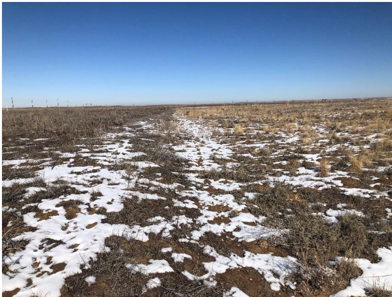
West end of disturbed area, looking north, with the undisturbed area on the left

Number of Partial Inspection this Fiscal Year: 4