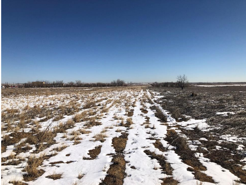
Reclaimed road, south of Area 25 (looking east)