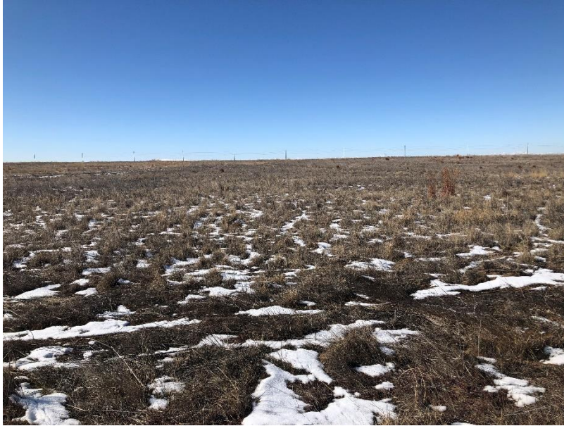
Area 43 (reclaimed B Pit), looking west from the east side