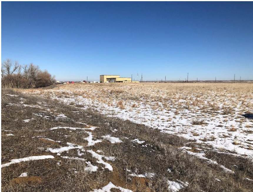
Area 38, with the south end of the Dugout Pond on left

Number of Partial Inspection this Fiscal Year: 4