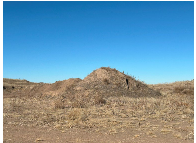
Photo 4: Seeded and stable topsoil pile located near site entrance.