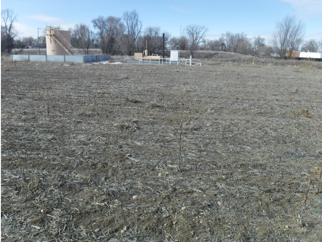
Photo 7: Another area along west side of reservoir recently drill seeded