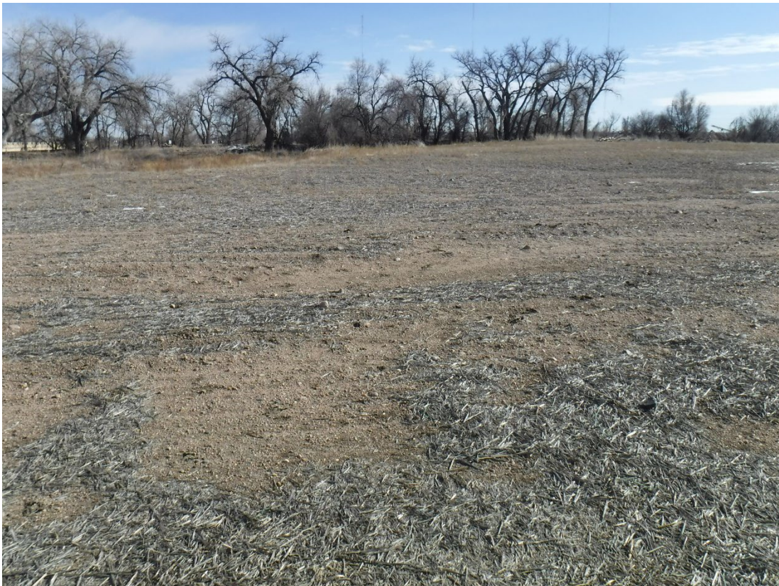
Photo 8: Area near the primary mine entrance recently drill seeded