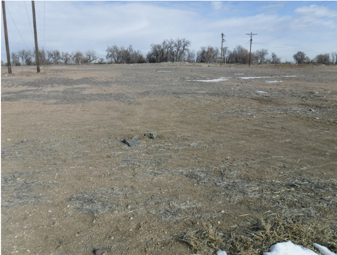
Photo 5: Another area along east side of reservoir recently drill seeded