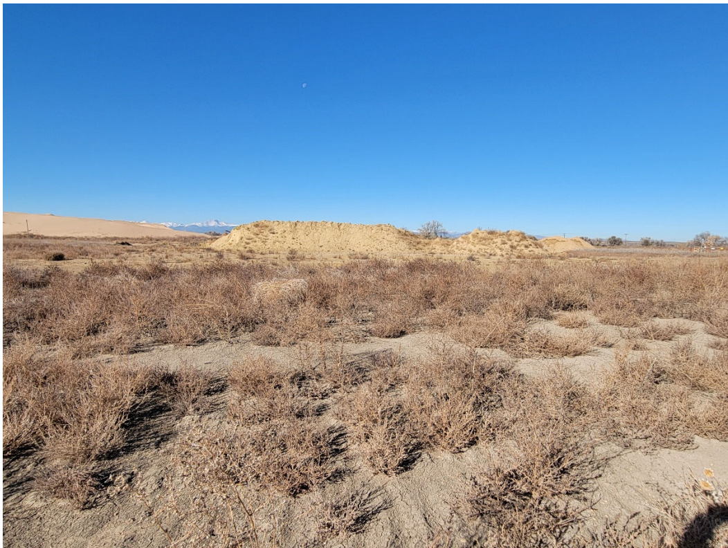
Photo 8: Looking northwest across Cell 3. Stockpiles of material left over from previous mining operation at the site.