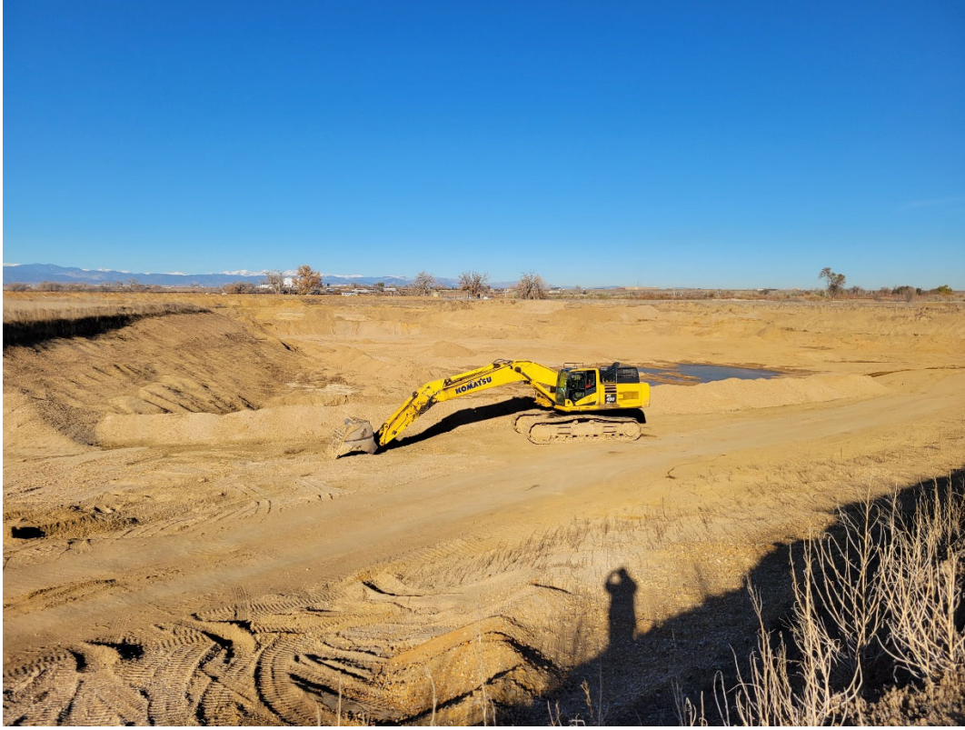
Photo 1: Looking northwest across Pond 2 - Freshwater Pond in the Stage 1 area.