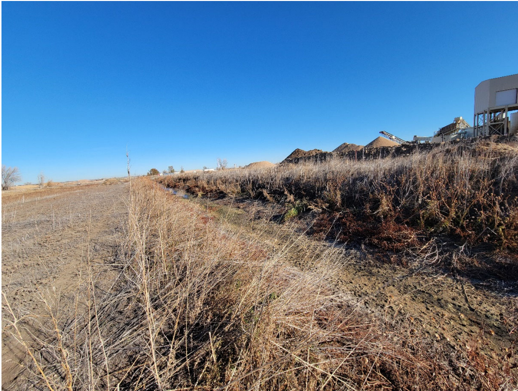
Photo 3: Looking northeast at the Last Chance Ditch below the processing plant.