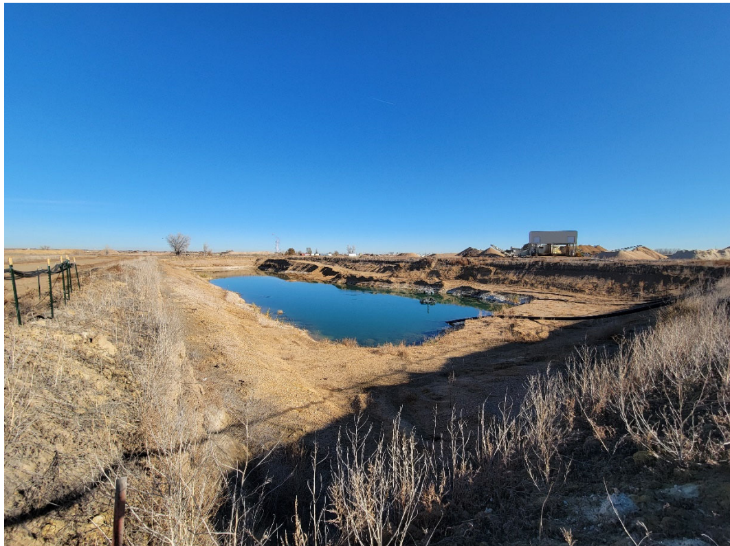
Photo 2: Looking northwest across Pond 1 - Siltation Pond constructed in the Stage 1 area.