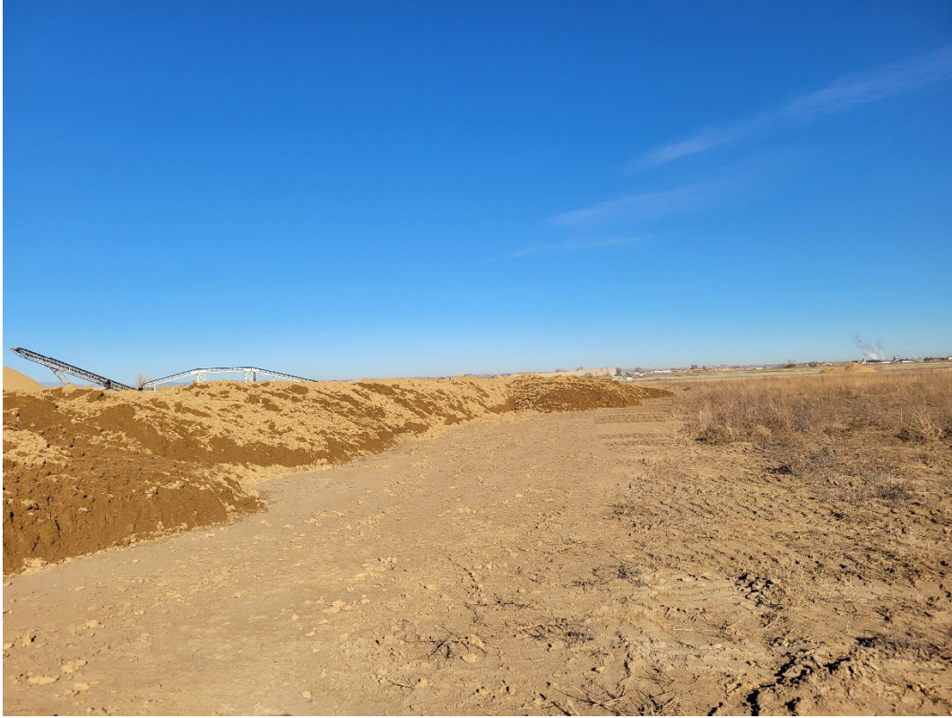
Photo 5: Looking at stockpiled filter cake clay material from the filter press process.