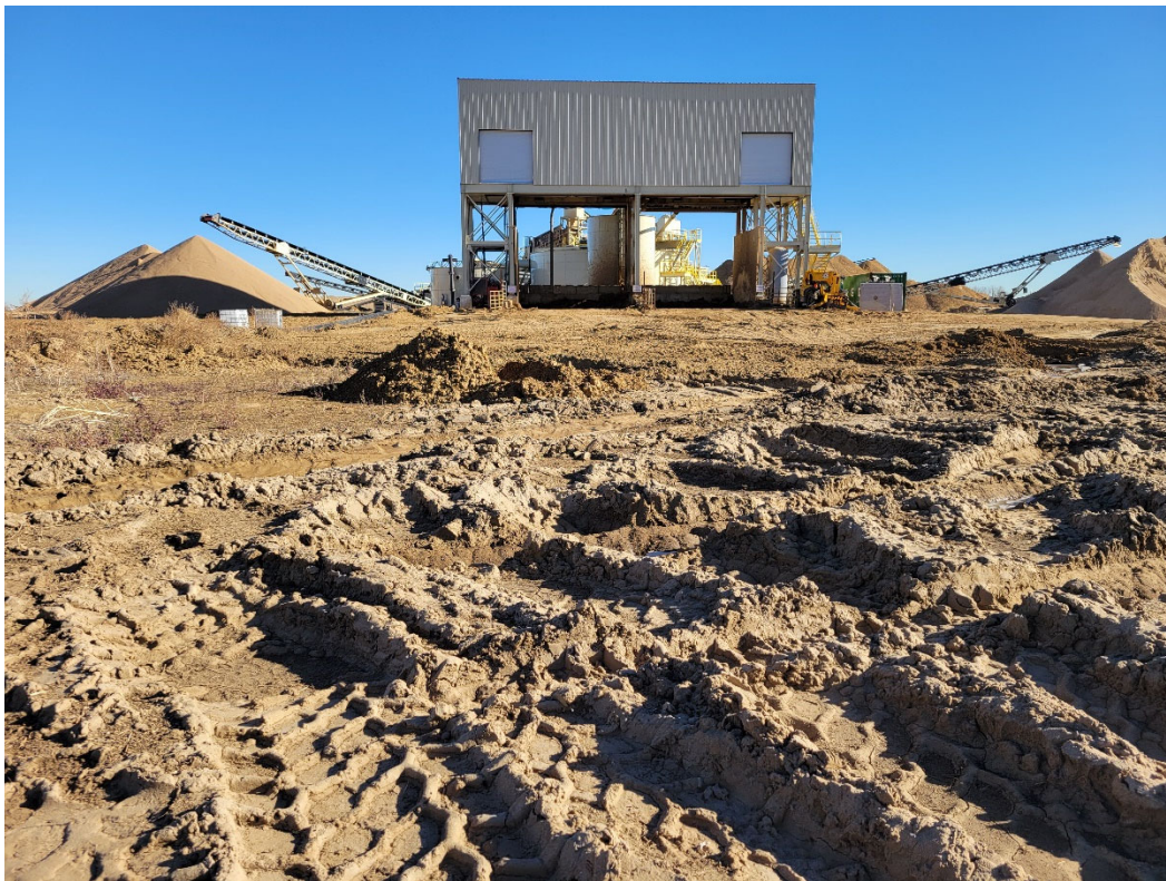
Photo 4: Looking at the processing plant and material stockpiles in Cell 6. The operator installed a filter press process.