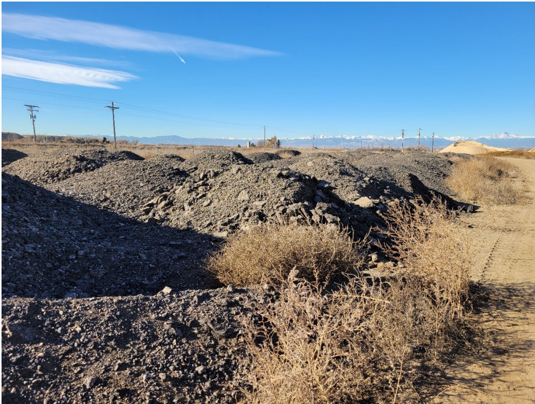
Photo 10: Looking at stockpiled material to be used for road base.