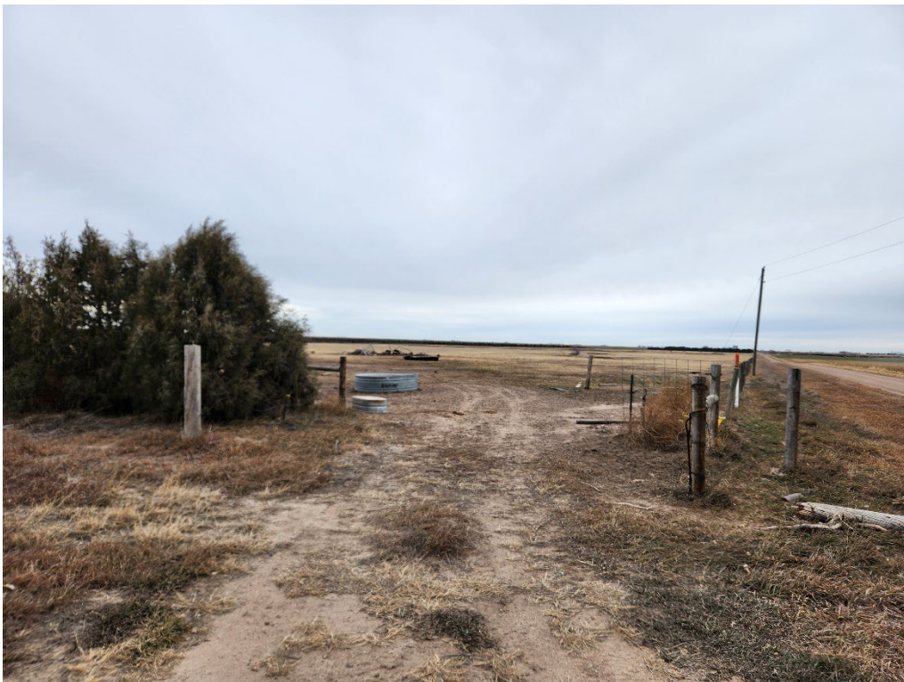
Photo 8. Southwest corner of the permit boundary, looking east