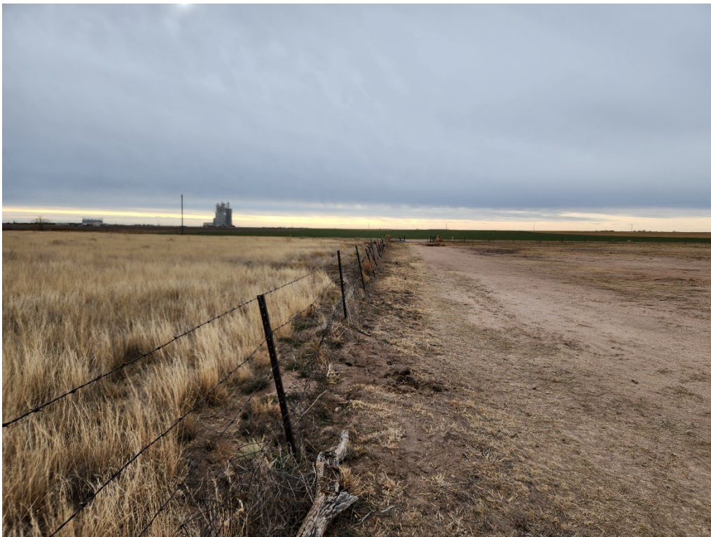
Photo 6. Eastern permit boundary, looking south.