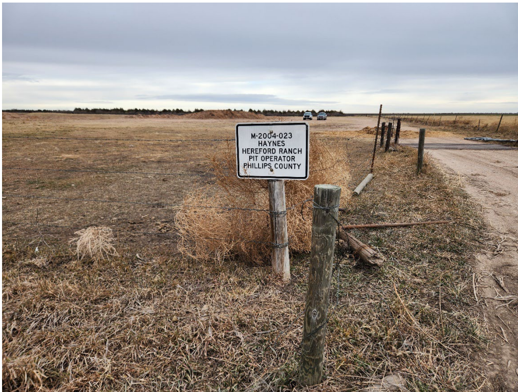
Photo 1. Mine entrance sign, looking north.