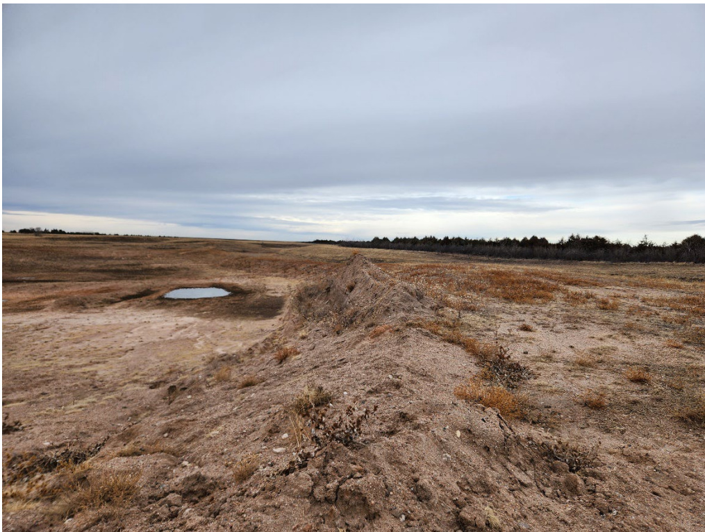
Photo 4. Topsoil stockpile, looking west.