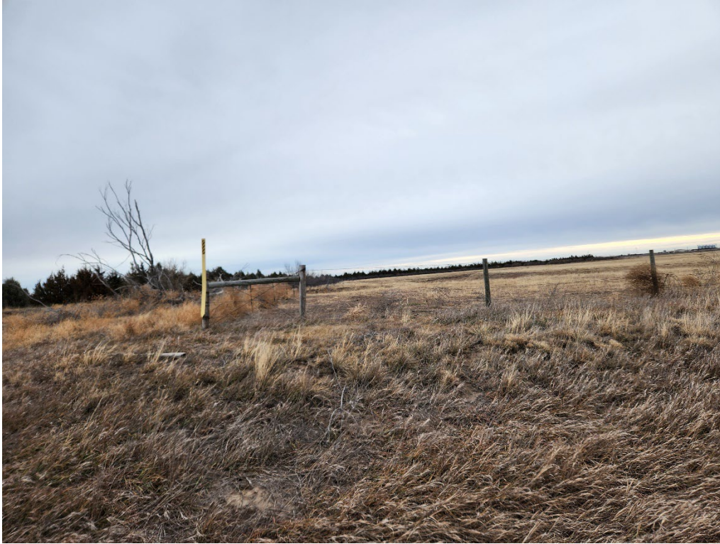
Photo 9. Northwest corner of the permit boundary, looking east.