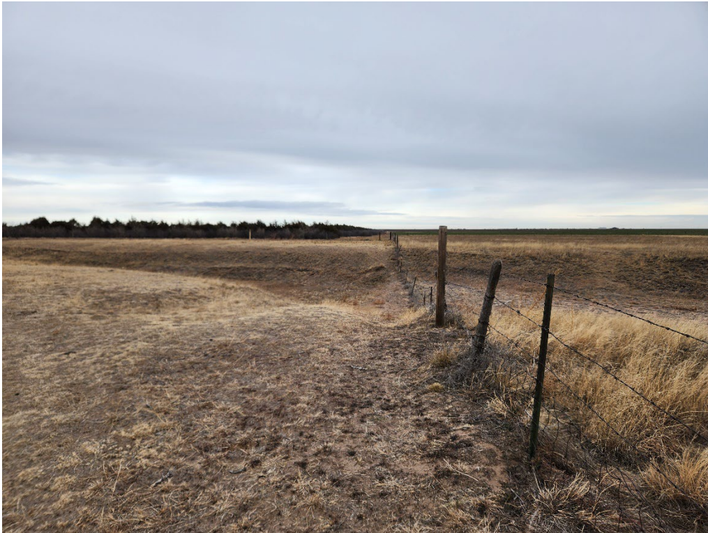
Photo 5. Eastern permit boundary, looking north.