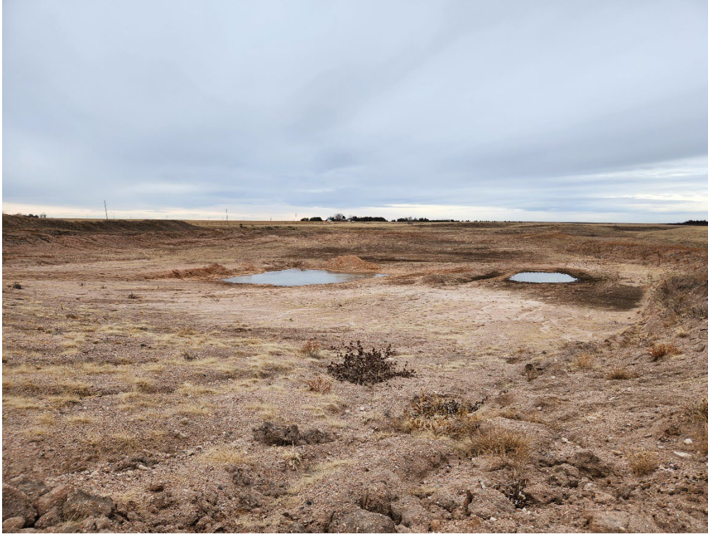
Photo 3. Open mining pit on site, looking west.