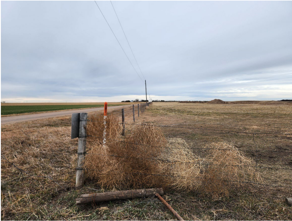
Photo 7. Southern permit boundary, looking west.