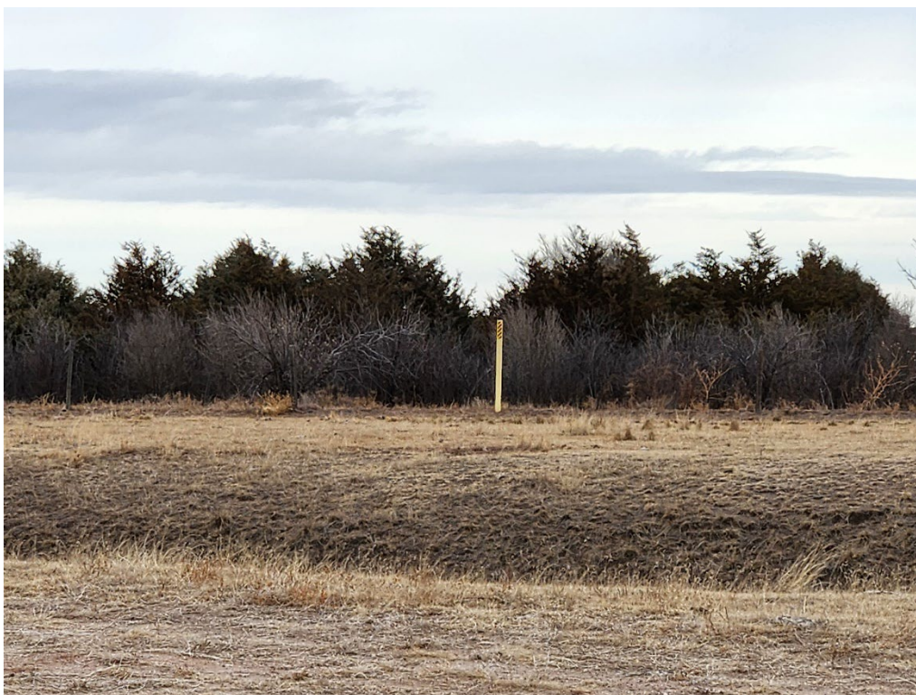
Photo 2. Permit boundary marker in the northeast of the site, looking north.