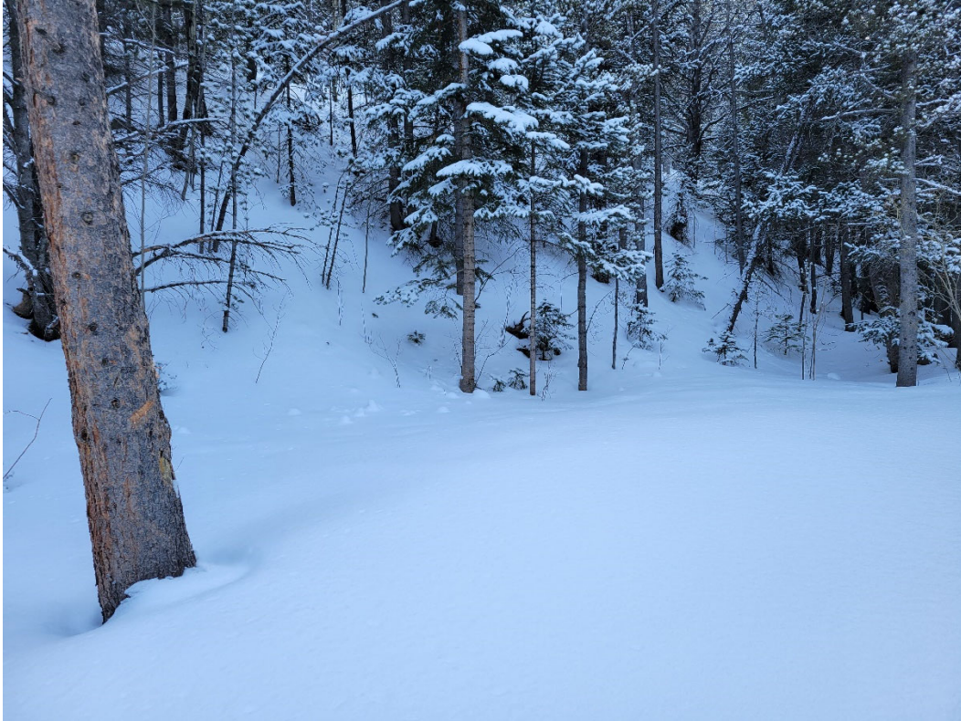
Photo 1: Location on west end of the site where shed was removed from the site.