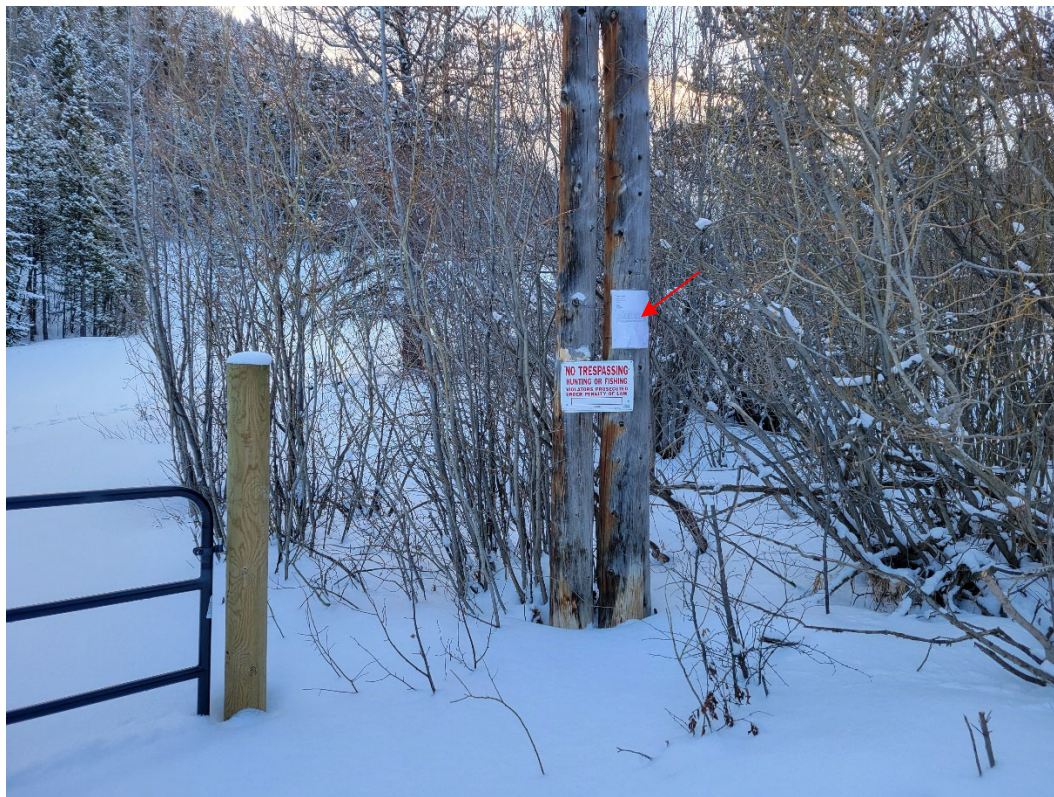
Photo 5: Entrance to prospecting site. Mine sign posted (red arrow).