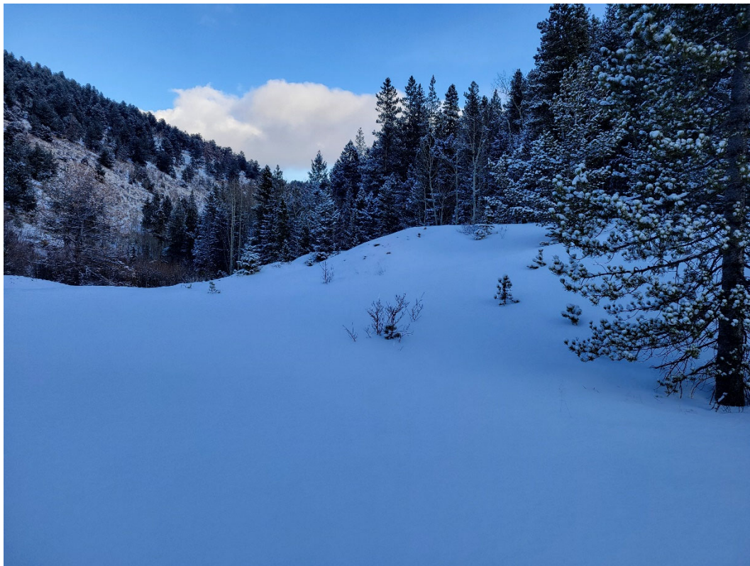
Photo 3: Looking towards the east side of the permit area where the historic mine dump is located.