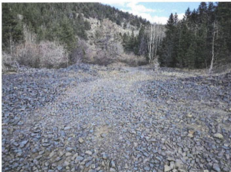
Photo 4: Historic mine dump area on the east side of the permit area.