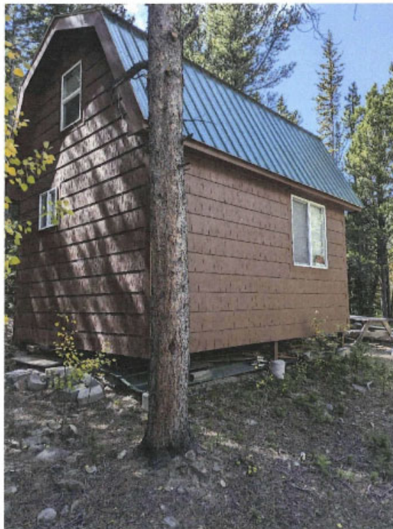
Photo 2: Location of shed constructed on site.