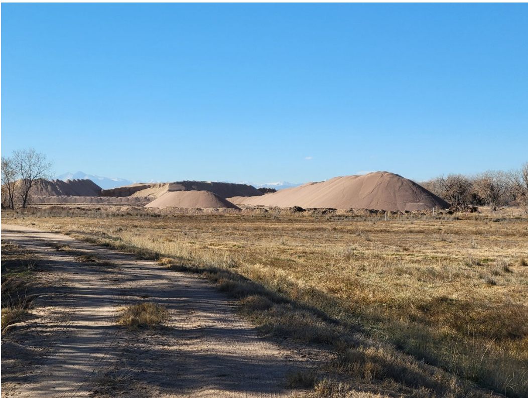
Photo 13: Looking west at stockpiles of material on the eastern side of the existing mine