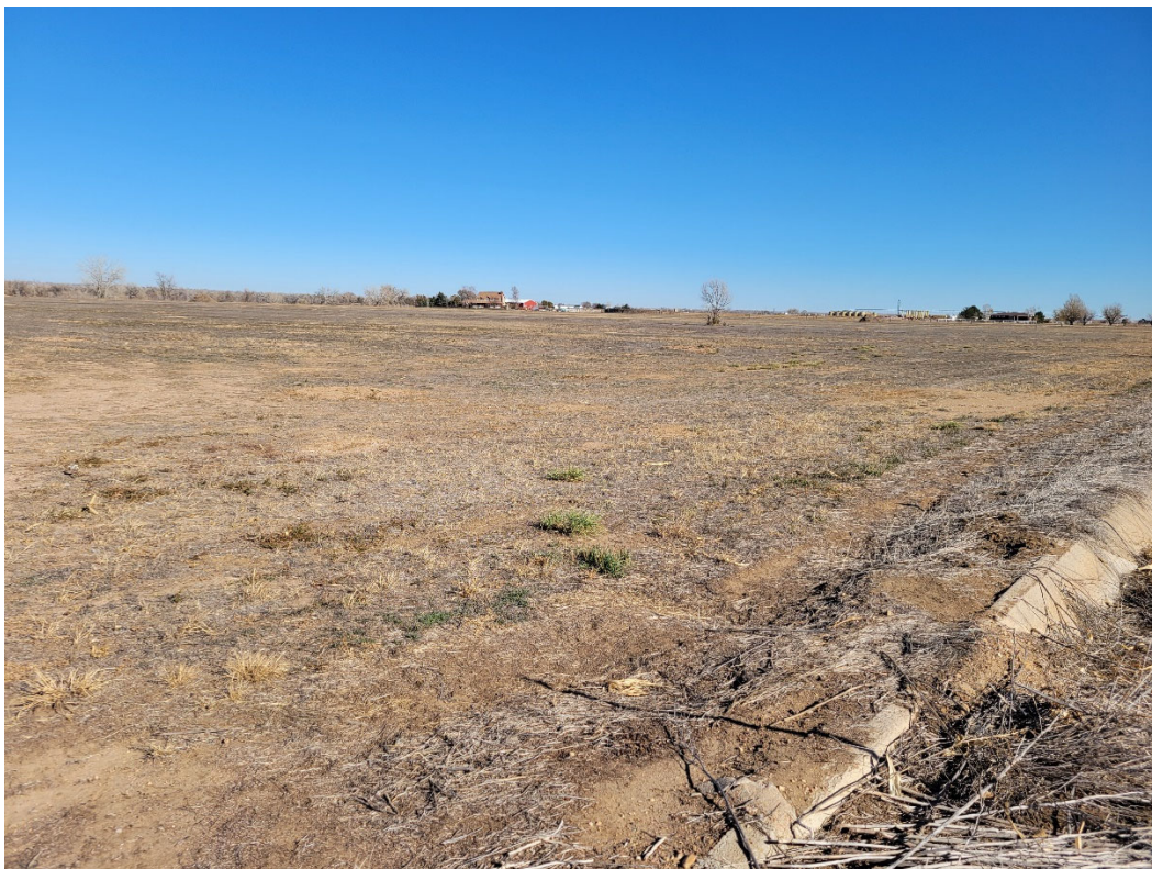
Photo 2: Looking northeast from the southwest corner of the amendment area.