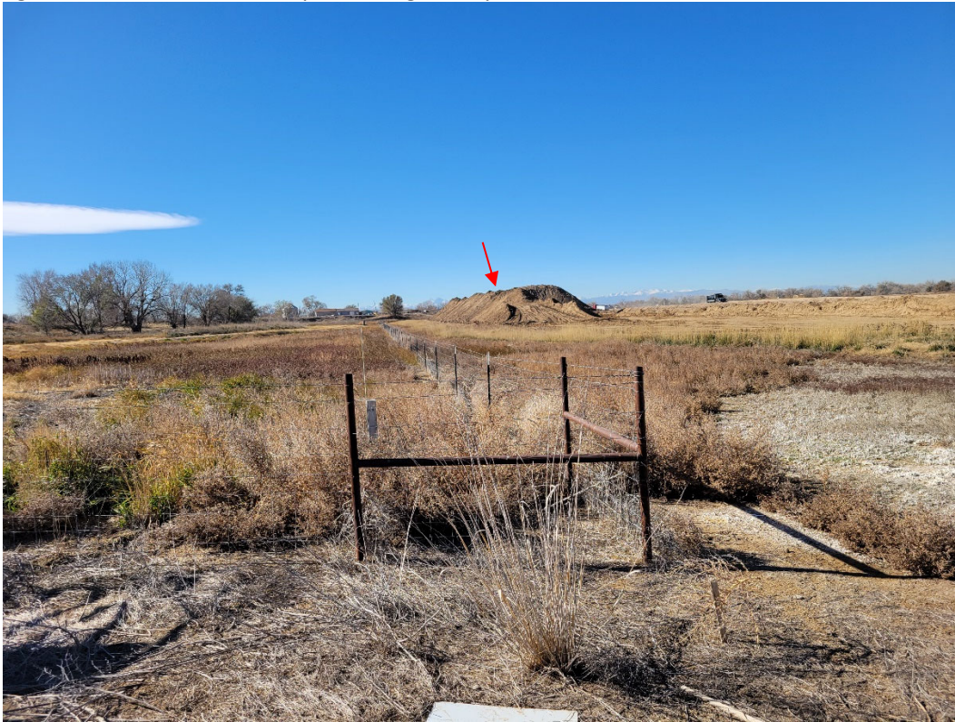
Photo 12: Looking west down the southern boundary of the existing mine at the entrance to the proposed amendment area. Overburden stockpiles located outside the slurry wall are noted by the red arrow.

agricultural field where the processing facility will be constructed.