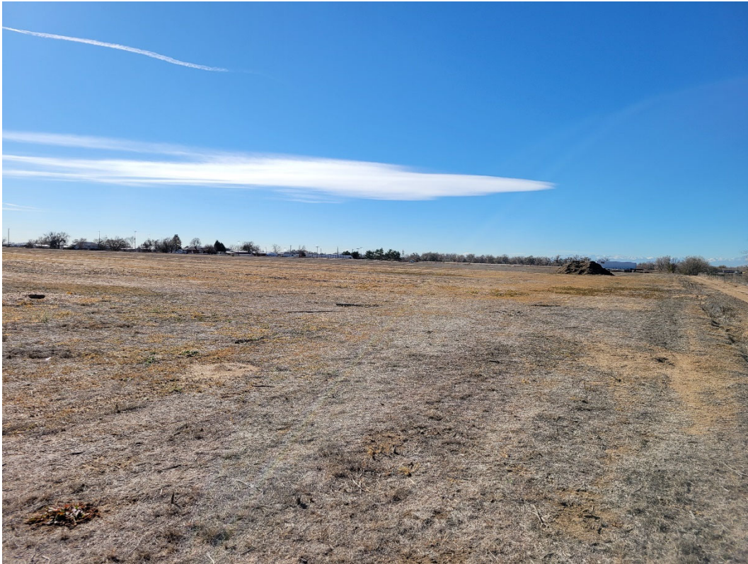
Photo 3: Looking southwest from the northeast corner of the amendment area.