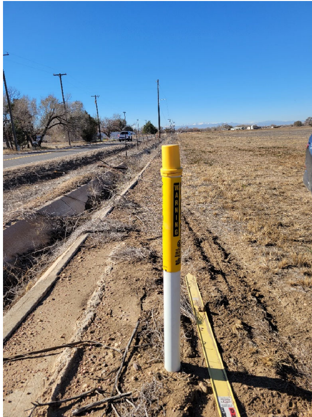
Photo 8: Gas line marker observed in the southeast corner of the permit area.