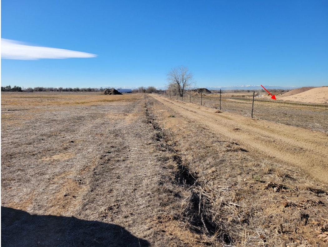
Photo 9: Two-track road observed crossing the Trycycle Lane parcel on the northern end of the amendment area. This road appears to be utilized to access an adjacent residence. Existing mining area is below on the right noted by arrow.