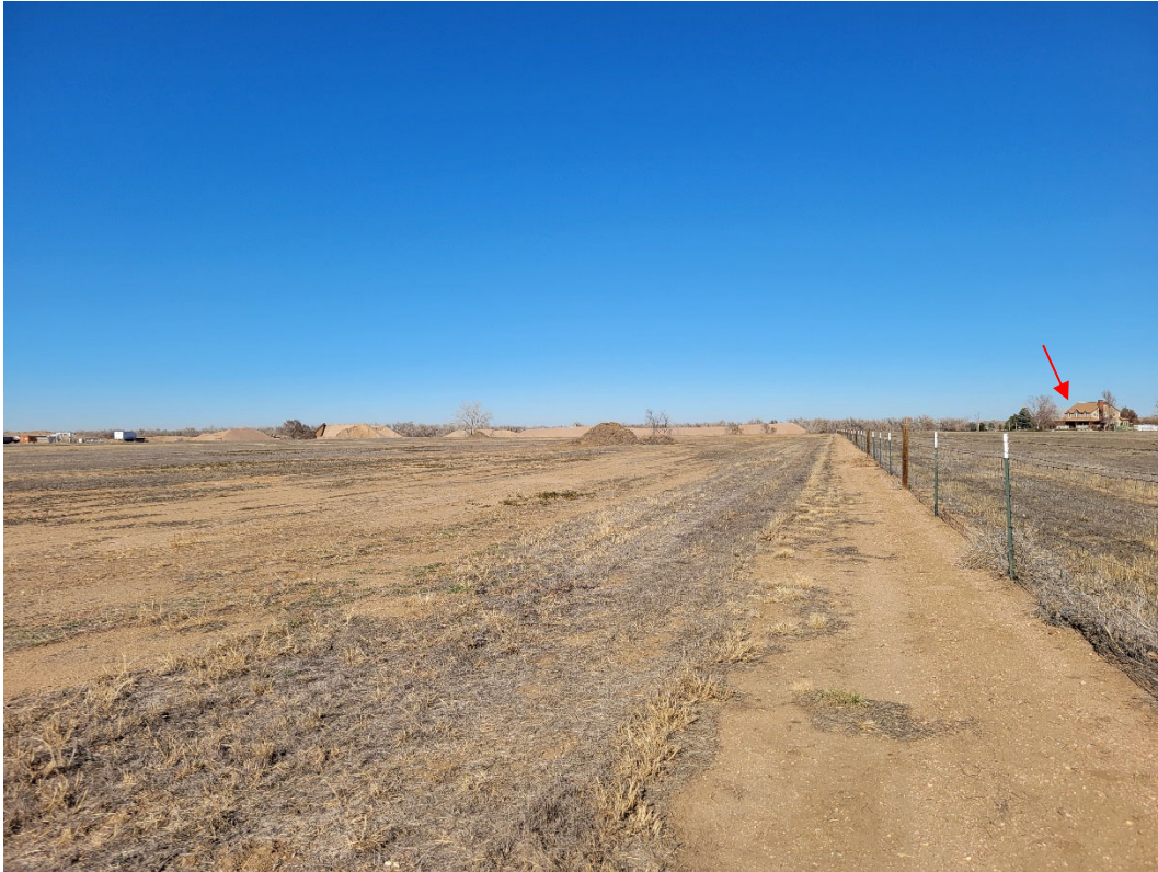
Photo 7: Looking north down the eastern boundary. Adjacent residence is noted by red arrow.