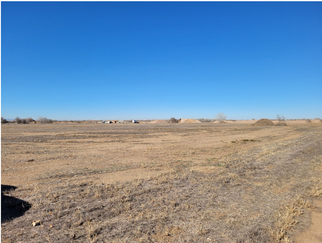
Photo 4: Looking northwest from the southeast corner of the amendment area.