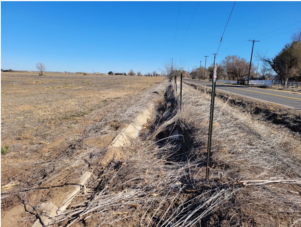
Photo 6: Looking down the southern boundary of the amendment area. County Road 58 is on the right, adjacent to the parcel. Agriculture ditch, barbed wire fence and powerlines running along CR 58 were observed. Residences on the south side of CR58.