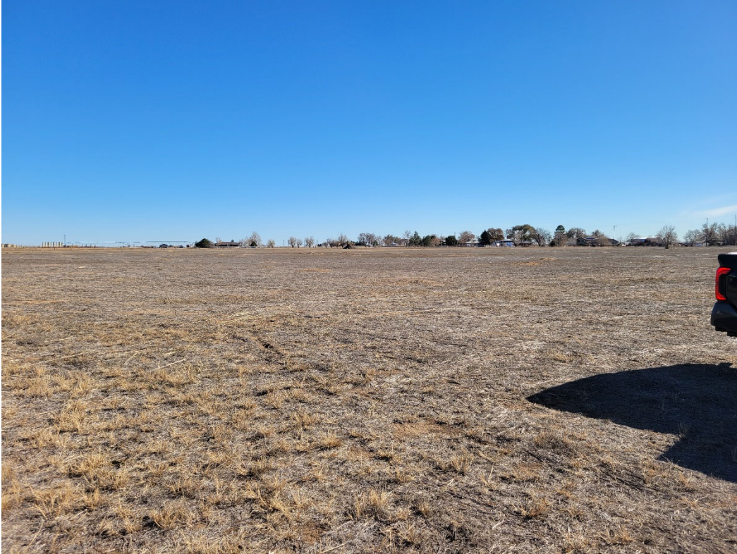
Photo 1: Looking southeast from the northwest corner of the amendment area.