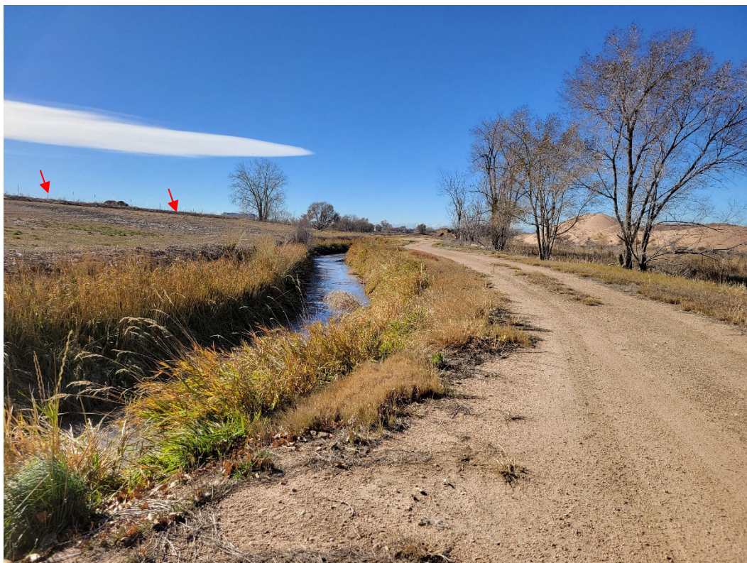
Photo 11: Looking at Plumb Ditch within the amendment area. The ditch is below the proposed processing facility. Arrows point to fenceline marking the northern end of the