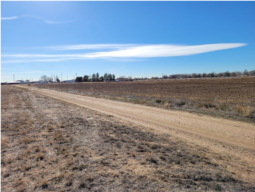
Photo 5: Access road that runs along the west side of the amendment area.