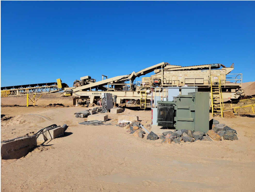
Photo 14: Processing facility in the center of the existing mine site. The amendment proposes to move this equipment to the amended area above pit.