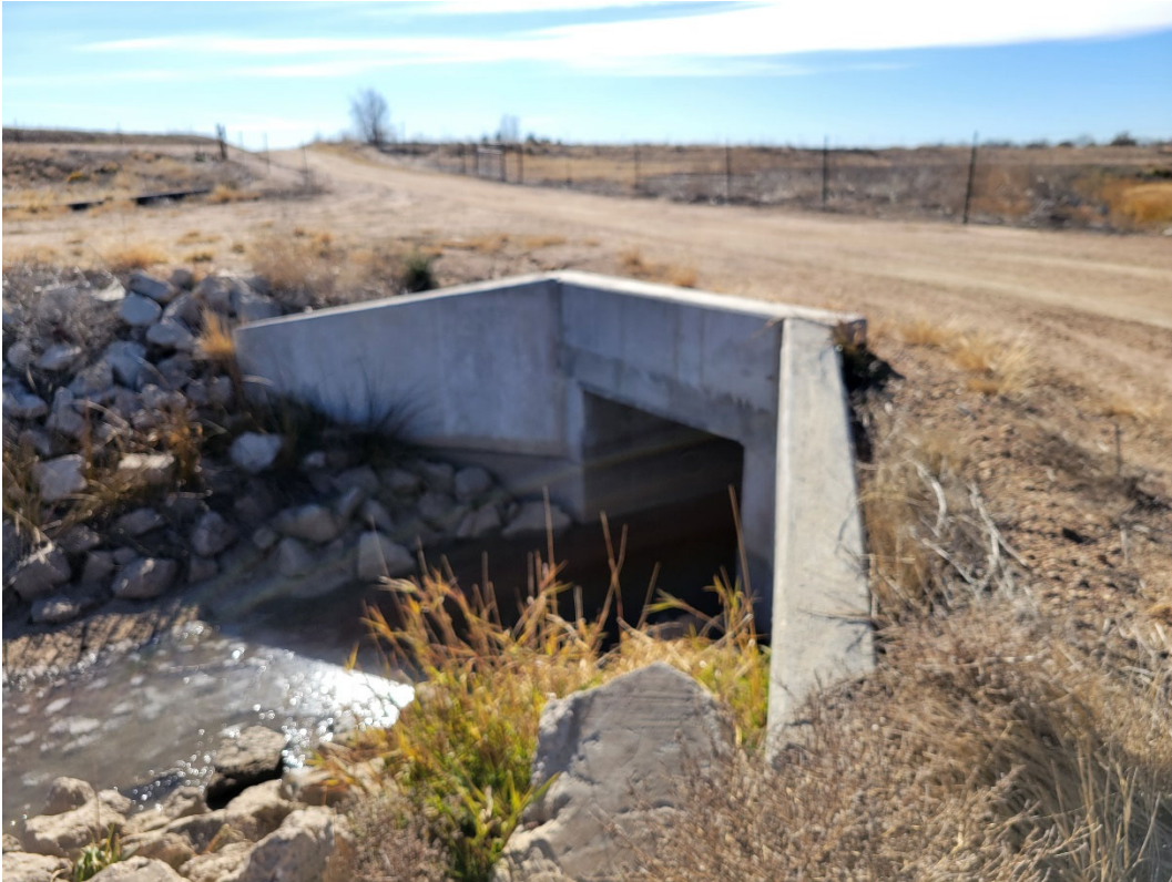
Photo 10: Road and bridge over the Plumb Ditch between the existing mine and the amendment area.