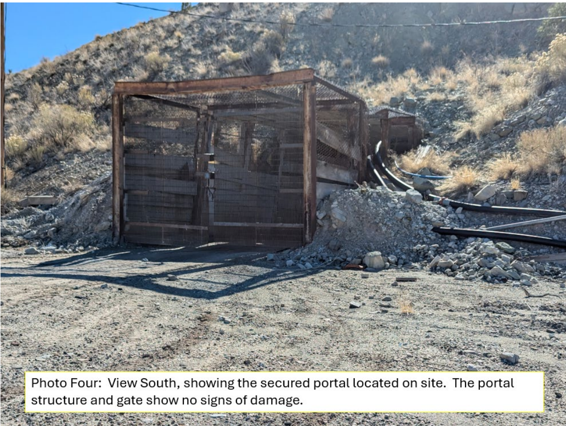
Photo Four: View South, showing the secured portal located on site. The portal structure and gate show no signs of damage.