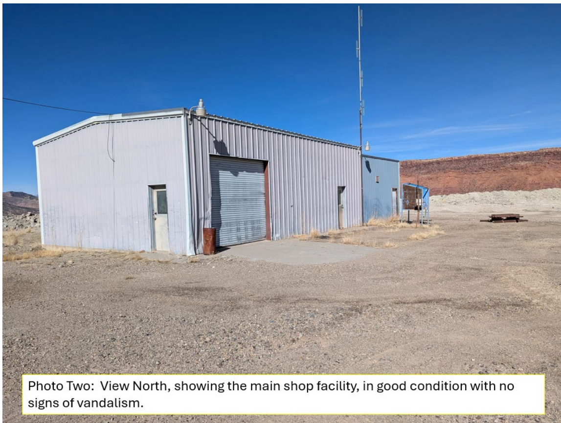
Photo Two: View North, showing the main shop facility, in good condition with no signs of vandalism.