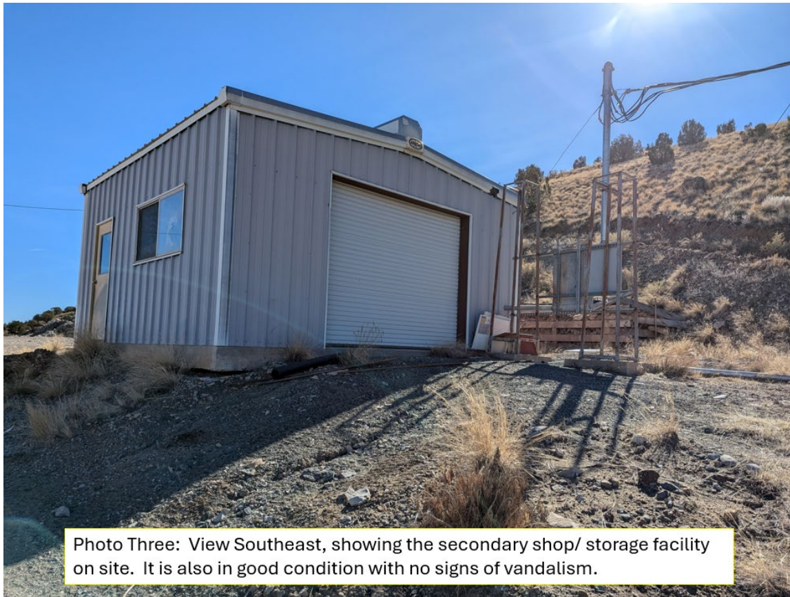
Photo Three: View Southeast, showing the secondary shop/ storage facility on site. It is also in good condition with no signs of vandalism.