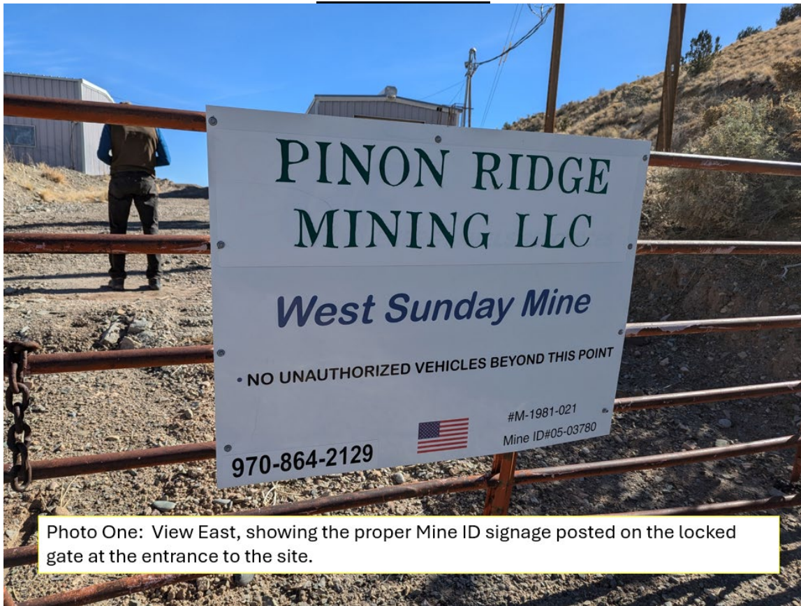
Photo One: View East, showing the proper Mine ID signage posted on the locked gate at the entrance to the site.