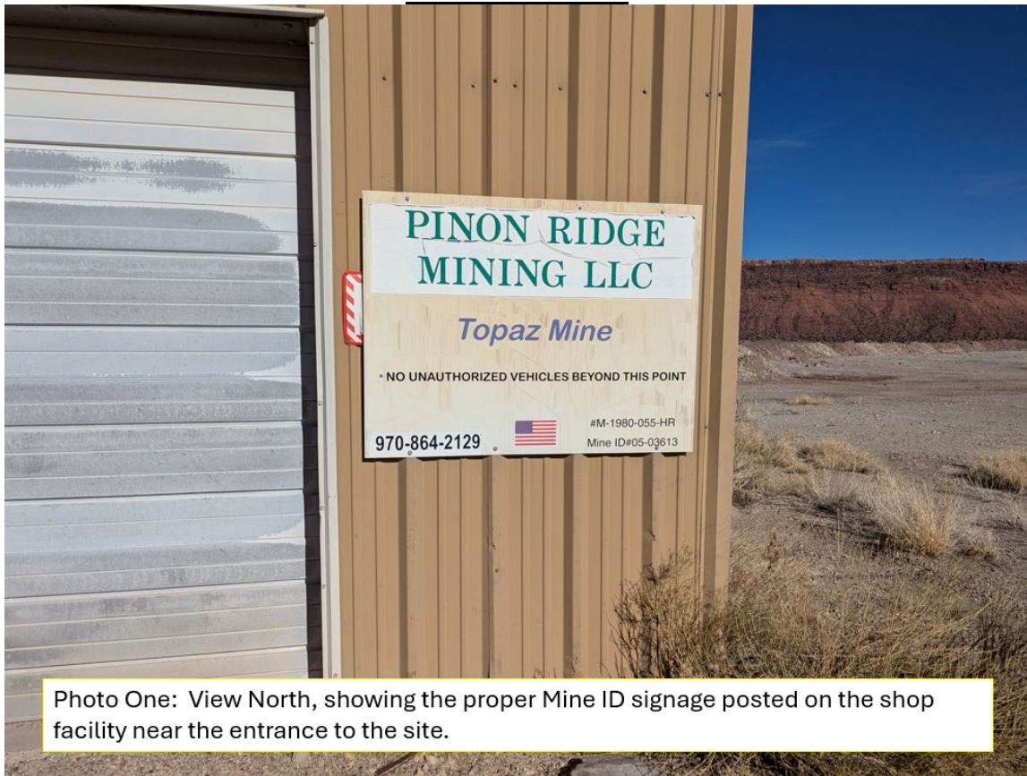
Photo One: View North, showing the proper Mine ID signage posted on the shop facility near the entrance to the site.