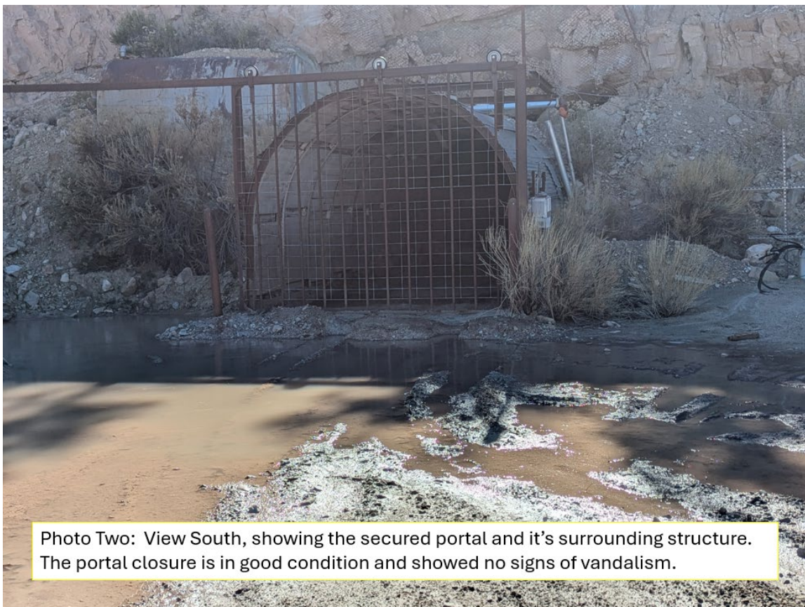
Photo Two: View South, showing the secured portal and it's surrounding structure. The portal closure is in good condition and showed no signs of vandalism.