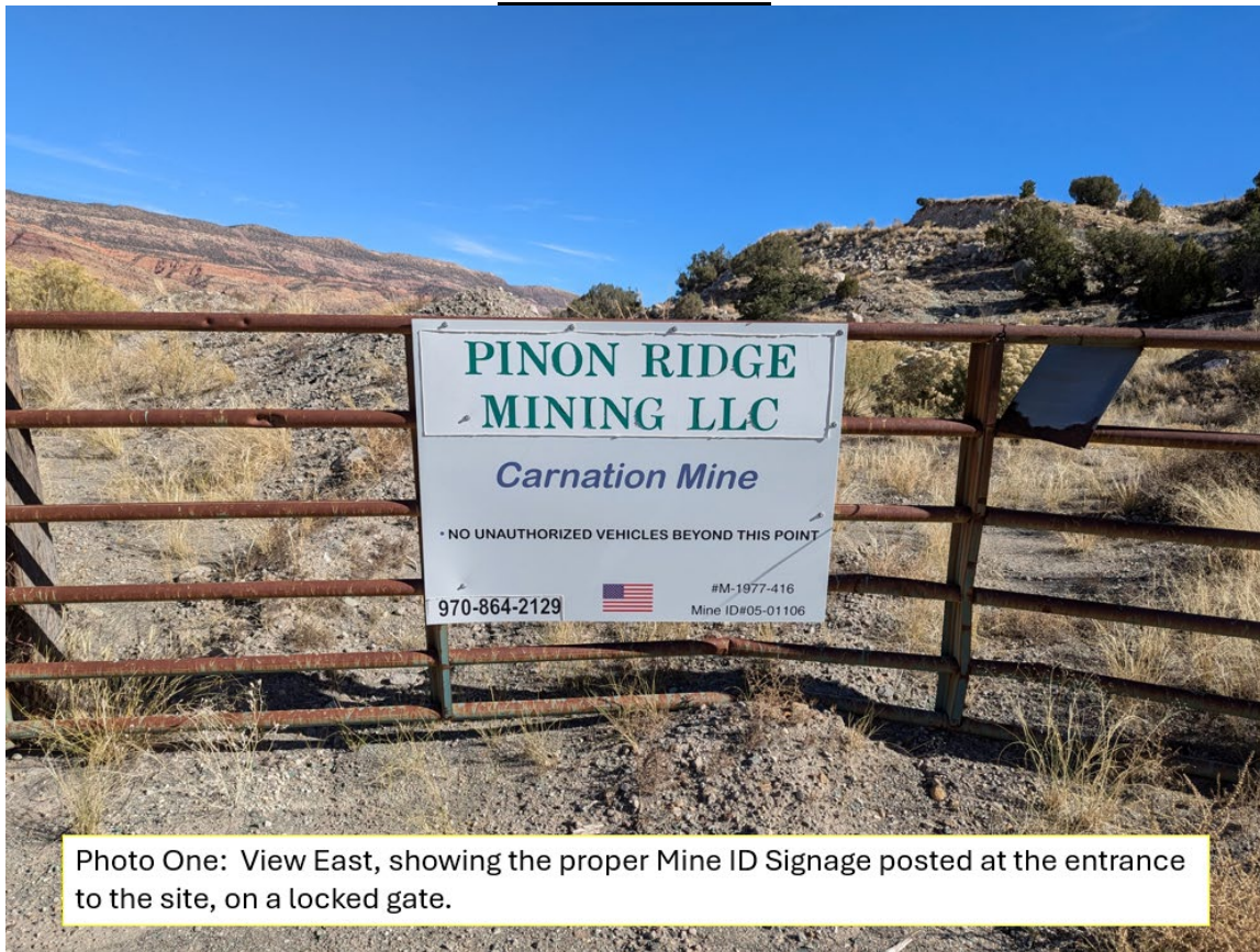
Photo One: View East, showing the proper Mine ID Signage posted at the entrance to the site, on a locked gate.