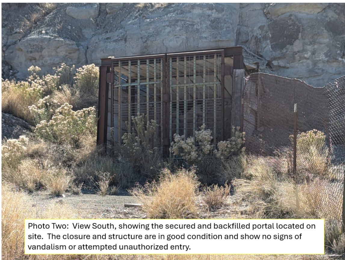
Photo Two: View South, showing the secured and backfilled portal located on site. The closure and structure are in good condition and show no signs of vandalism or attempted unauthorized entry.