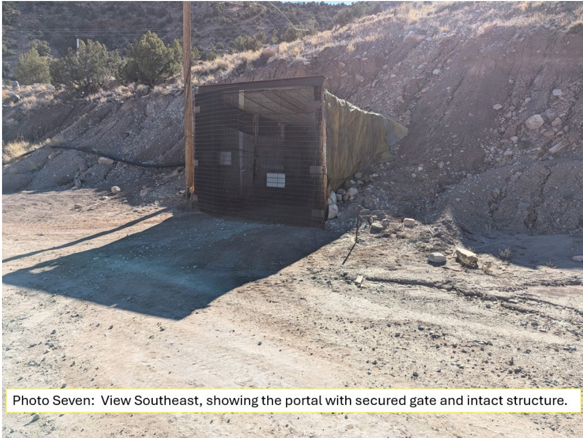
Photo Seven: View Southeast, showing the portal with secured gate and intact structure.