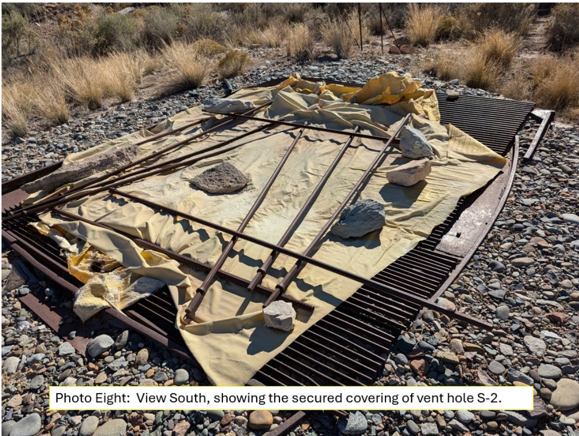
Photo Eight: View South, showing the secured covering of vent hole S-2.