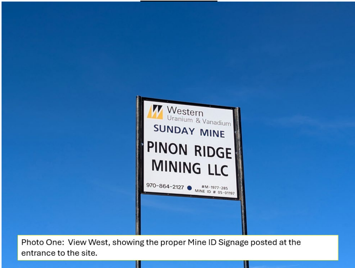
Photo One: View West, showing the proper Mine ID Signage posted at the entrance to the site.