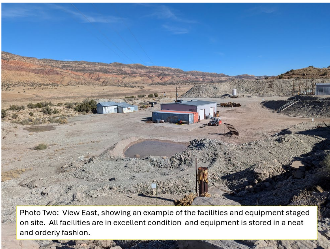
Photo Two: View East, showing an example of the facilities and equipment staged on site. All facilities are in excellent condition and equipment is stored in a neat and orderly fashion.