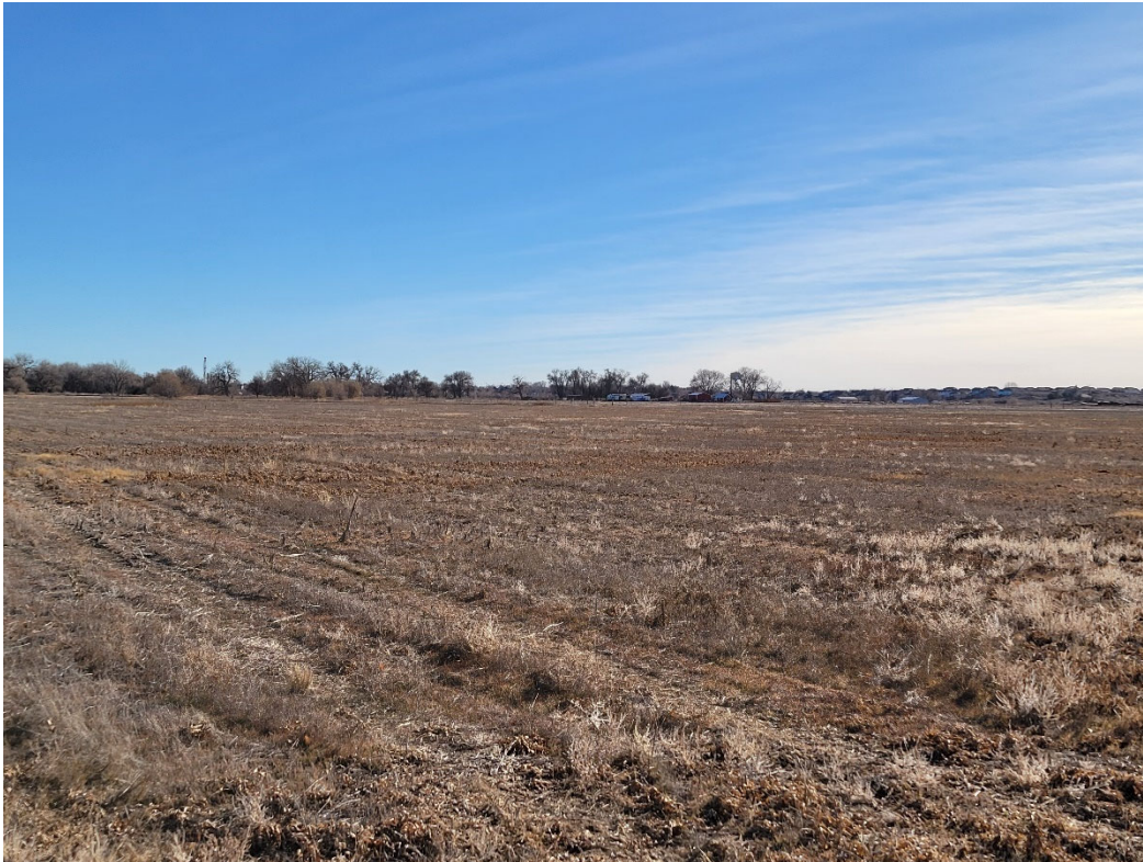
Photo 11: Looking east across the Phase 5 & 6 area from the northern end.