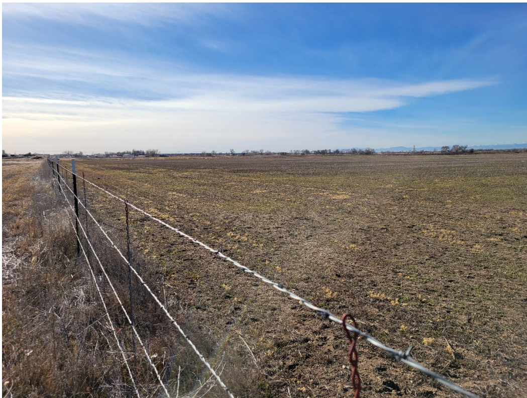
Photo 6: Looking down the fence line that runs along the western side of the permit area. City of Aurora property is on the right side where the surface water augmentation project is located.