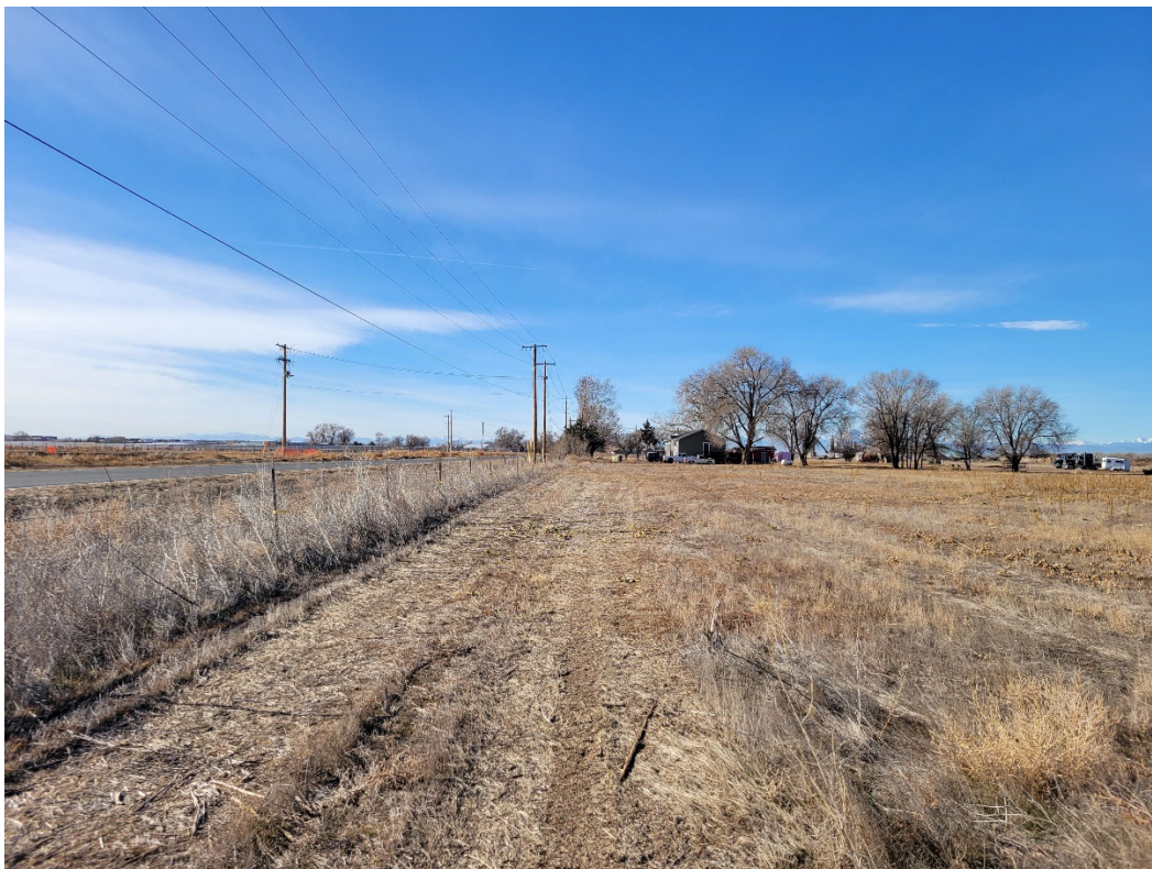
Photo 20: Power line observed along SH 394 on the south side of the permit area.