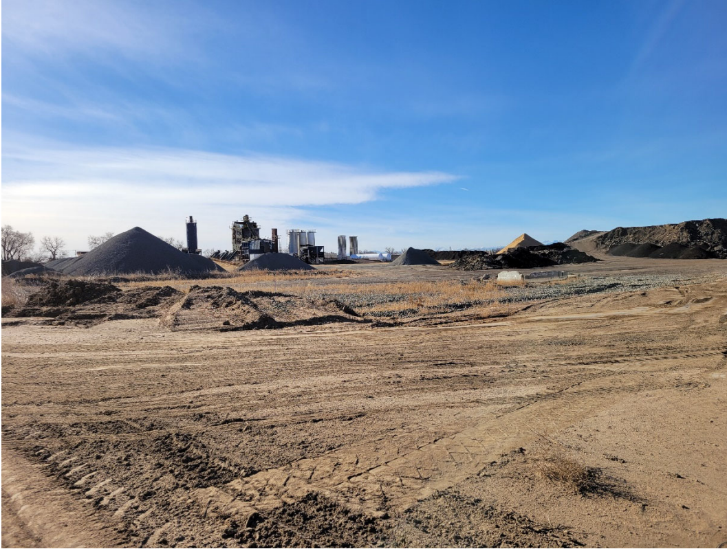
Photo 7: Looking at the existing recycling processing facility in the southwest corner of the permit area.