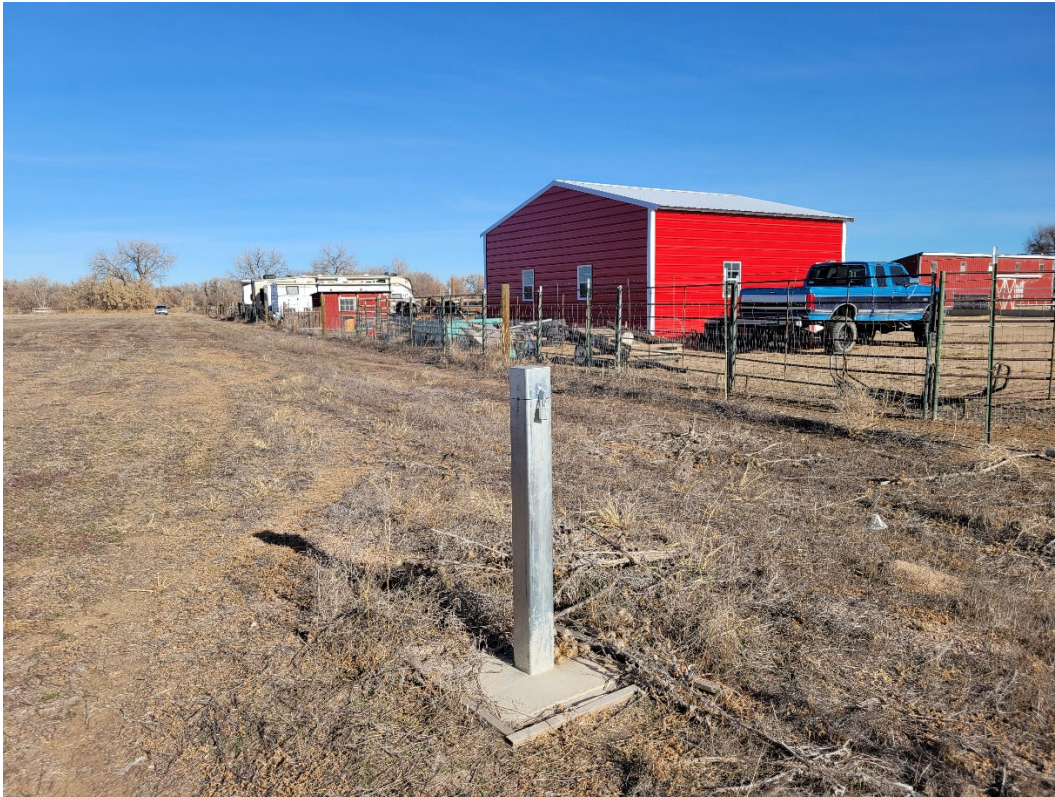
Photo 19: Monitoring well MW-7 on the eastern side of the permit area. Domestic well was observed on the adjacent residential property.