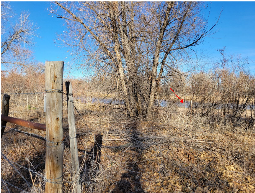
Photo 16: Northeast corner of the permit area. Approximate extent of mining disturbance on the south side of fence line. South Platte River noted by arrow.