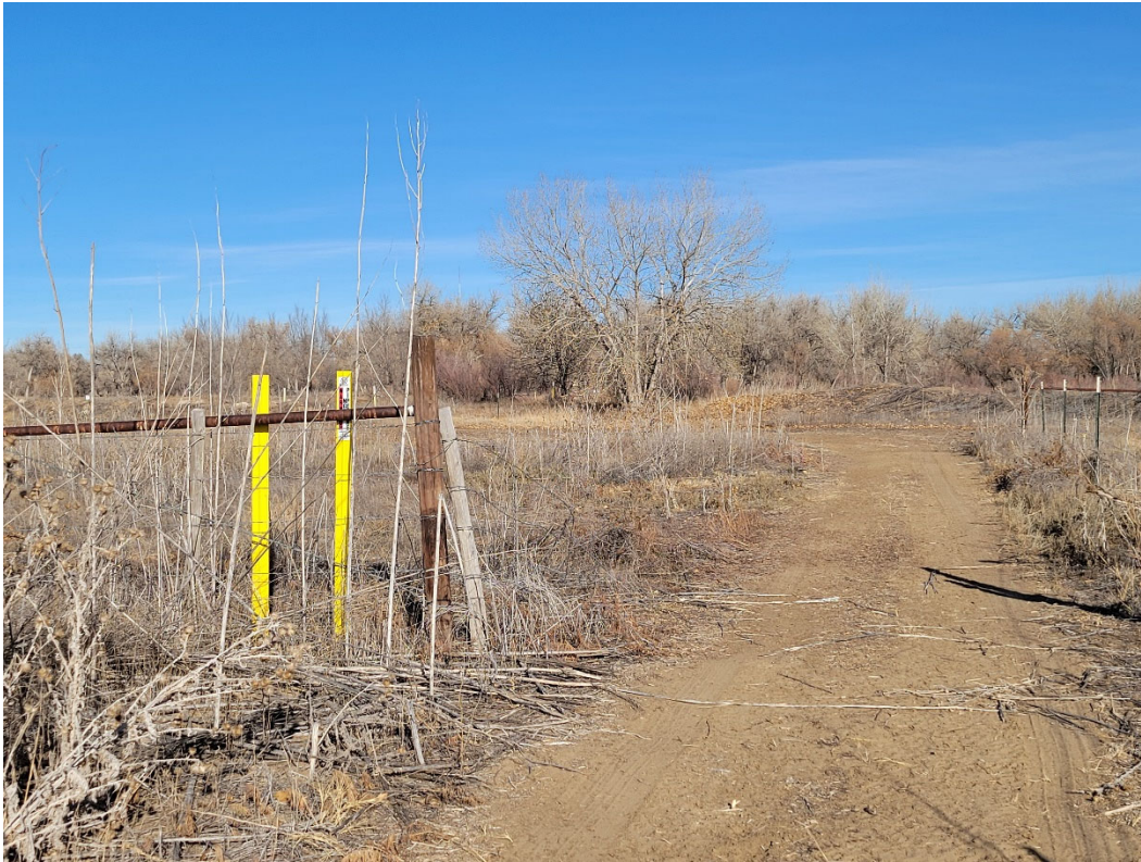
Photo 13: Access to recreation area along the South Platte on the north end of CR35.