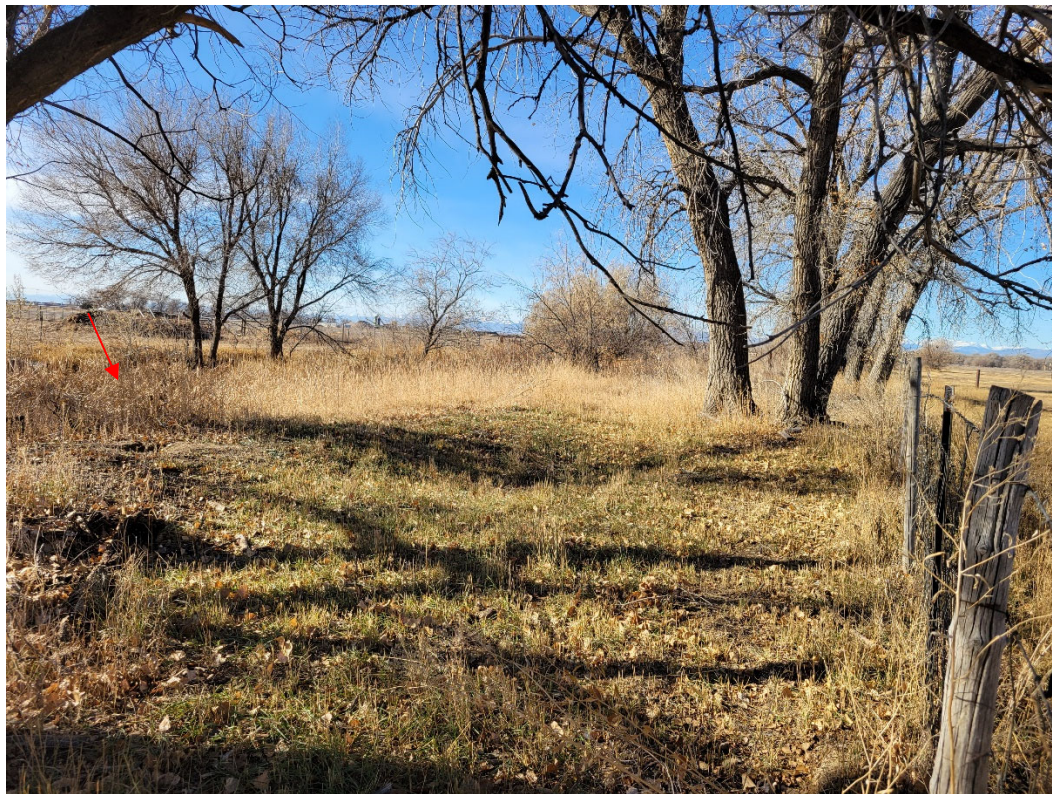
Photo 18: Area on the eastern side of the permit area where a partially filled ditch wetland is located.