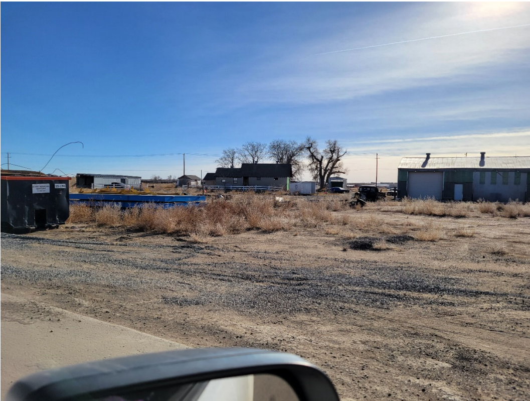
Photo 8: Looking at structures adjacent to the south side of the permit area, south of the processing facility.