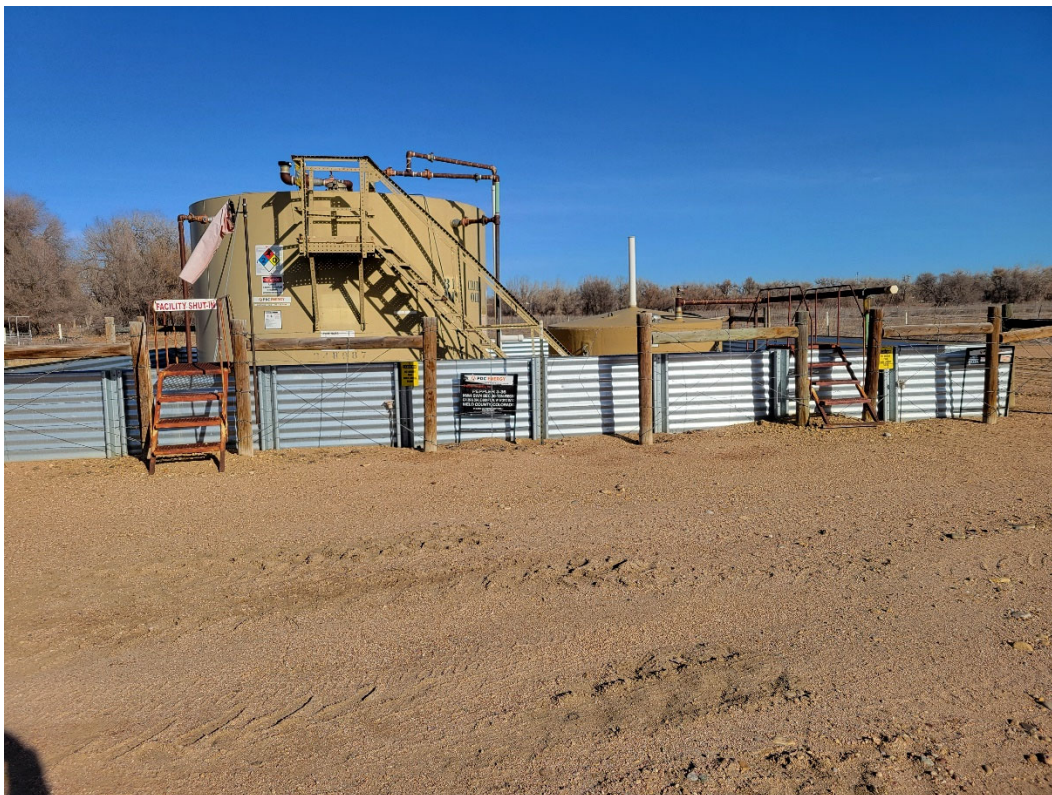
Photo 4: Oil and gas facility in the northwest corner of the Phase 3 mining area. The sign indicates the facility is shut in.