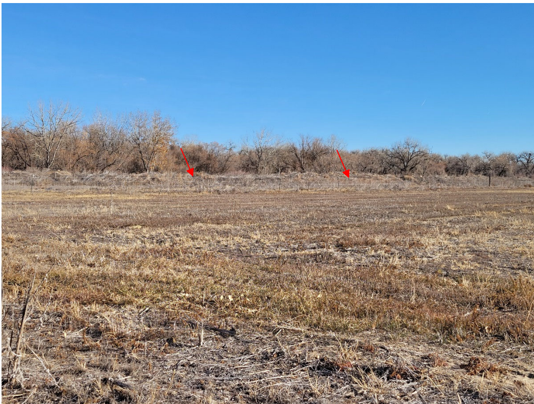
Photo 14: Arrows point to berms along the South Platte River. These are outside the northern permit boundary. Old cars were observed buried in the berms.