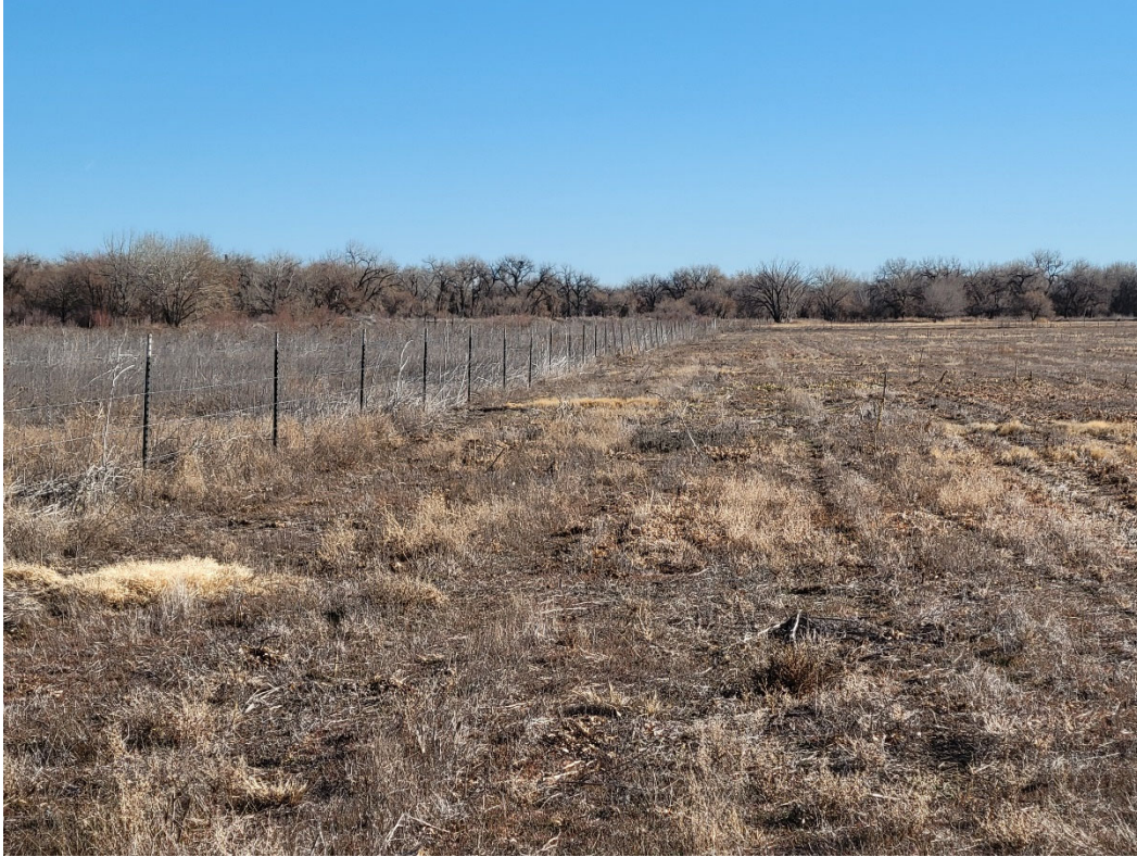
Photo 9: Looking at parcel/permit boundary along the north side of the permit area.