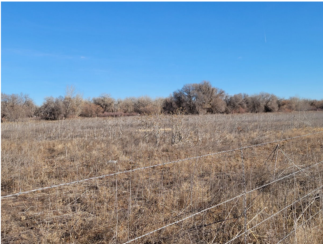
Photo 12: Looking at riparian area along the South Platte. Fence is the permit boundary.