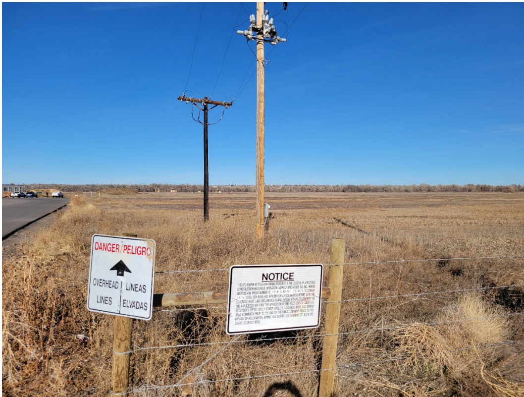
Photo 23: Notice sign posted at the entrance to the site, facing SH 394.