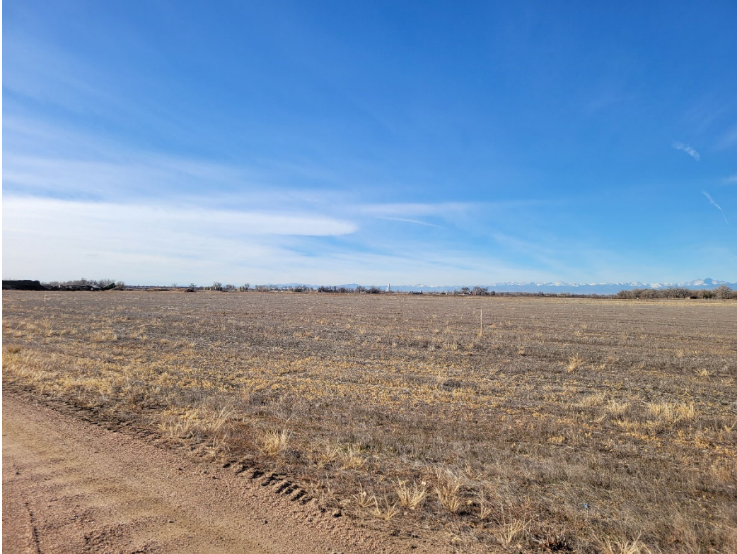
Photo 1: Looking southwest from CR35 at the Phase 2 mining area on the west side of the permit area.