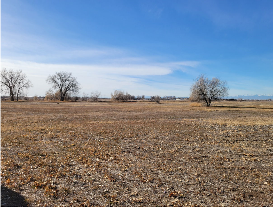
Photo 17: Looking southwest across Phases 5 & 6 from the eastern side of the permit area.