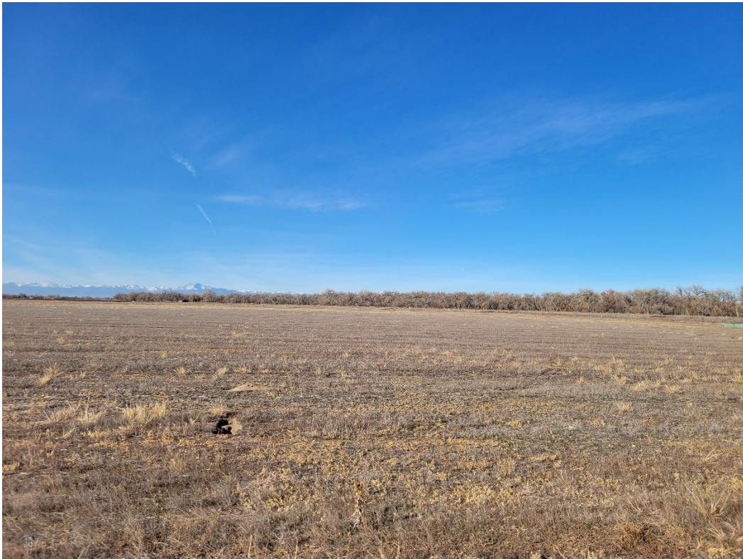
Photo 2: Looking northwest from across the Phase 2 mining area on the west side.