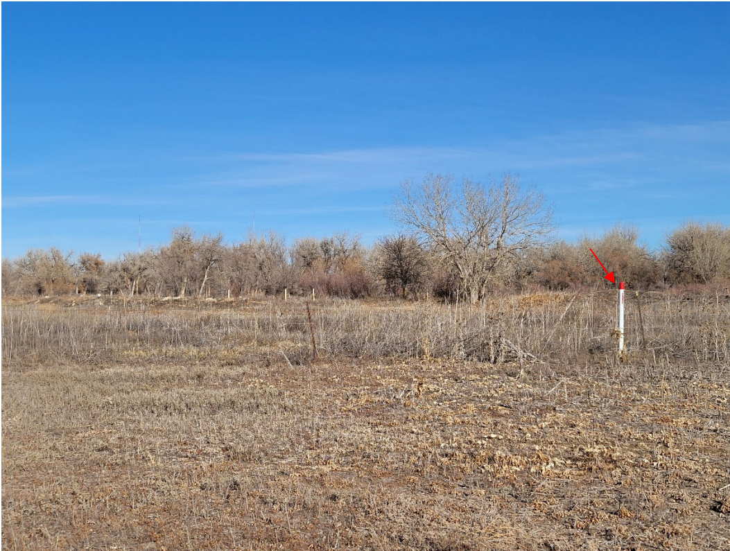
Photo 21: Gas pipeline marker observed on the north end between mining Phases 3 & 5.