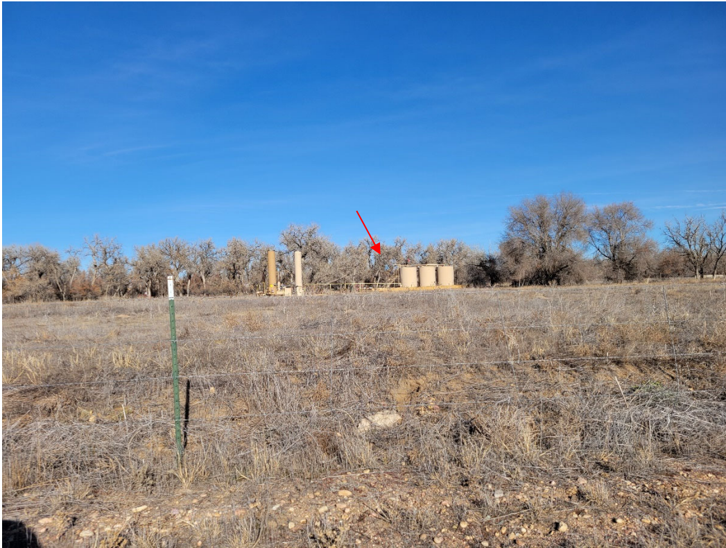
Photo 3: Oil and gas facility north of the Phase 2 mining area. Fence is the permit boundary.