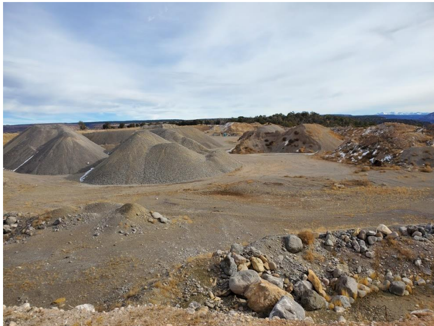
Photo 4 – View to the northeast of product stockpiles with the permit area.