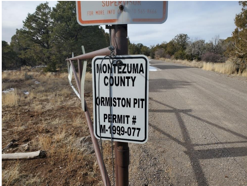
Photo 1 – View to the northeast of product stockpiles with the permit area.