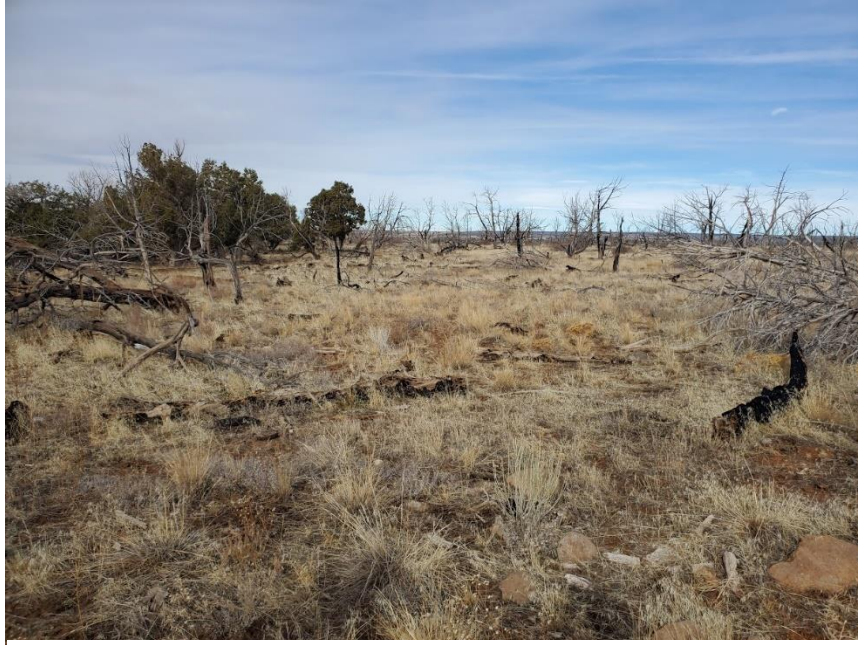
Photo 3 – View to the northwest of undisturbed portions of the permit boundary.