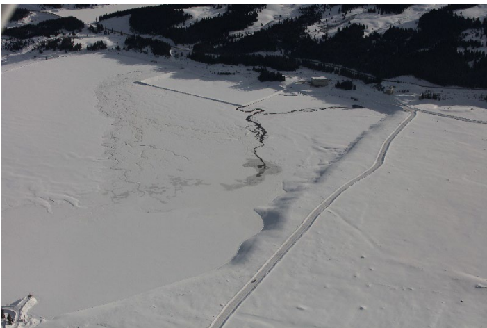
Tenmile Pond/2 Dam