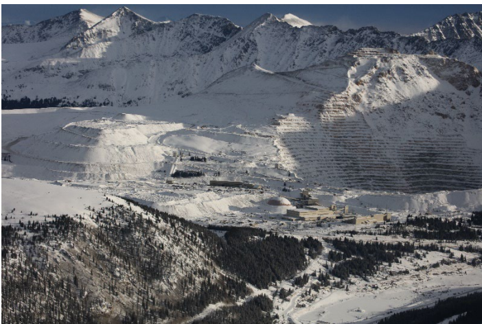
North 40 and McNulty OSF

The North 40 and McNulty OSF's were observed. No abnormal conditions were noted. OSF's appear to be functioning within the established design criteria.