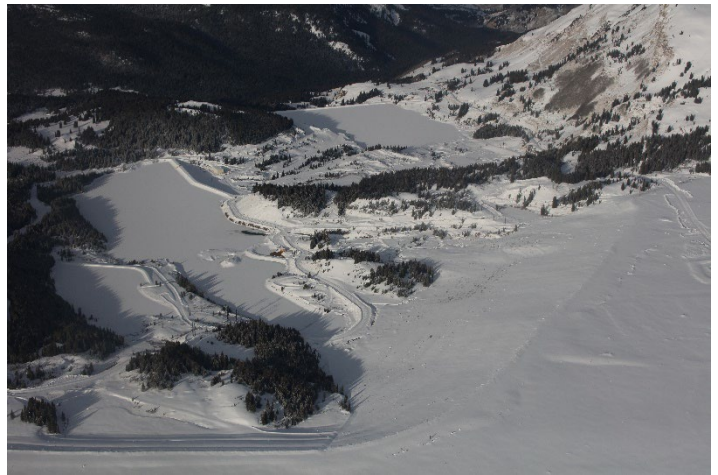
Robinson Lake / Eagle Park Reservoir

No problems or violations were noted during this inspection.