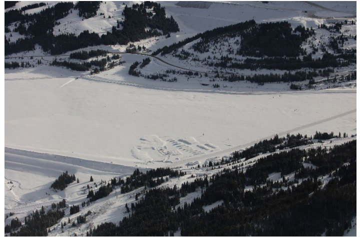
Robinson TSF/1 Dam