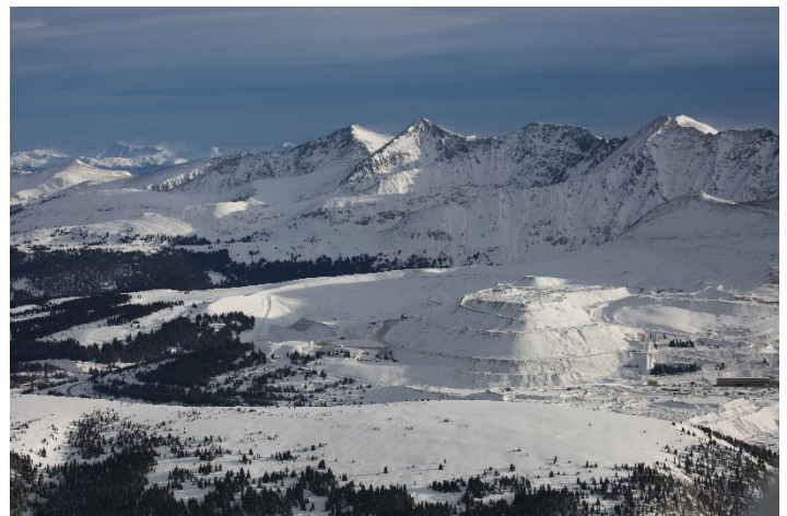
North 40 and McNulty OSF