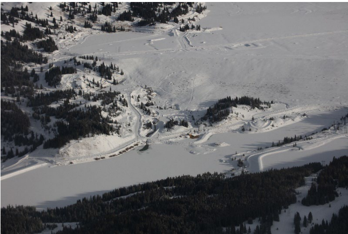
Robinson Lake/1 Dam