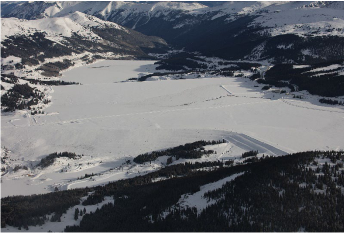
Robinson TSF/1 Dam

The Mayflower TSF and 5 Dam, Tenmile TSF and 3 Dam, Robinson TSF and 1 and 2 Dams, Robinson Lake, Eagle Park Reservoir and 4 Dam were observed. No abnormal conditions were noted. TSF's appear to be functioning within the established design criteria.