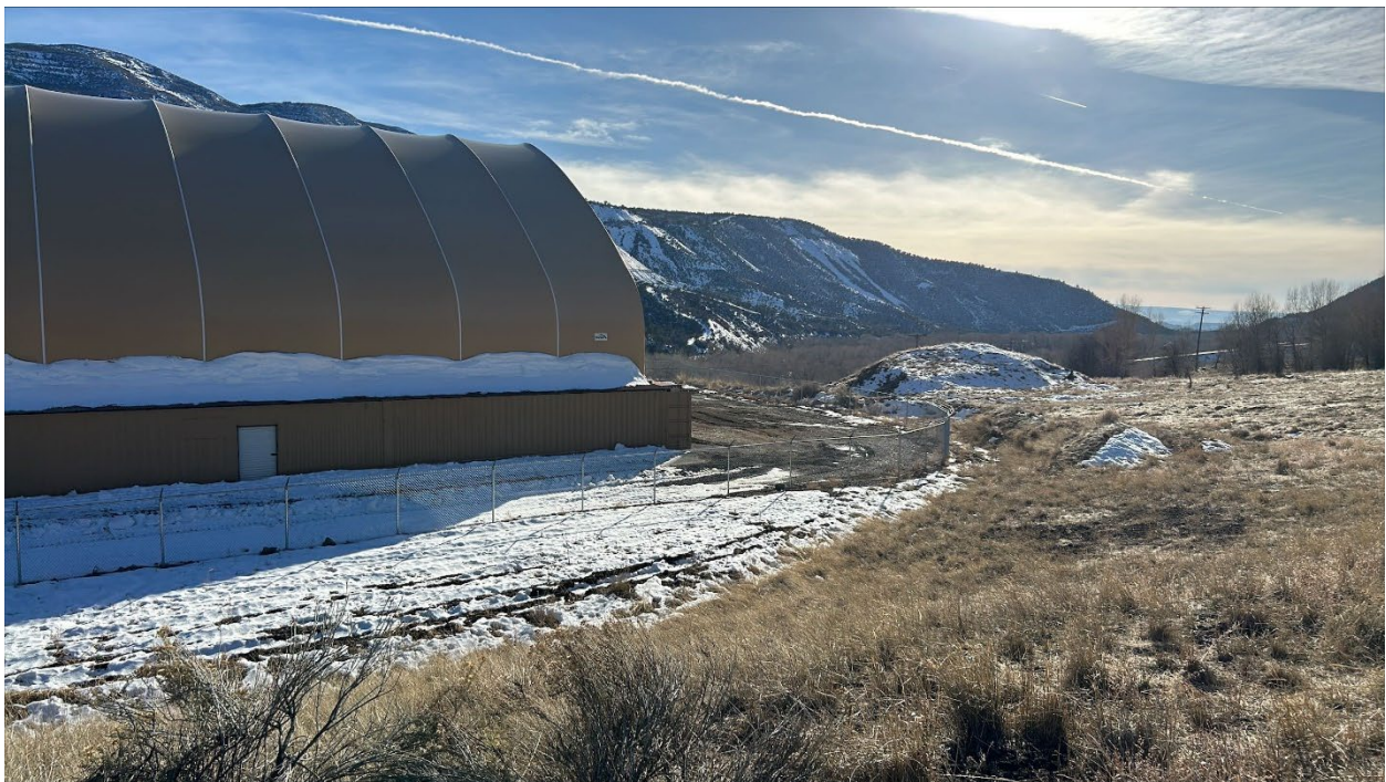
Figure 2: West side of lower pad and topsoil stockpile

Number of Partial Inspection this Fiscal Year: 4