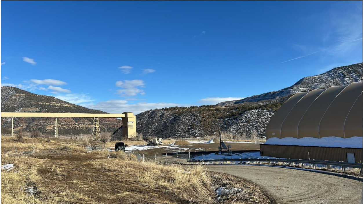
Figure 1: Power poles removed