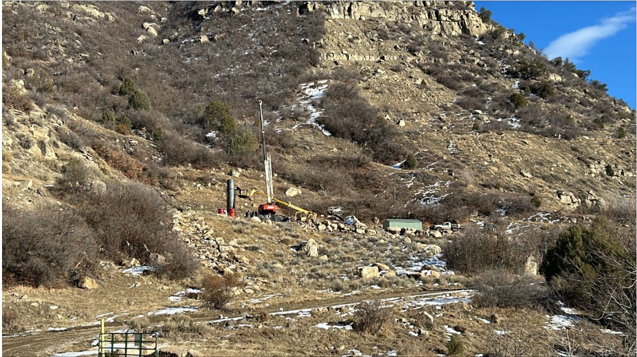
Figure 1: Installation of methane burner in Hubbard Creek in progres

Number of Partial Inspection this Fiscal Year: 4