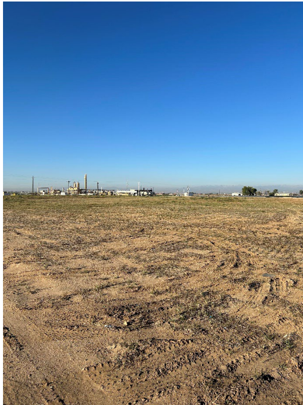
Photo 4: Reseeded area south of irrigation pond, facing southwest.