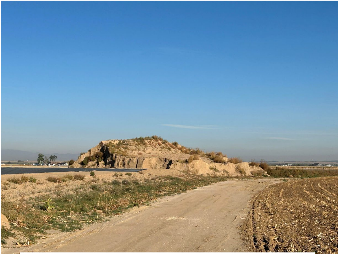
Photo 3: Stockpiled material north of irrigation pond, facing north.