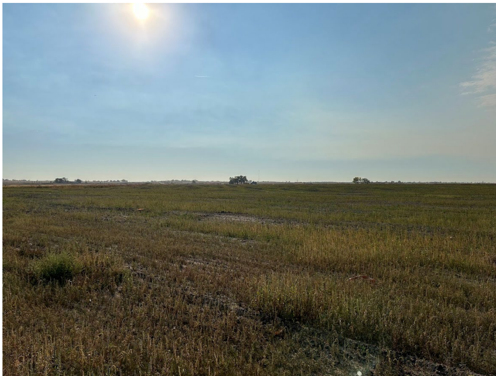
Photo 3: Revegetated area in the northeast quadrant, facing southeast.