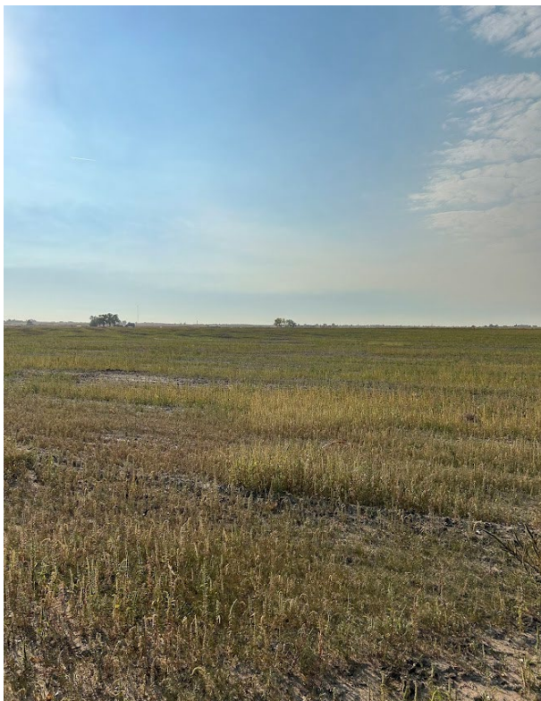
Photo 1: Revegetated area in the northeast quadrant, facing south.