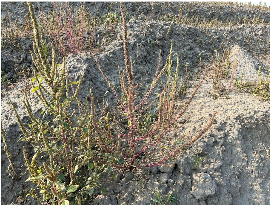
Photo 5: Ragweed growing on topsoil stockpile in northwest quadrant.