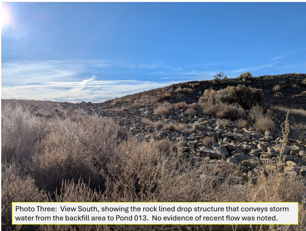
Photo Three: View South, showing the rock lined drop structure that conveys storm water from the backfill area to Pond 013. No evidence of recent flow was noted.

Number of Partial Inspection this Fiscal Year: 4