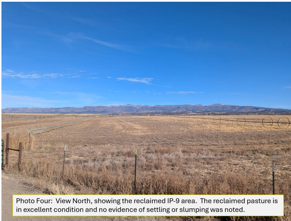
Photo Four: View North, showing the reclaimed IP-9 area. The reclaimed pasture is in excellent condition and no evidence of settling or slumping was noted.