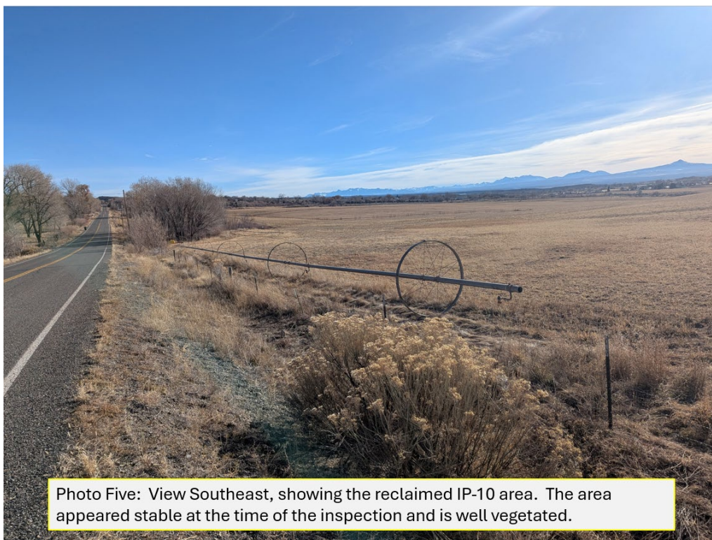
Photo Five: View Southeast, showing the reclaimed IP-10 area. The area appeared stable at the time of the inspection and is well vegetated.

Number of Partial Inspection this Fiscal Year: 4