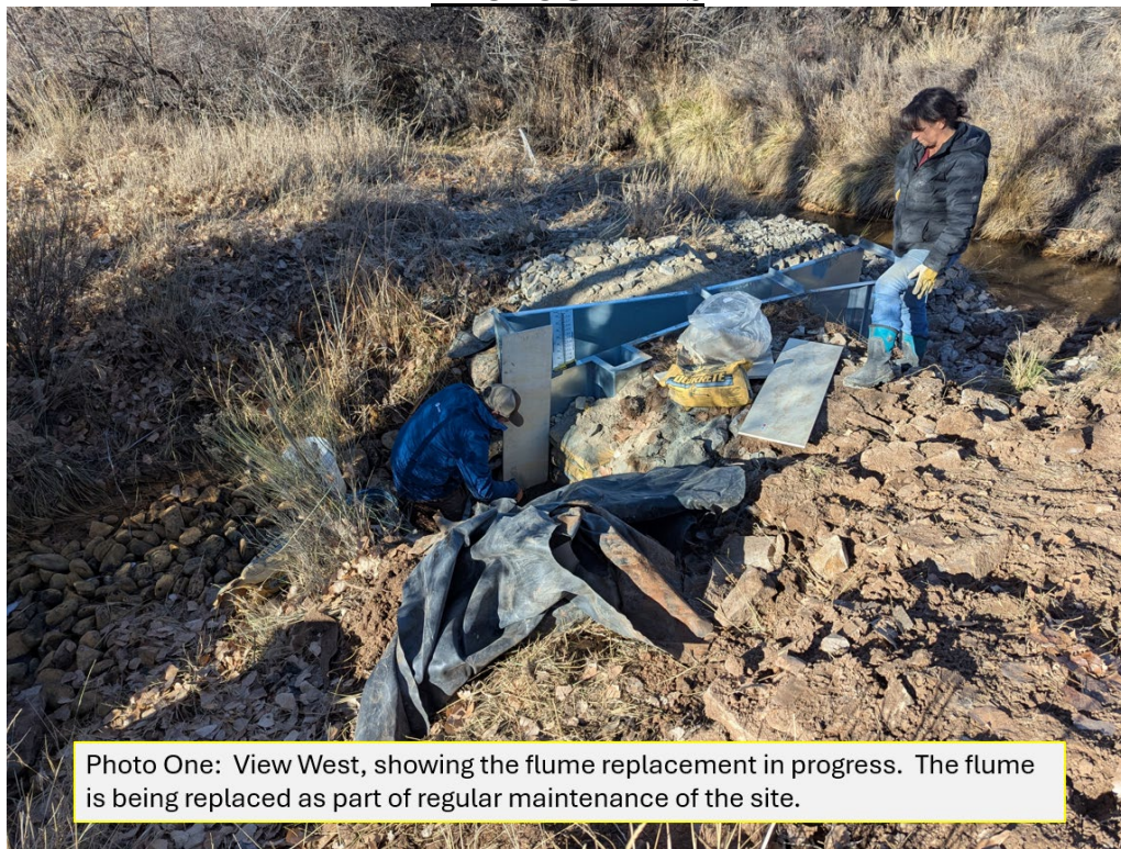
Photo One: View West, showing the flume replacement in progress. The flume is being replaced as part of regular maintenance of the site.

Number of Partial Inspection this Fiscal Year: 4