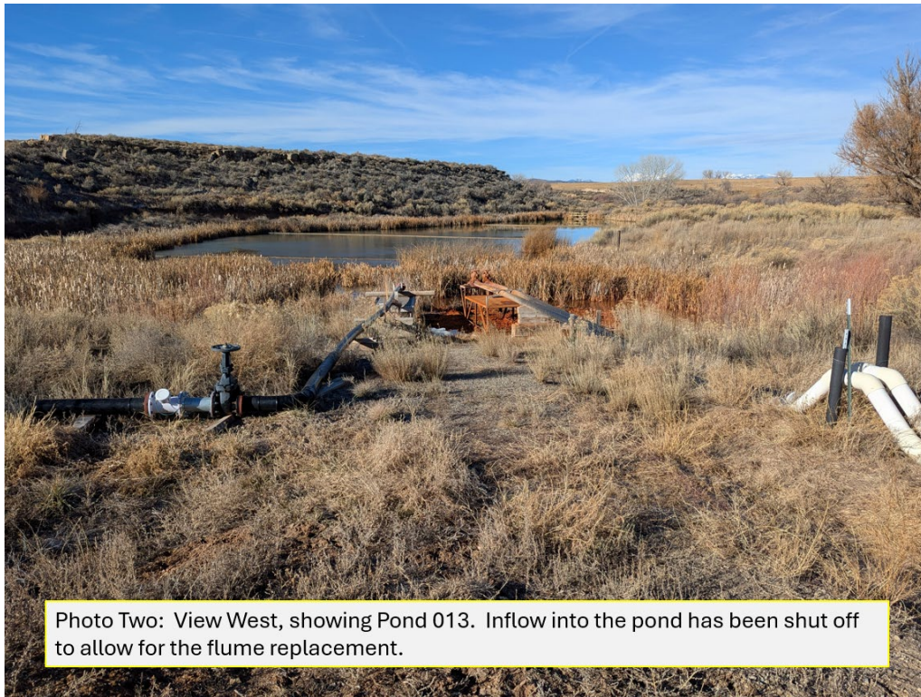
Photo Two: View West, showing Pond 013. Inflow into the pond has been shut off to allow for the flume replacement.