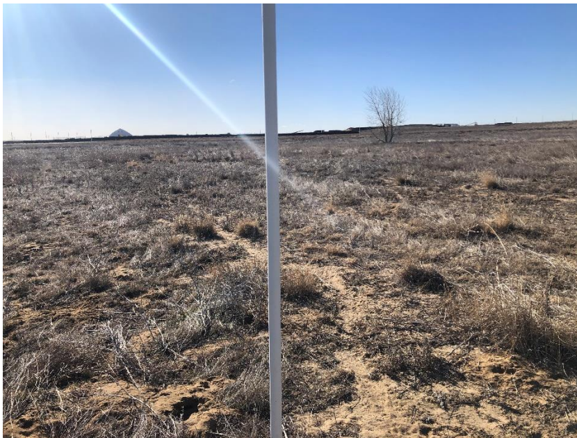
Boundary markers at south end of Area 34 (“peninsula” of boundary)

Number of Partial Inspection this Fiscal Year: 4