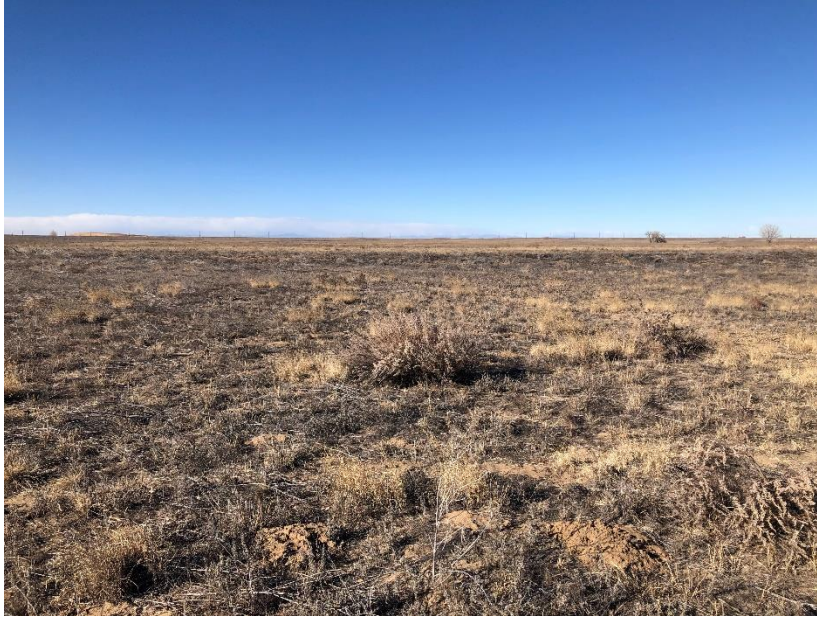
Looking west at Area 25 and areas beyond