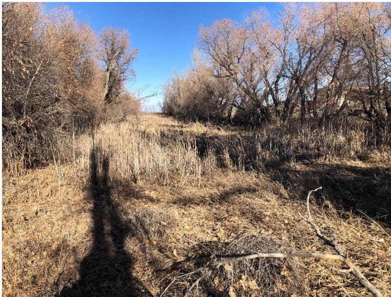
Dugout Pond, looking north

Number of Partial Inspection this Fiscal Year: 4