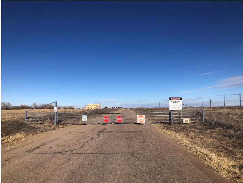
Locked gate on County Road 59