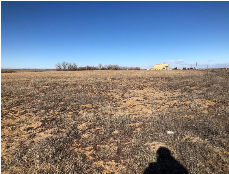
Looking northwest at Area 38

Number of Partial Inspection this Fiscal Year: 4