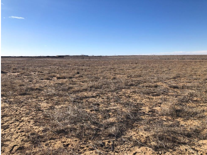
Looking southwest at Area 34