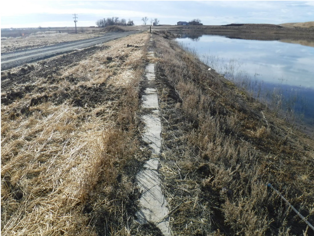
Photo 5: Cutoff wall marking the emergency spillway for the reservoir