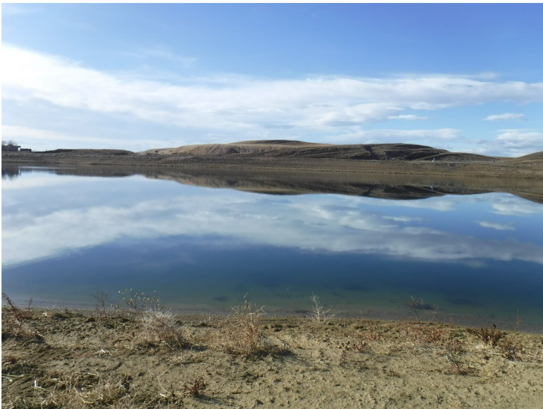
Photo 4: Looking across the reservoir at the remaining stockpiles of material that will be removed from the site