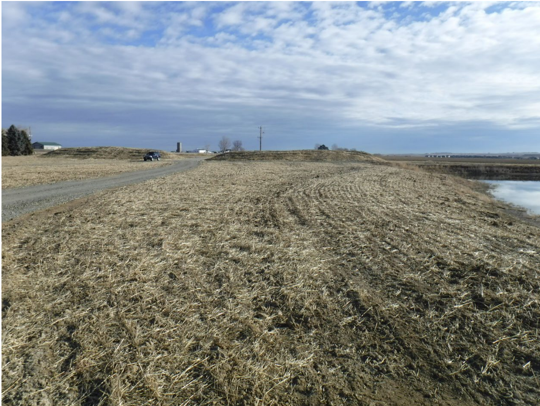
Photo 3: Area around the pump house that has been crimped and seeded