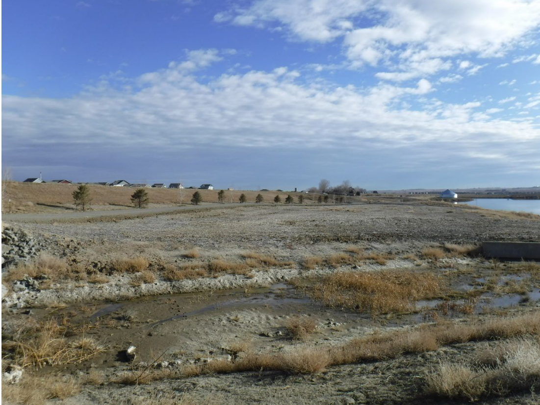
Photo 11: Looking east across the northern berm area of the permit boundary