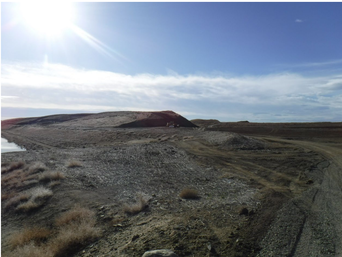
Photo 10: Looking south from the north side of the permit area at the remaining stockpiles