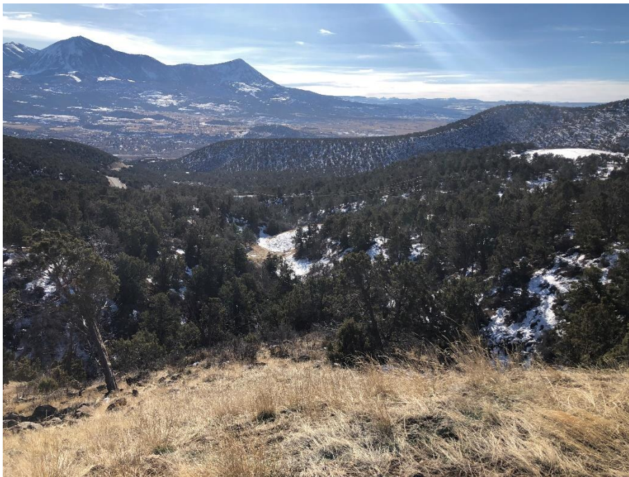
East Mine drainage looking down at reclaimed Ponds 3 and 4 (from the Old Waste Disposal Area)

Number of Partial Inspection this Fiscal Year: 4