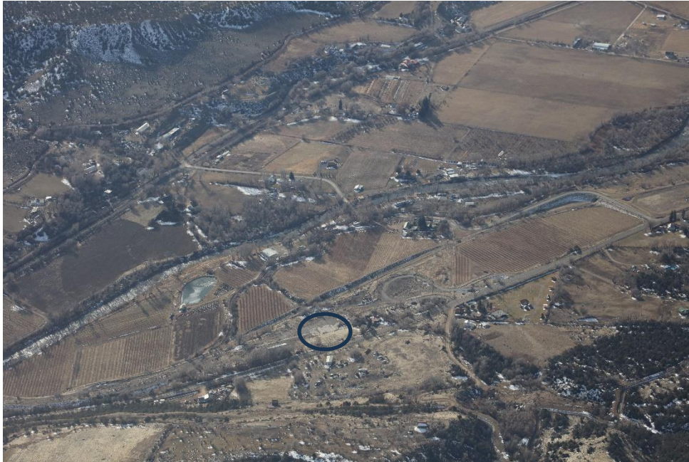
Area around loadout, with silo foundations circled