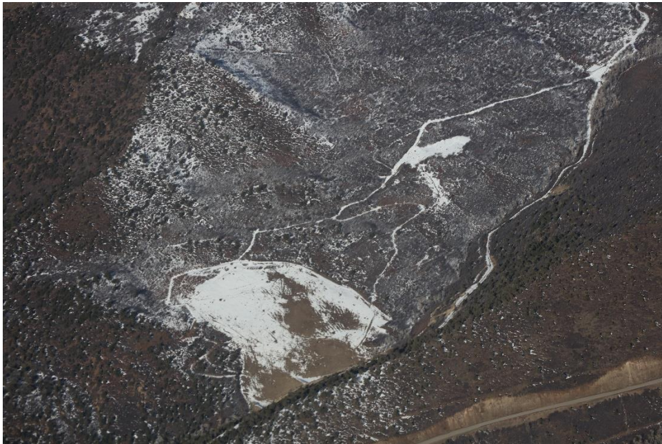
West Mine and pad for the West Mine Fan

Number of Partial Inspection this Fiscal Year: 4