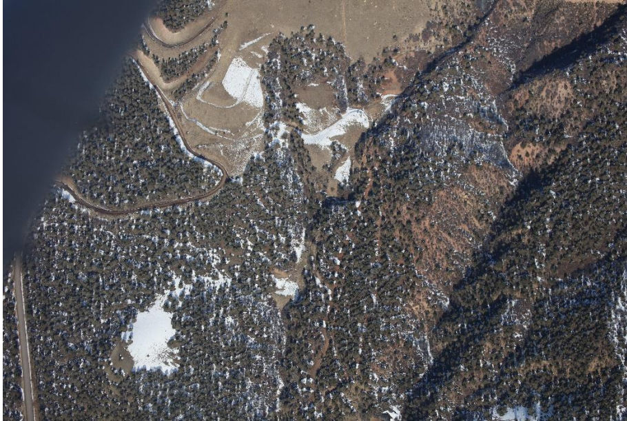
East Mine drainage with reclaimed Ponds 1 - 4