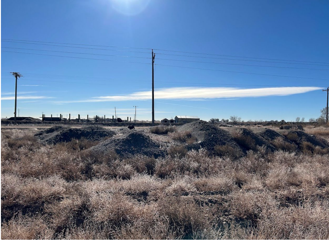
Photo 5: Stockpile near intersection of County Road 84 and County Road 31, facing east.