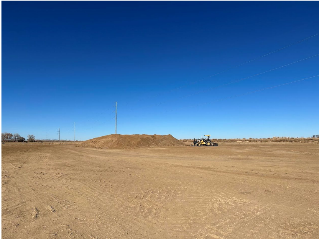
Photo 9: Large stockpile in the northern portion of the tilled field, facing northwest.