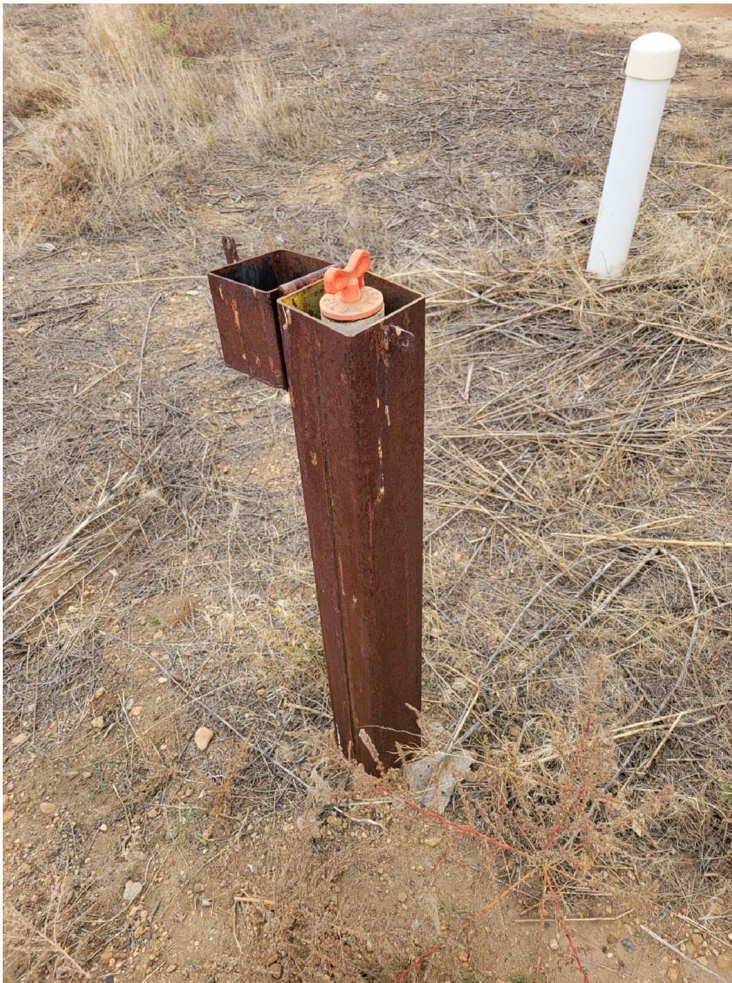
Photo 12: Groundwater monitoring well on Accord's property outside the northern permit boundary.