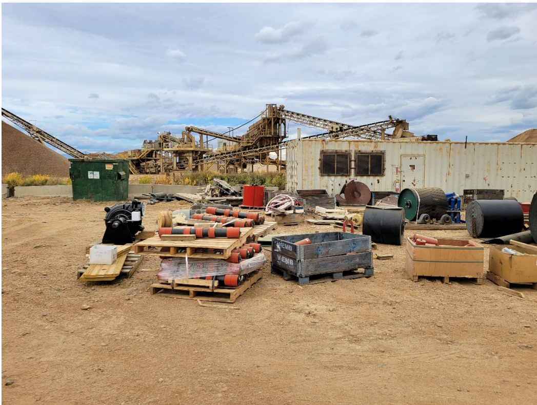
Photo 11: Equipment storage area adjacent to the processing plant.