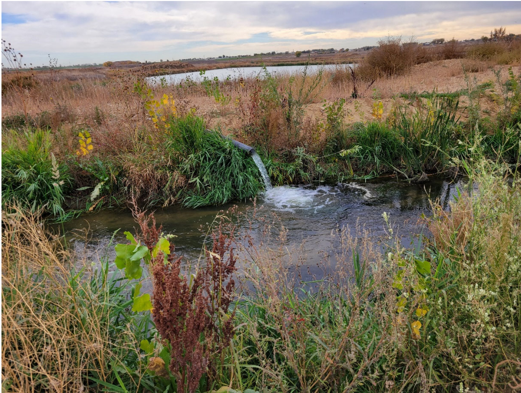
Photo 6: Water discharging into Last Chance ditch in the northwest corner of the site.