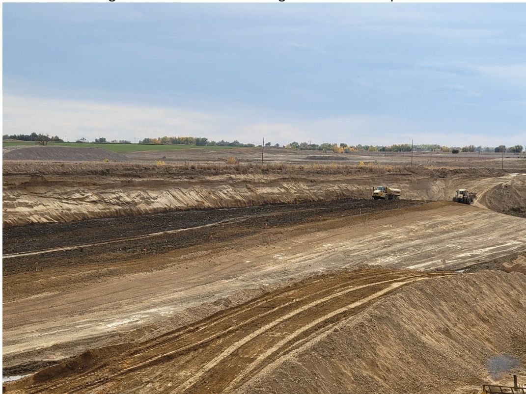
Photo 2: Looking southeast at placement of clay lining in the northeastern corner of Area 3.