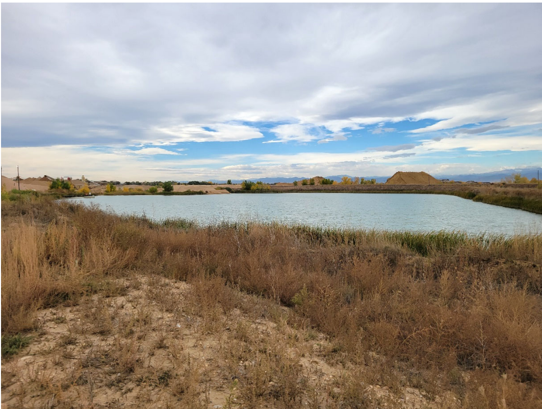
Photo 7: Pond adjacent to the plant area in the northwest corner of the mining area.