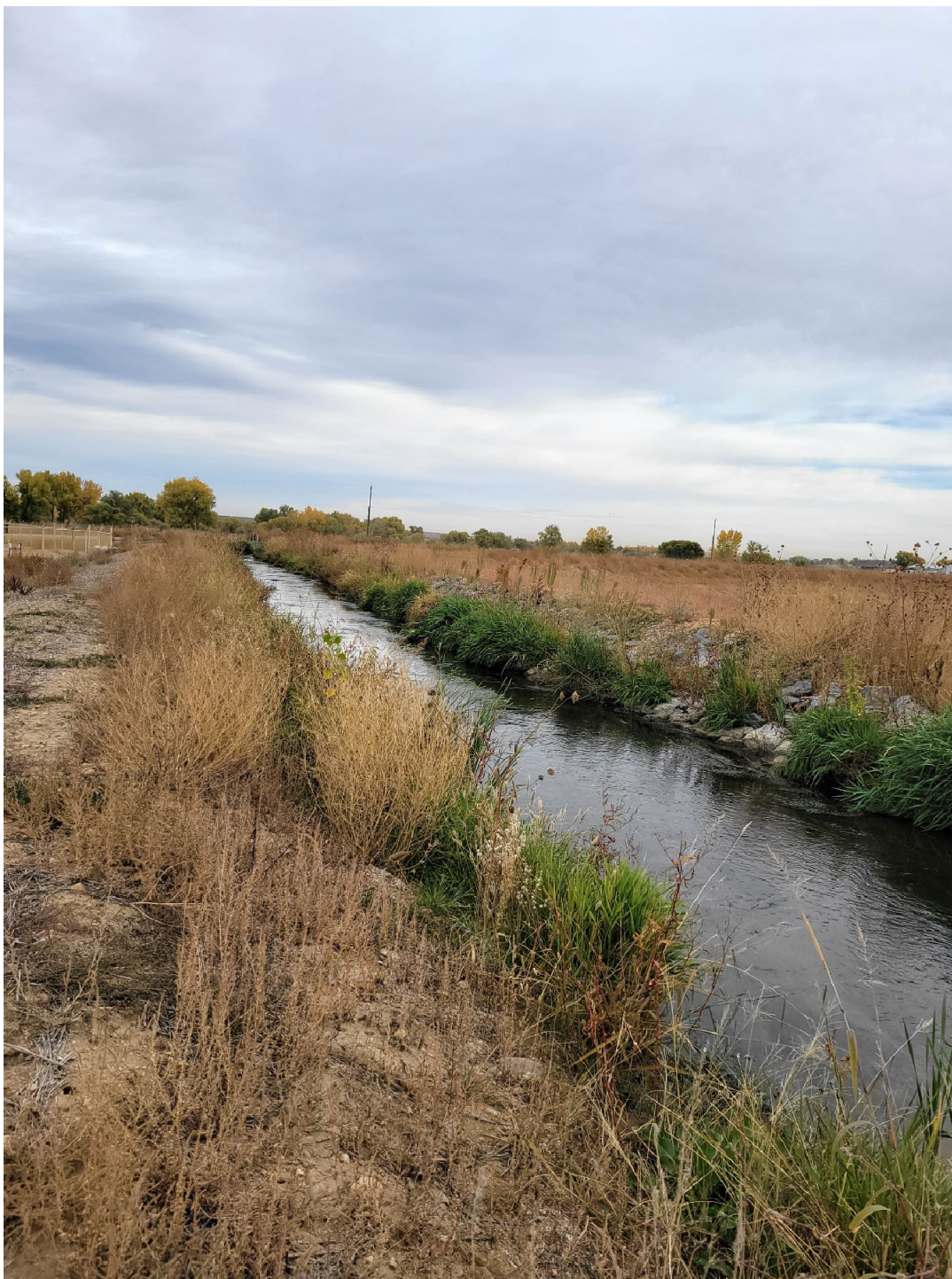
Photo 5: Relocated Last Chance ditch on the north end of the site.