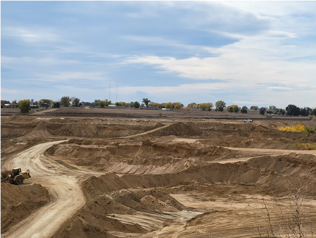
Photo 1: Looking south at the active mining in the northern portion of Area 3.