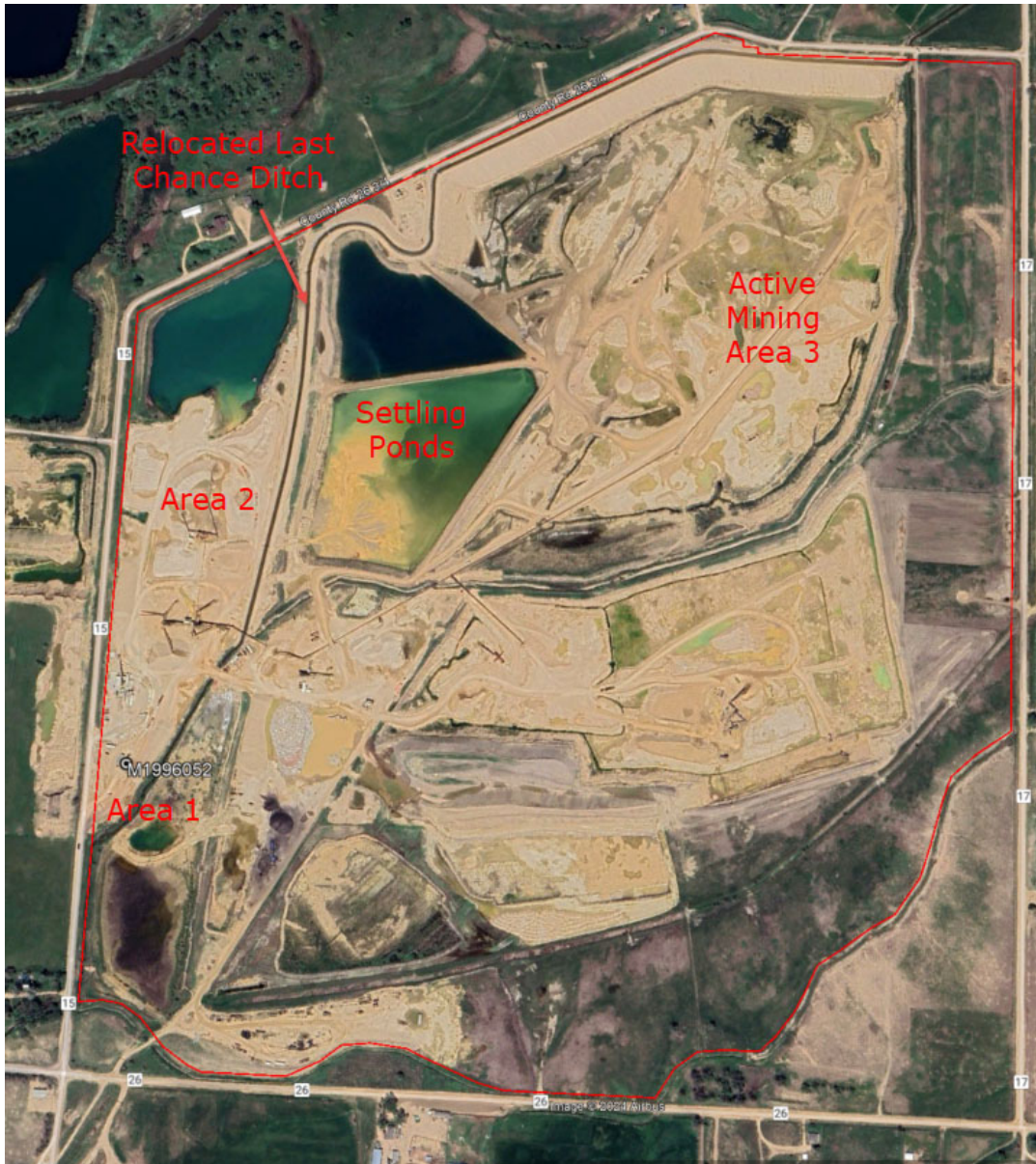
Figure 1: Red line depicts permit Boundary. Google Earth imagery dated May 23, 2023.