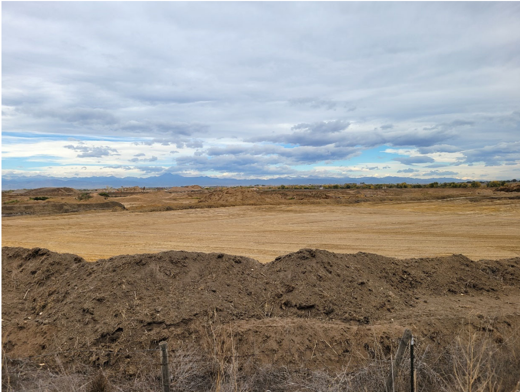
Photo 4: Looking at recently cleared area prepped for mining in the southeast portion of Area 3.