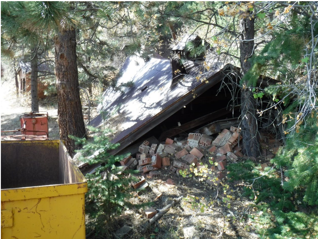
Photo 8: Collapsed building, maintenance building, adjacent to Who Do shaft