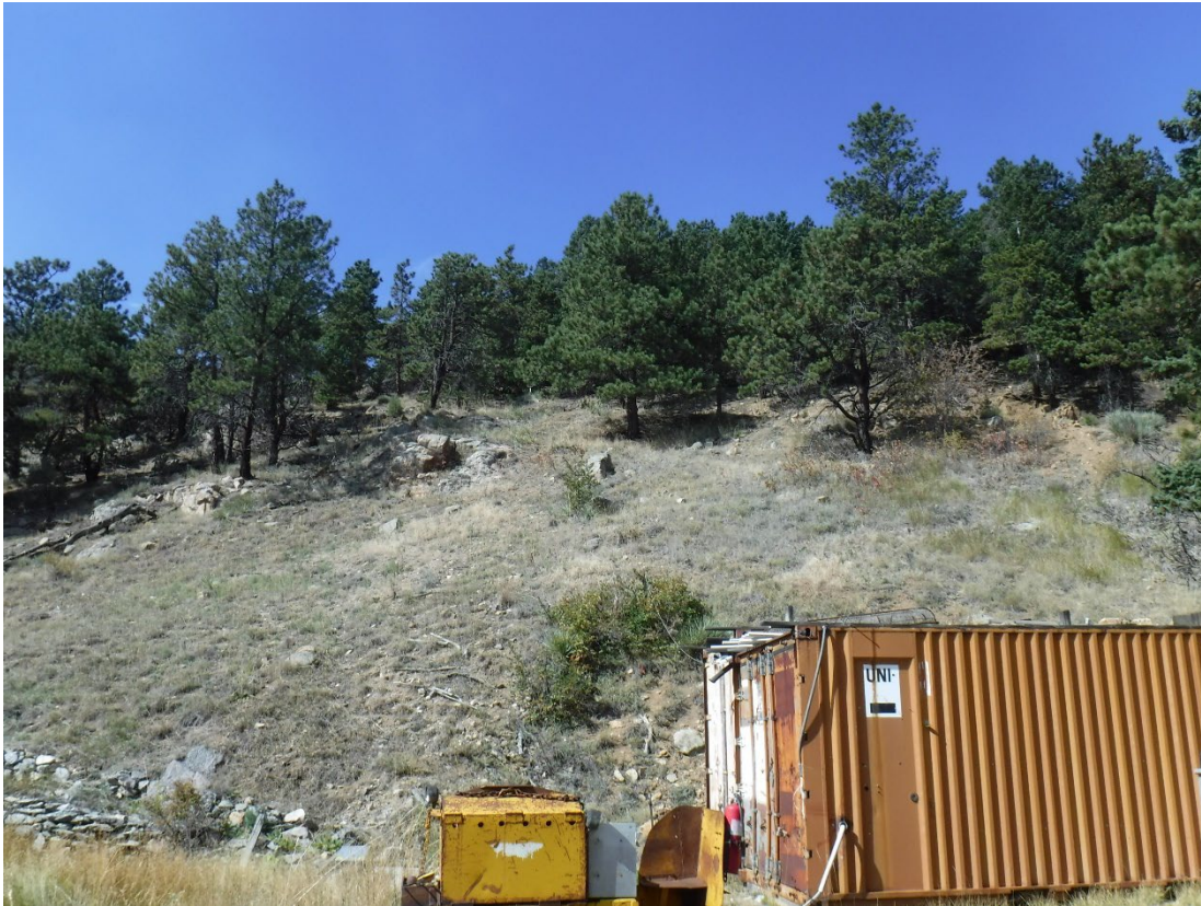
Photo 13: Looking uphill from Mount Royale Adit No. 1 area towards Cash Mine area