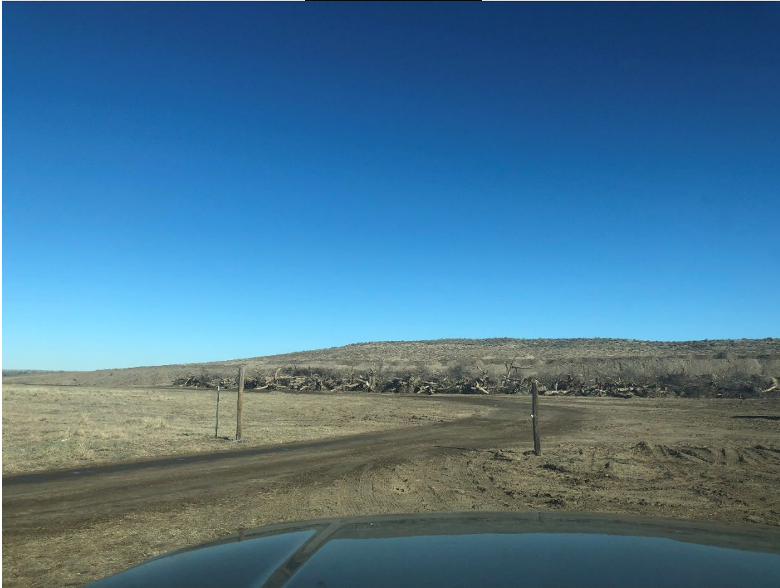
Photo 1: Large woody debris being stockpiled at the site, north end of the site