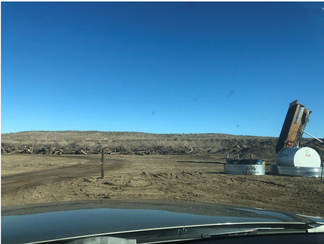
Photo 2: Large woody debris and soil being stockpiled at the site, central portion of the site