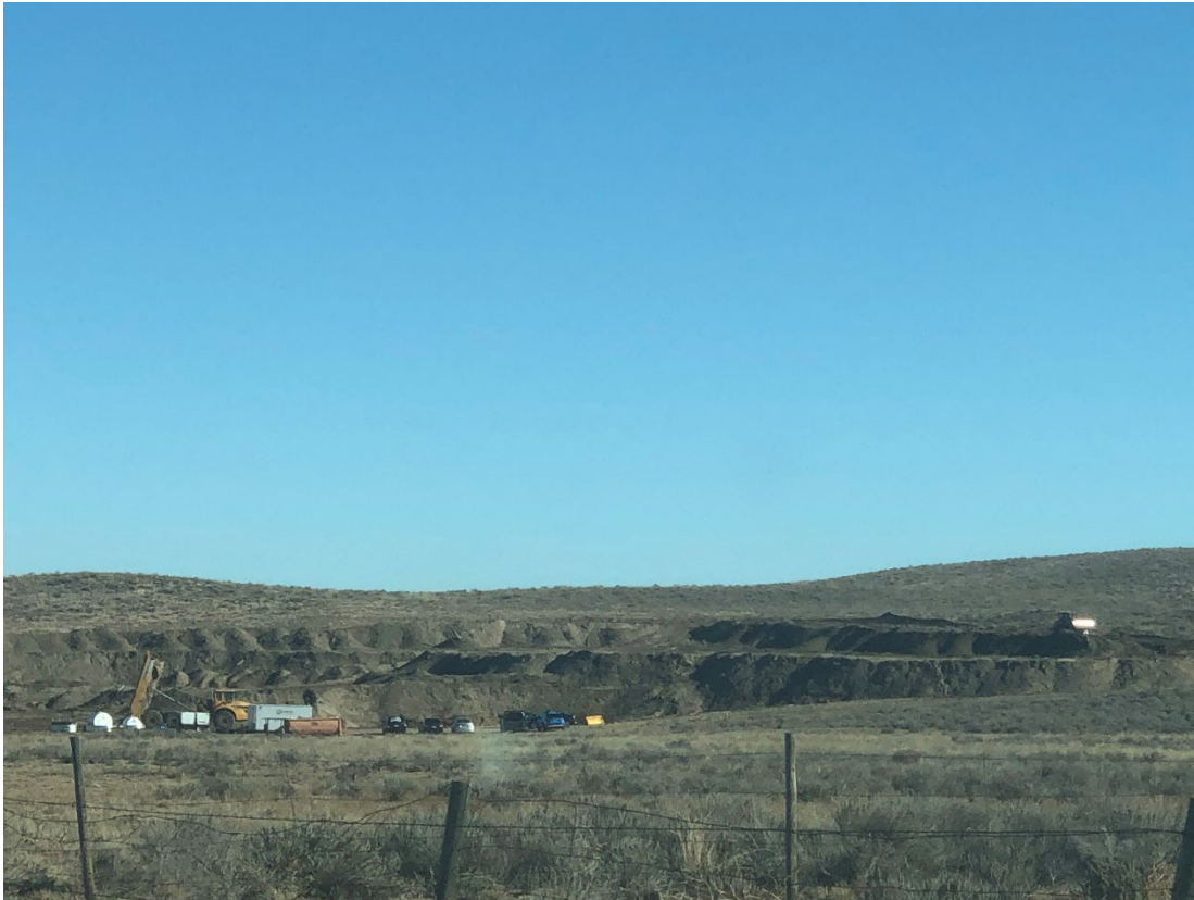
Photo 3: Dozer grading out soil material imported by dump trucks, southern portion of the site