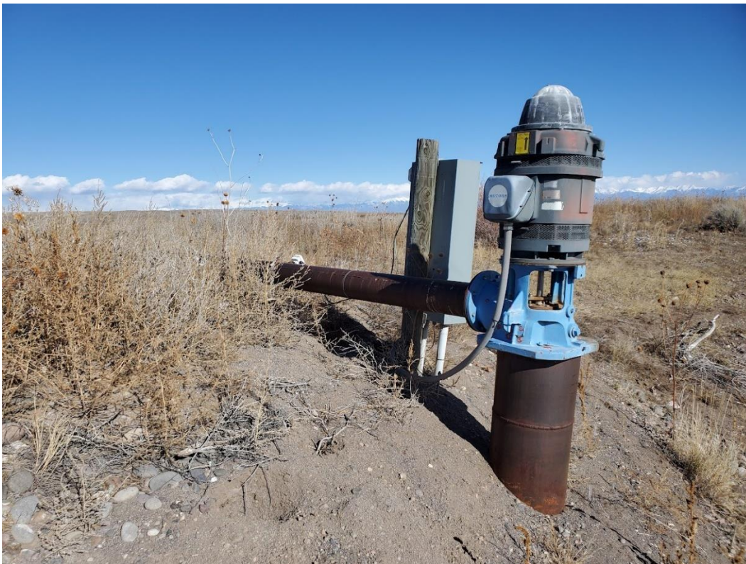
Photo 2 – View to the north of irrigation infrastructure attached to the recharge pond.