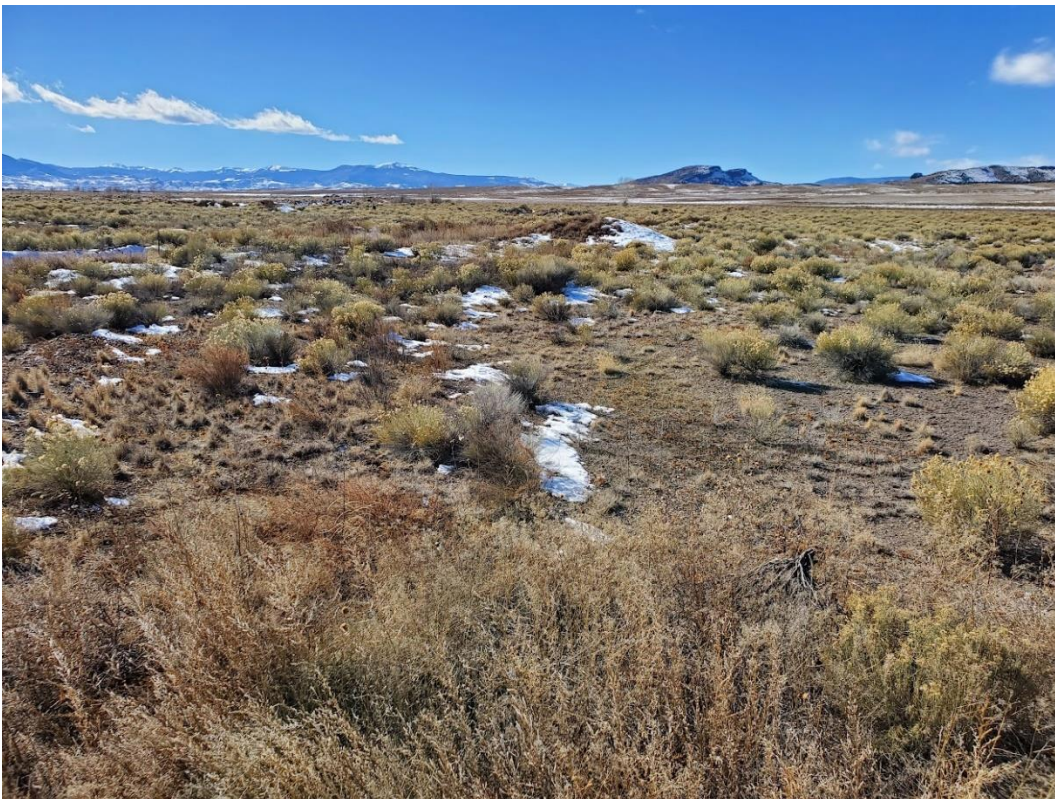
Photo 4 – View to the southwest of undisturbed portion of the permit boundary.