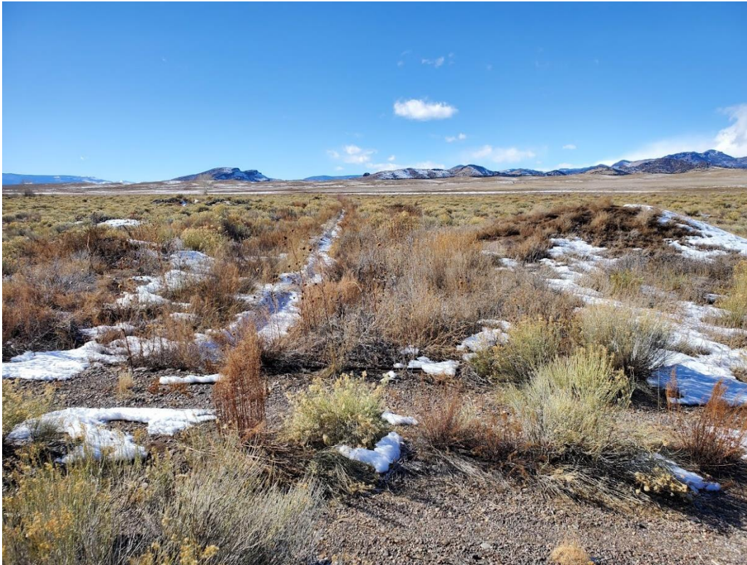
Photo 3 – View to the west of irrigation ditch attached to the recharge pond. Ditch is currently snow covered.