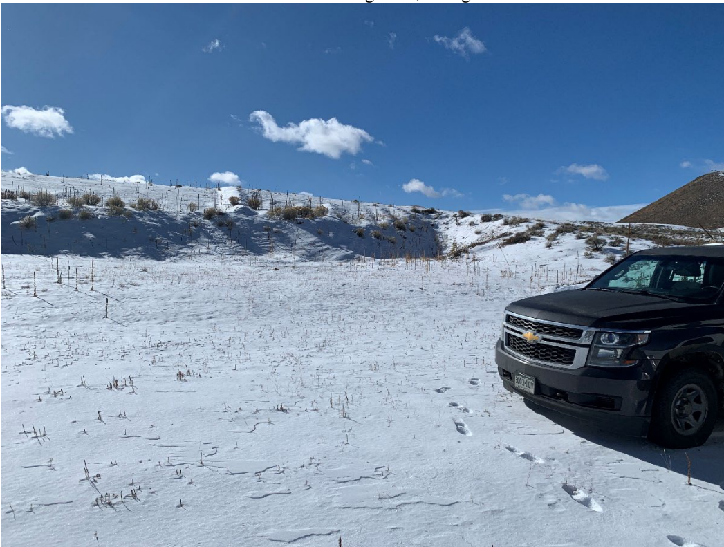
Photo 2- Southwest corner of pit area. Pit floor currently drains to the north.