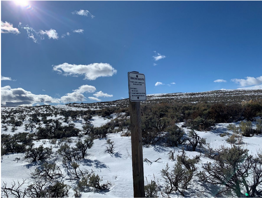
Photo 3- Mine entrance sign facing ranch road on west side of pit area.

Nate Davis Medicine Bow - Routt National Forest USDA Forest Service 210 S. 6th St. Kremmling, CO 80459