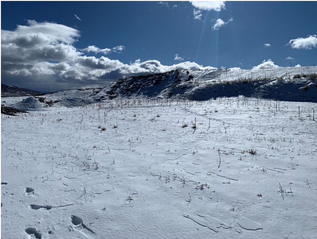
Photo 1- Pit floor and highwall, facing southeast