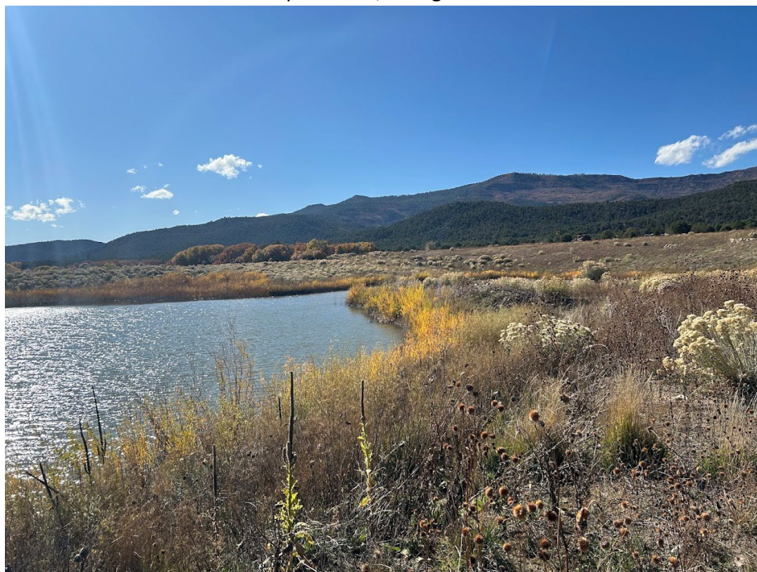
Photo 4: Vegetation along pond shoreline with gentle slopes, facing west.