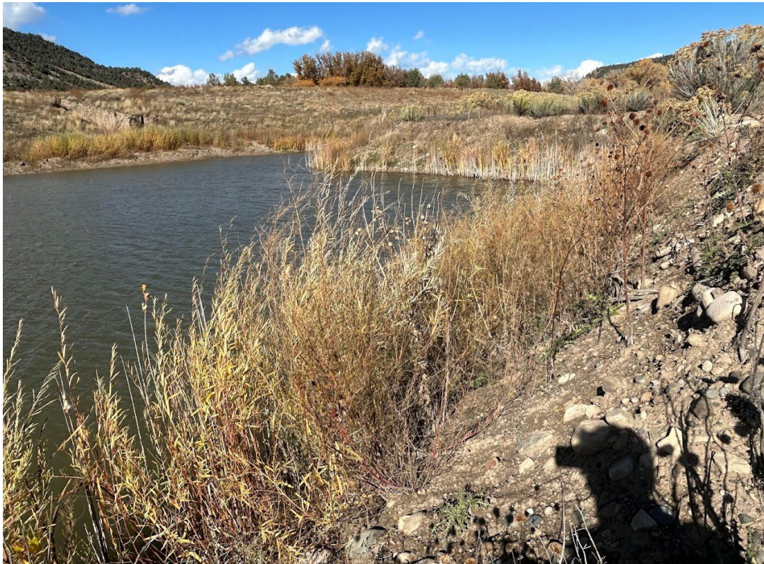
Photo 6: Pond shoreline exhibiting 2H:1V slopes with well-established vegetation.