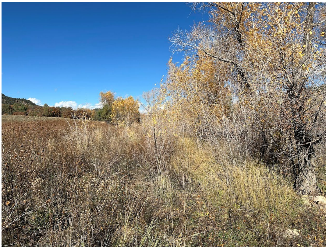
Photo 11: Buffer zone between disturbed area and undisturbed area, facing north.