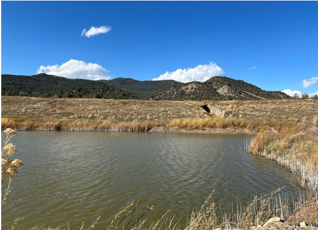
Photo 5: Pond shoreline exhibiting well-established vegetation and gentle slopes.