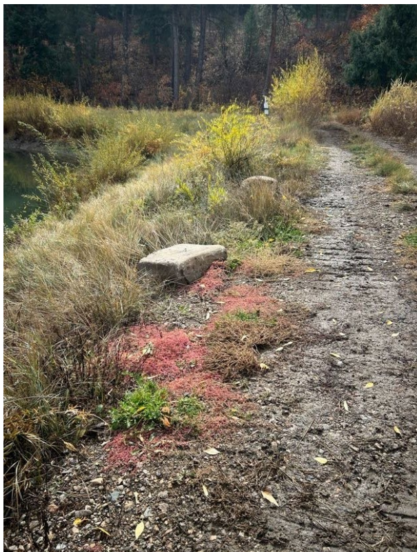
Photo 8: Russian thistle along the south shoreline of Pond A after weed treatment.