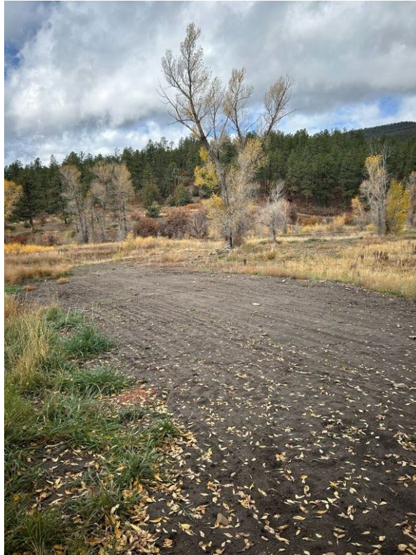
Photo 9: Recently drill-seeded area along the west side of the access road.