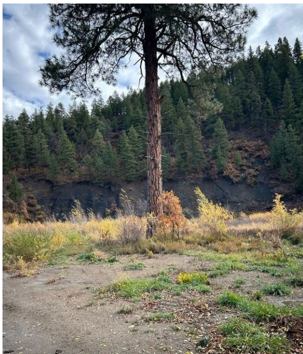
Photo 2: Former location of the Scale House in the central portion of the permit area.