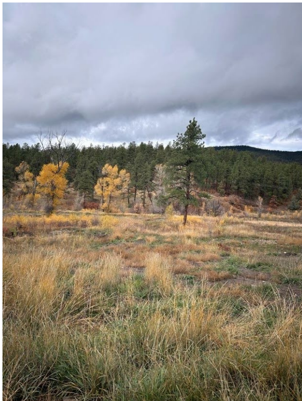
Photo 7: Established vegetation in the central portion of the permit area.