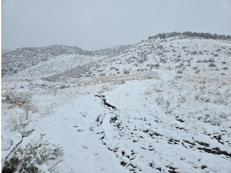
Photo 6: Looking west across the road above D9, leading to Pond 006a.

Number of Partial Inspection this Fiscal Year: 3