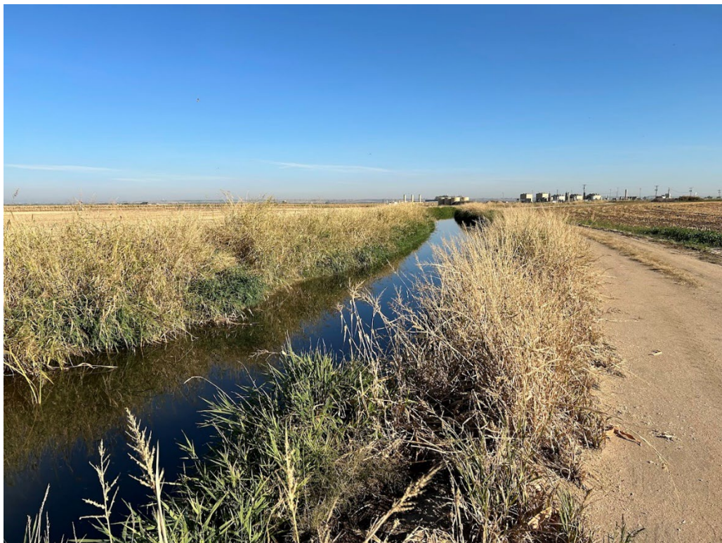
Photo 4: Farmers Independent Ditch along northern permit boundary.