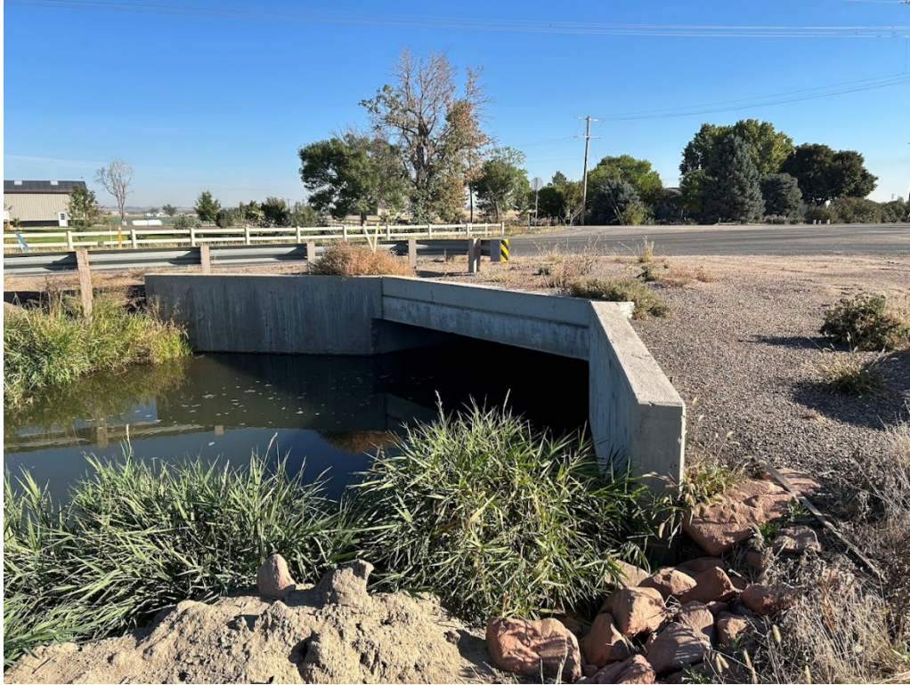
Photo 5: Farmers Independent Ditch through culvert at intersection of WCR 42 and WCR 29.