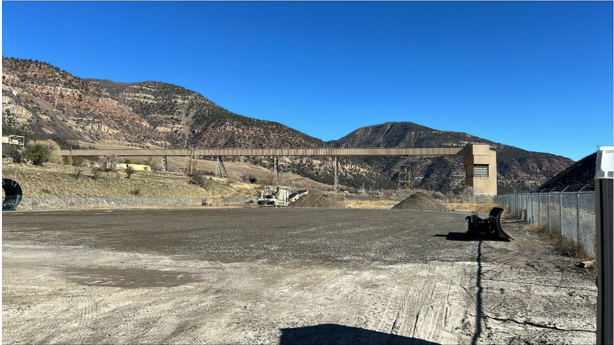
Figure 1: Gravel stockpiled on lower pad

Number of Partial Inspection this Fiscal Year: 3