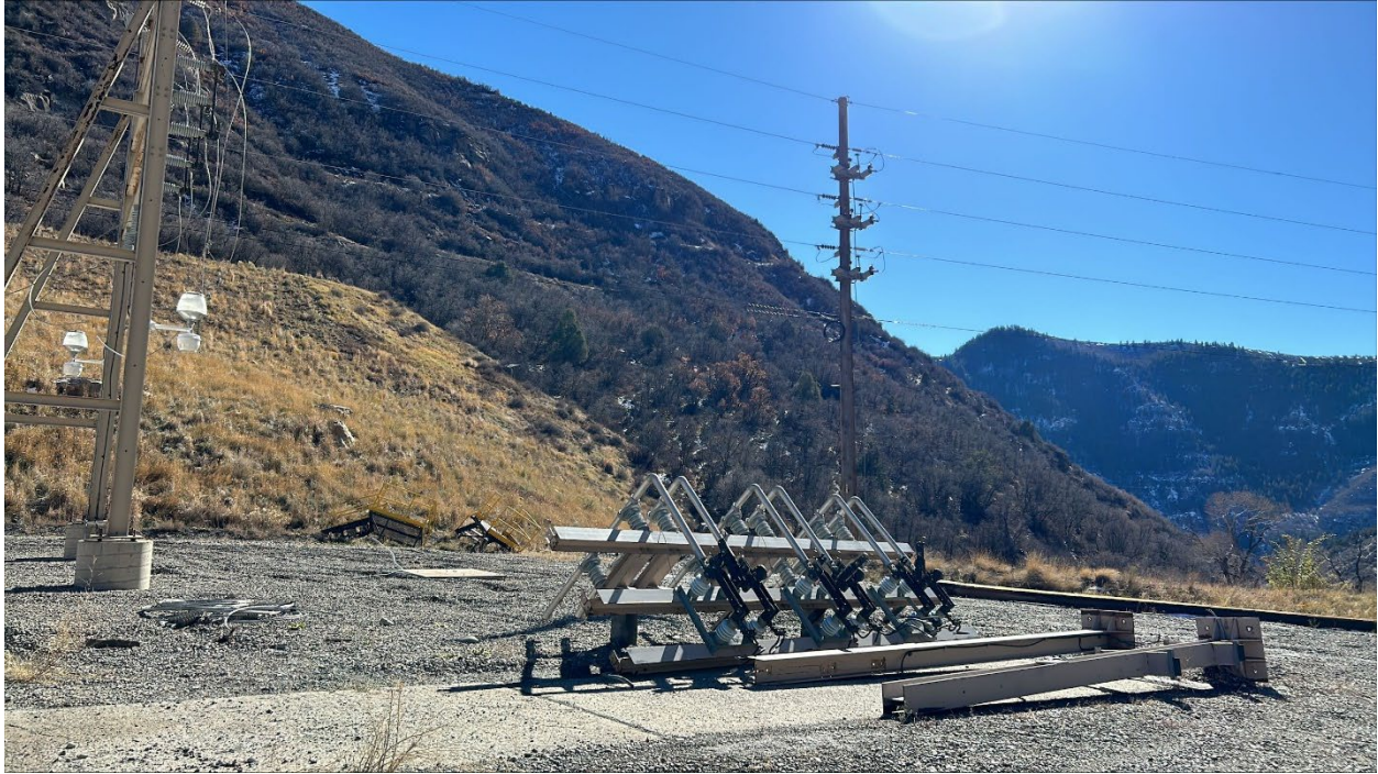
Figure 3: Upper pad (3)

Number of Partial Inspection this Fiscal Year: 3