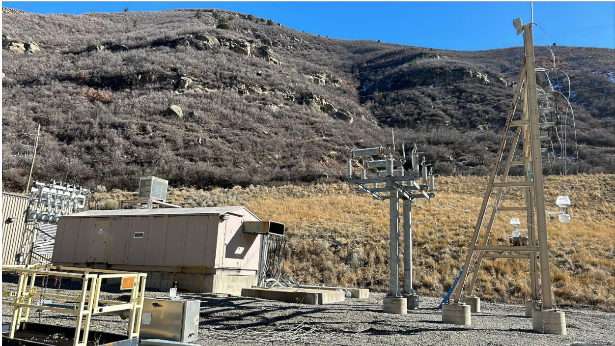
Figure 2: Upper pad (2)

Number of Partial Inspection this Fiscal Year: 3