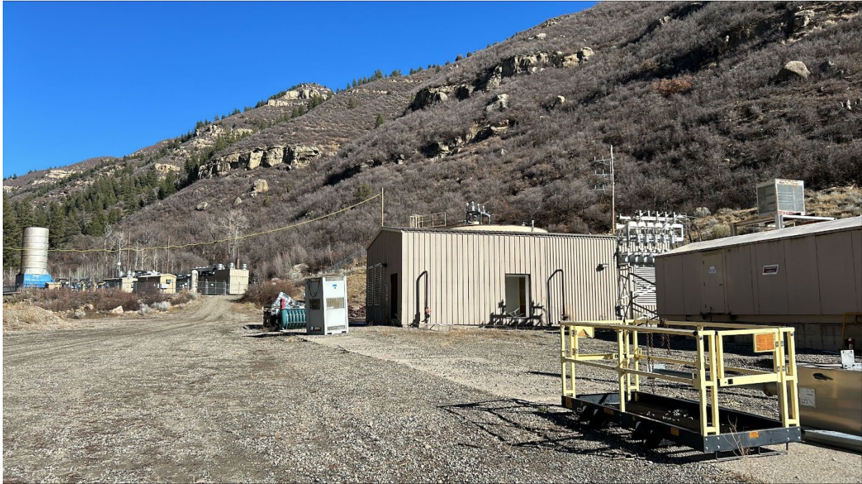
Figure 1: Upper pad (1)