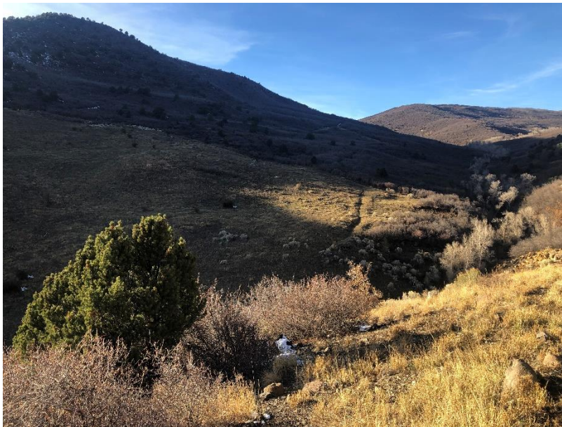
Reclaimed road at the West Mine

Number of Partial Inspection this Fiscal Year: 3