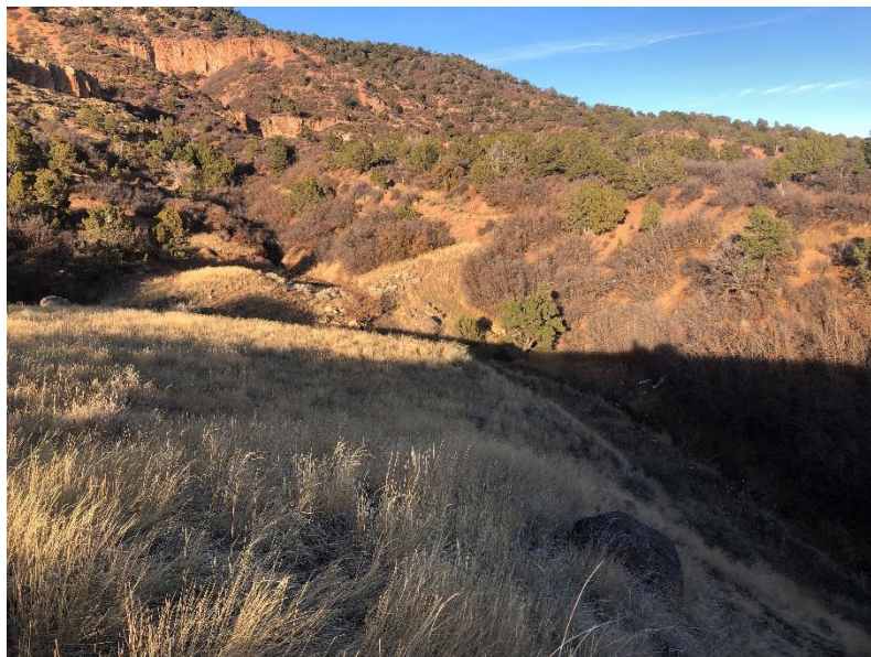
East Mine, looking toward reclaimed Pond 1