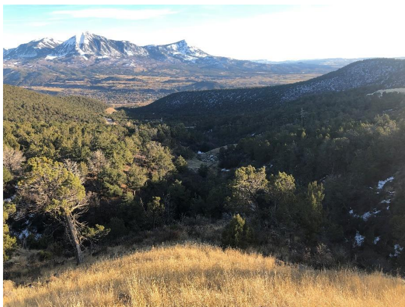
East Mine, looking toward reclaimed Ponds 3 and 4

Number of Partial Inspection this Fiscal Year: 3