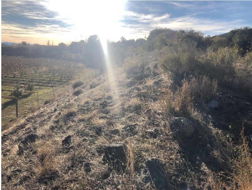
Slope below the loadout