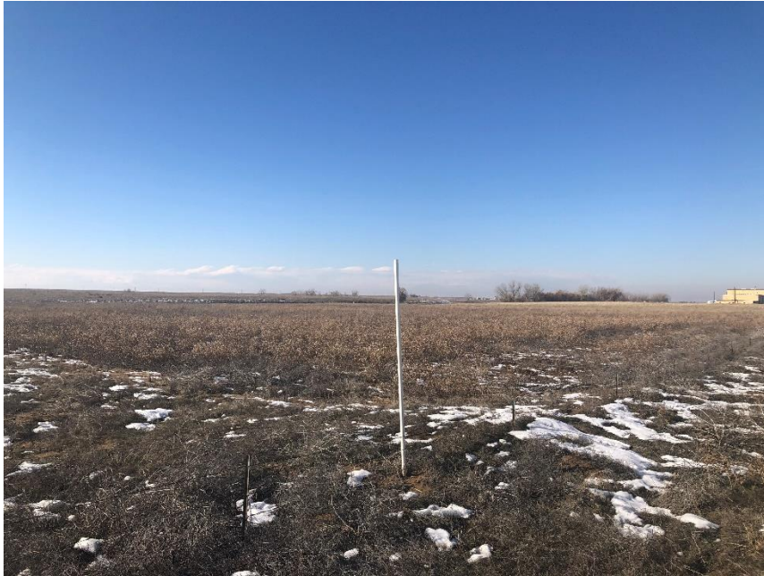
Southest corner of site (Area 34)