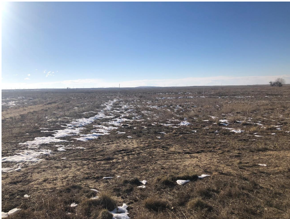
Area west of entrance gate

Number of Partial Inspection this Fiscal Year: 3