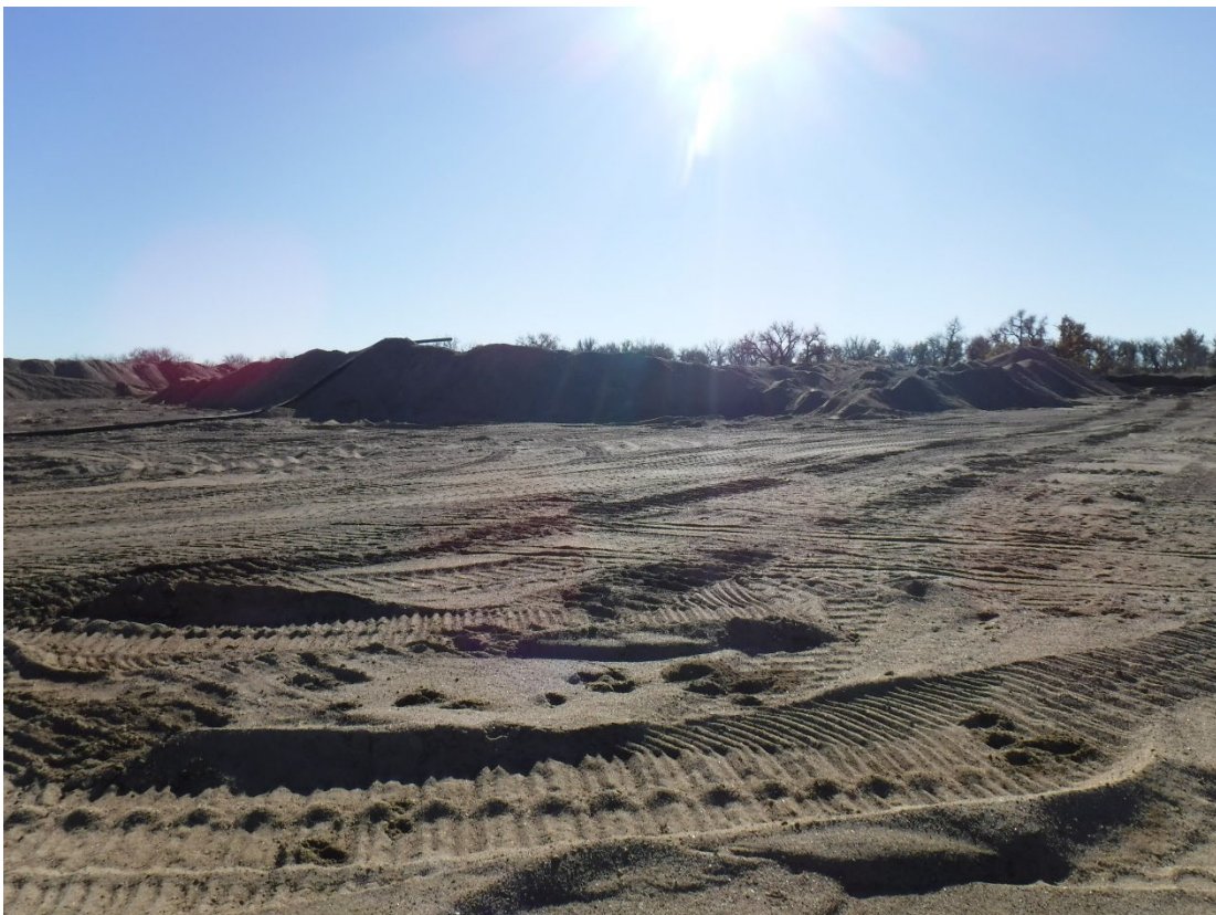
Photo 6: Water processing pond located south of the screening operations