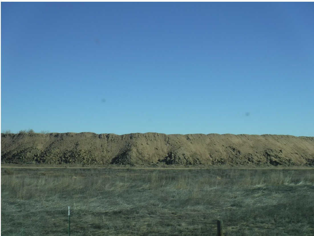
Photo 4: Topsoil stockpile area in the Central Field North Section Area