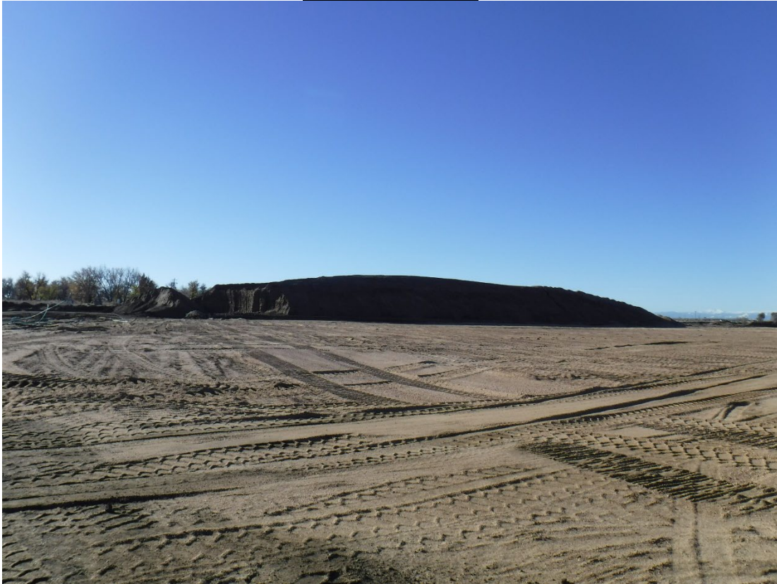
Photo 1: Topsoil stockpile located near what will be the primary mine entrance