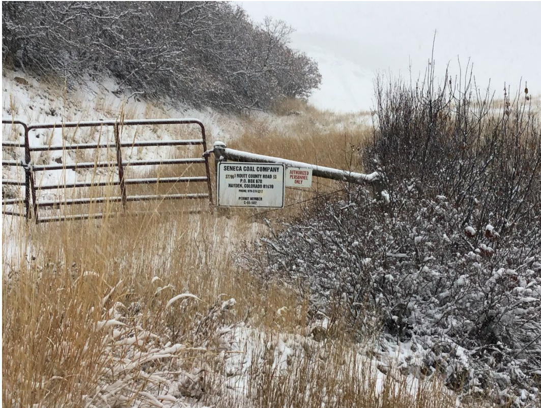
Photo 1: Yoast permit identification sign below pond 12 on County Road 37.

Number of Partial Inspection this Fiscal Year: 4